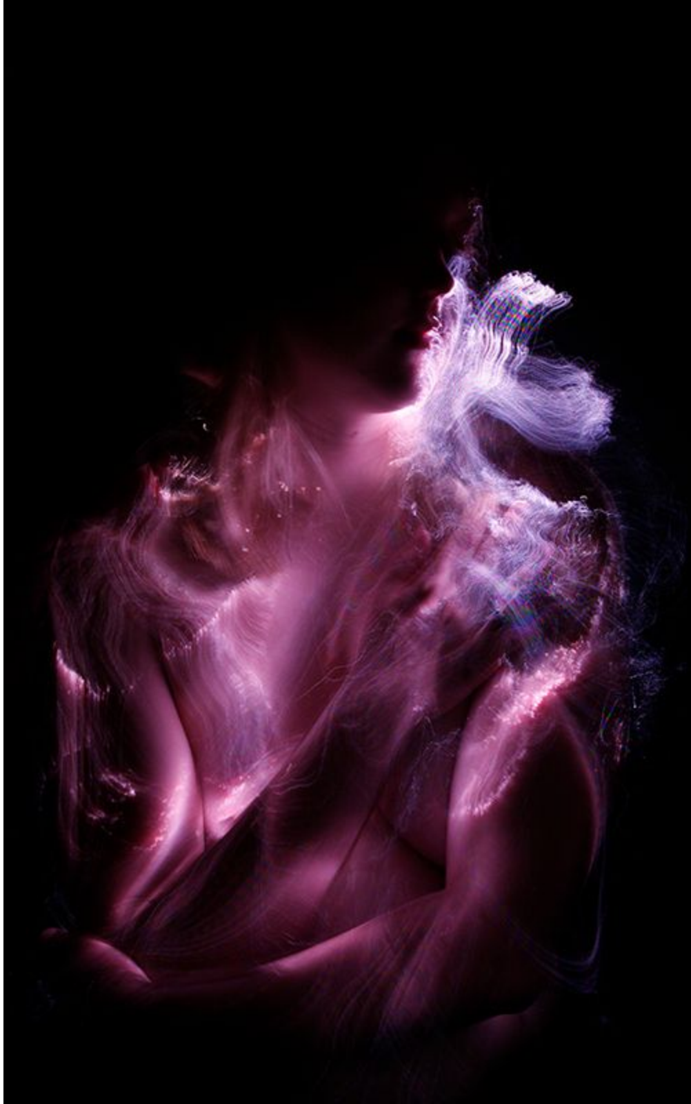
Figure 2: It's Amazing You're Still Here