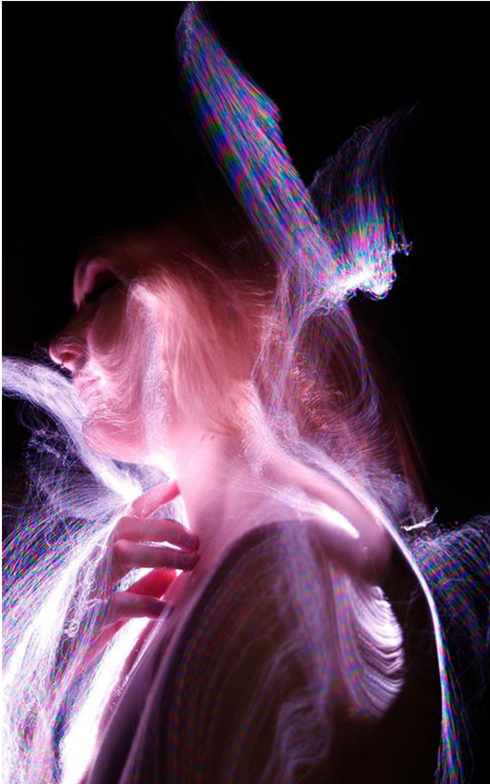
Figure 1: Nefelibata