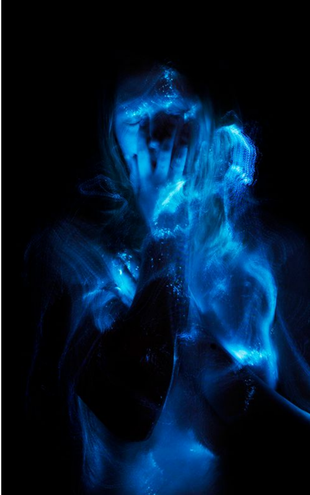
Figure 3: Sharks In Pool of Thought