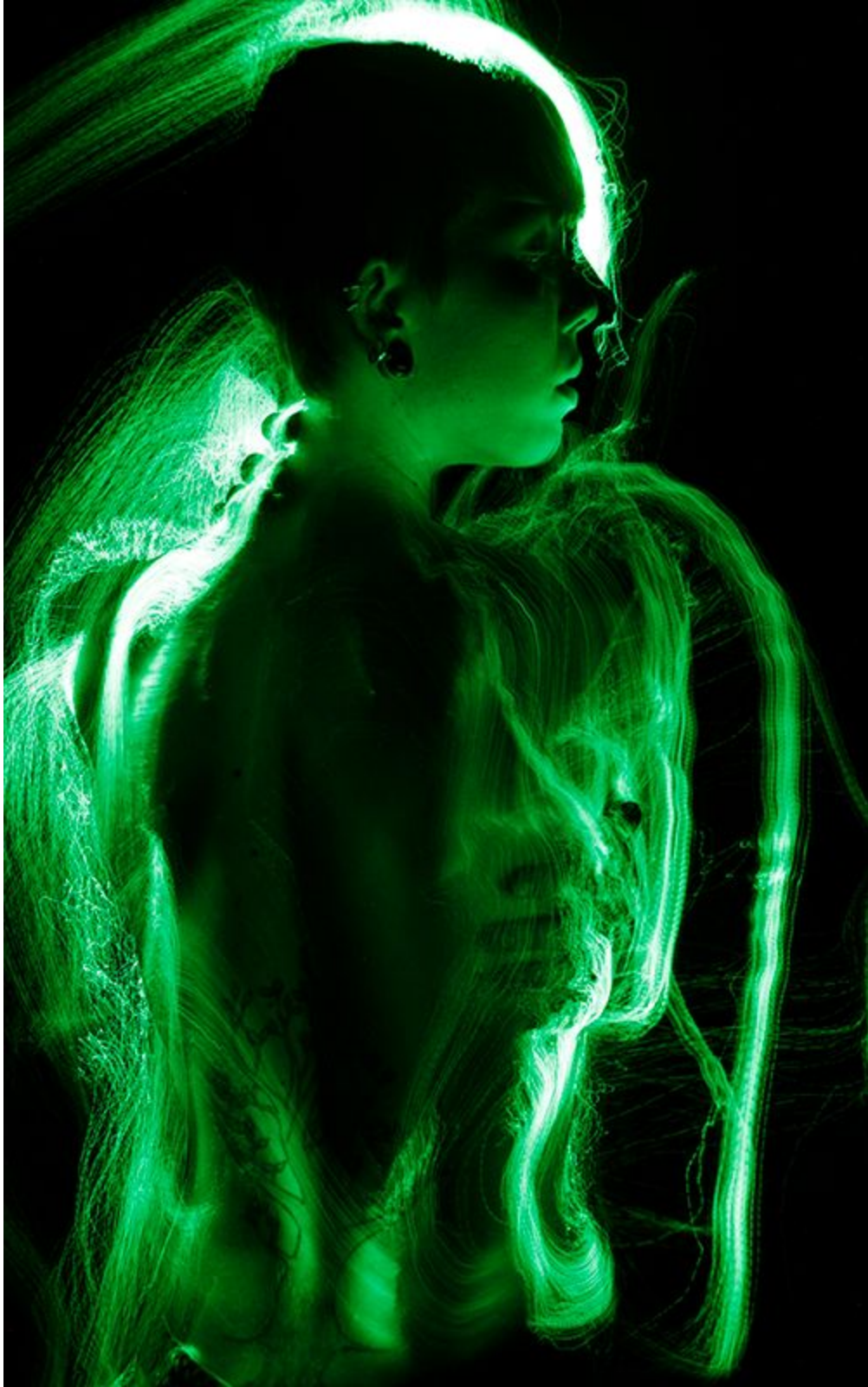
Figure 5: Then Apply Pressure