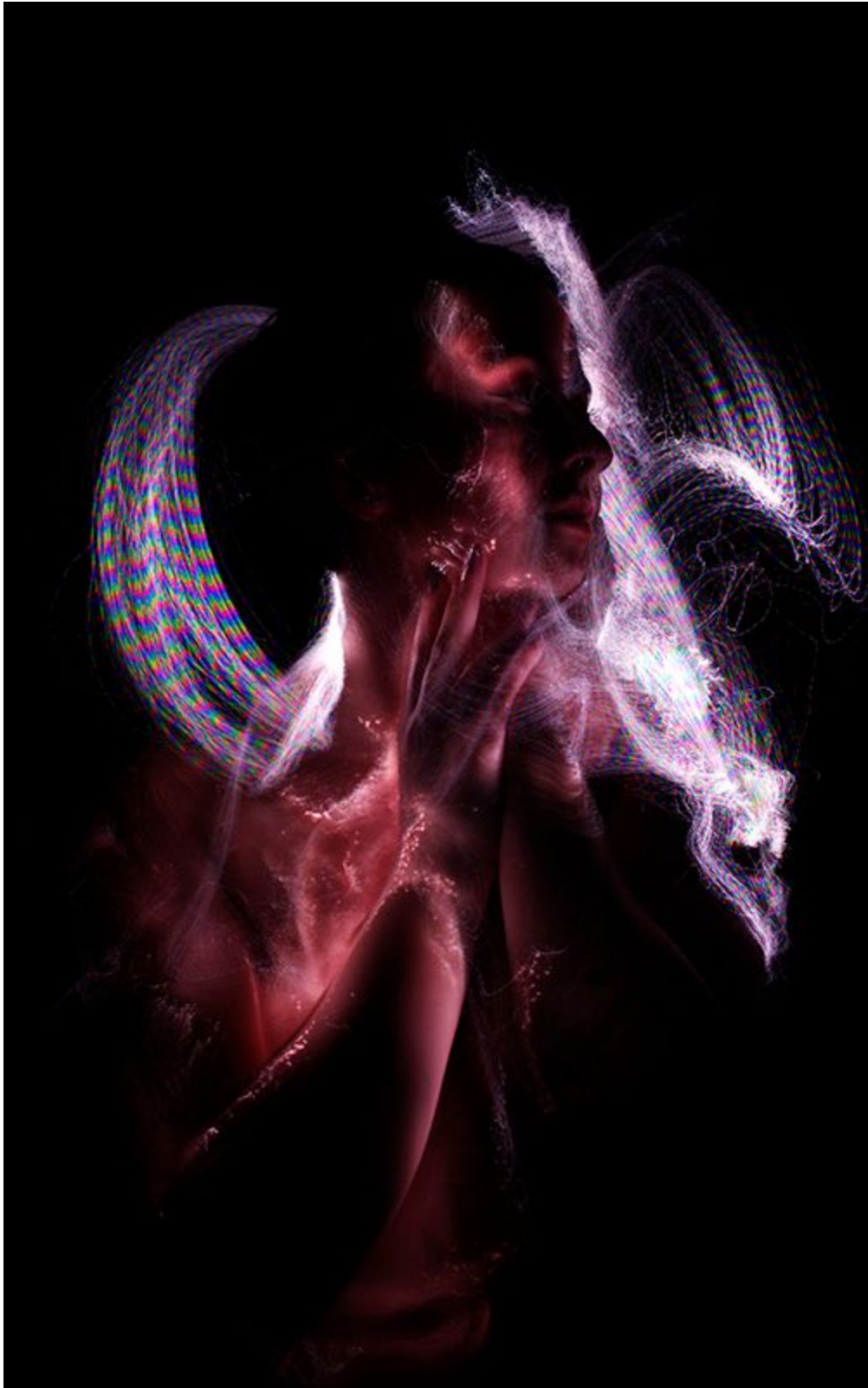
Figure 8: This Is Not A Swan Song