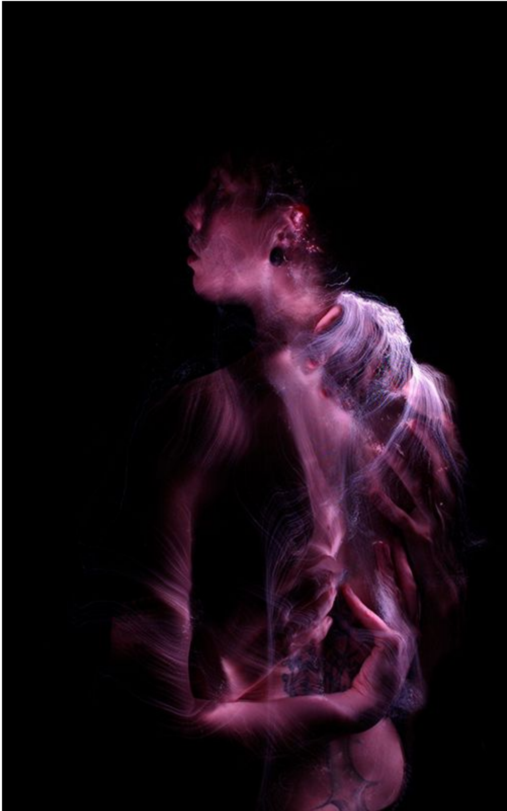
Figure 9: Turn Off the Lights I'm Watching Back to the Future