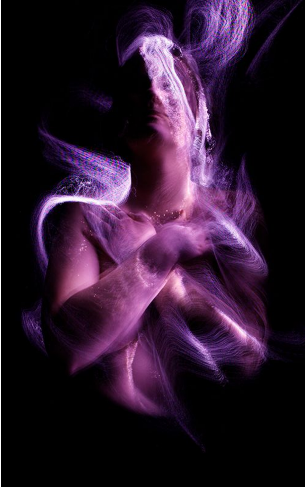
Figure 6: Fluoresce