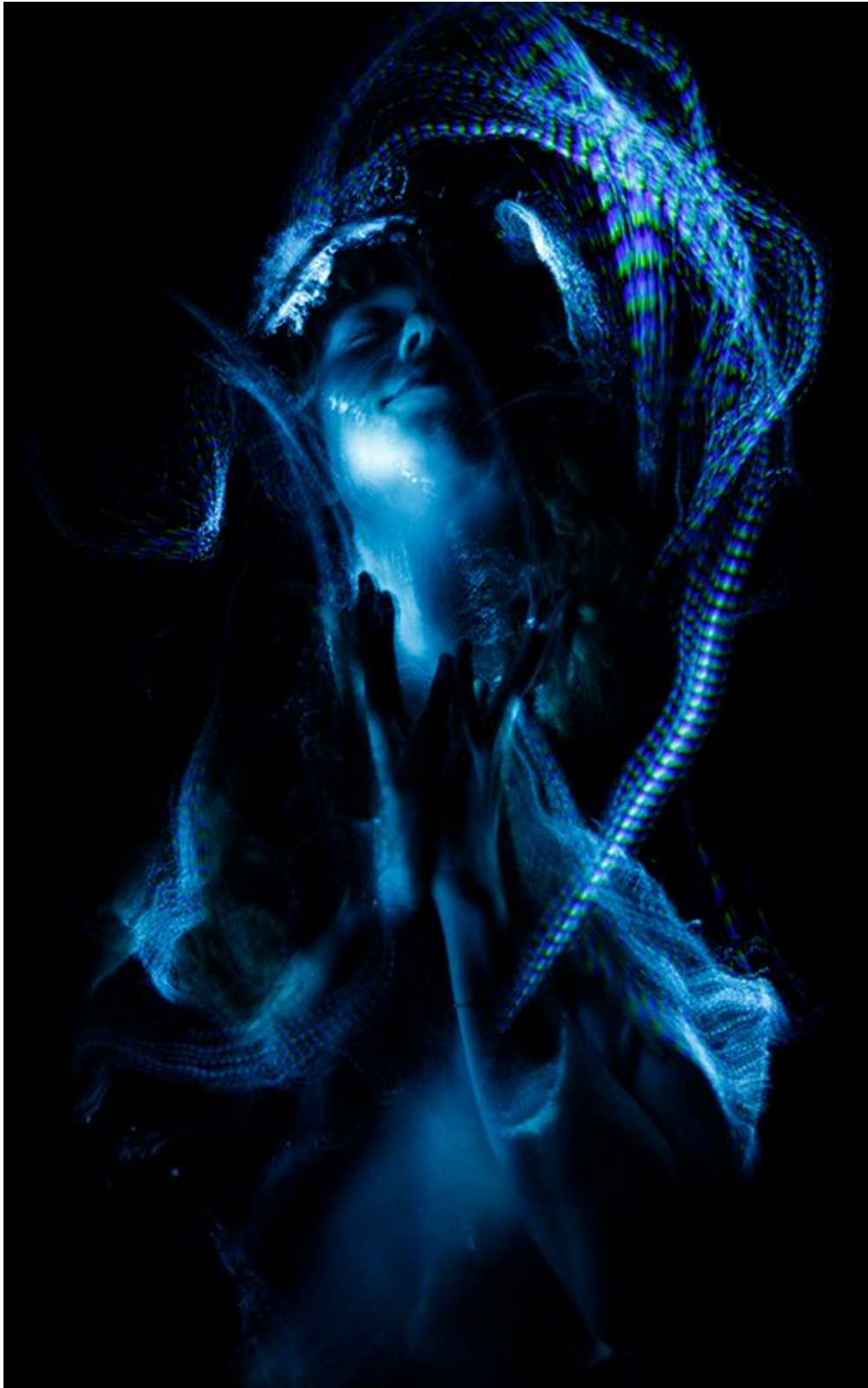
Figure 7: "I Want To Be Mother Nature"