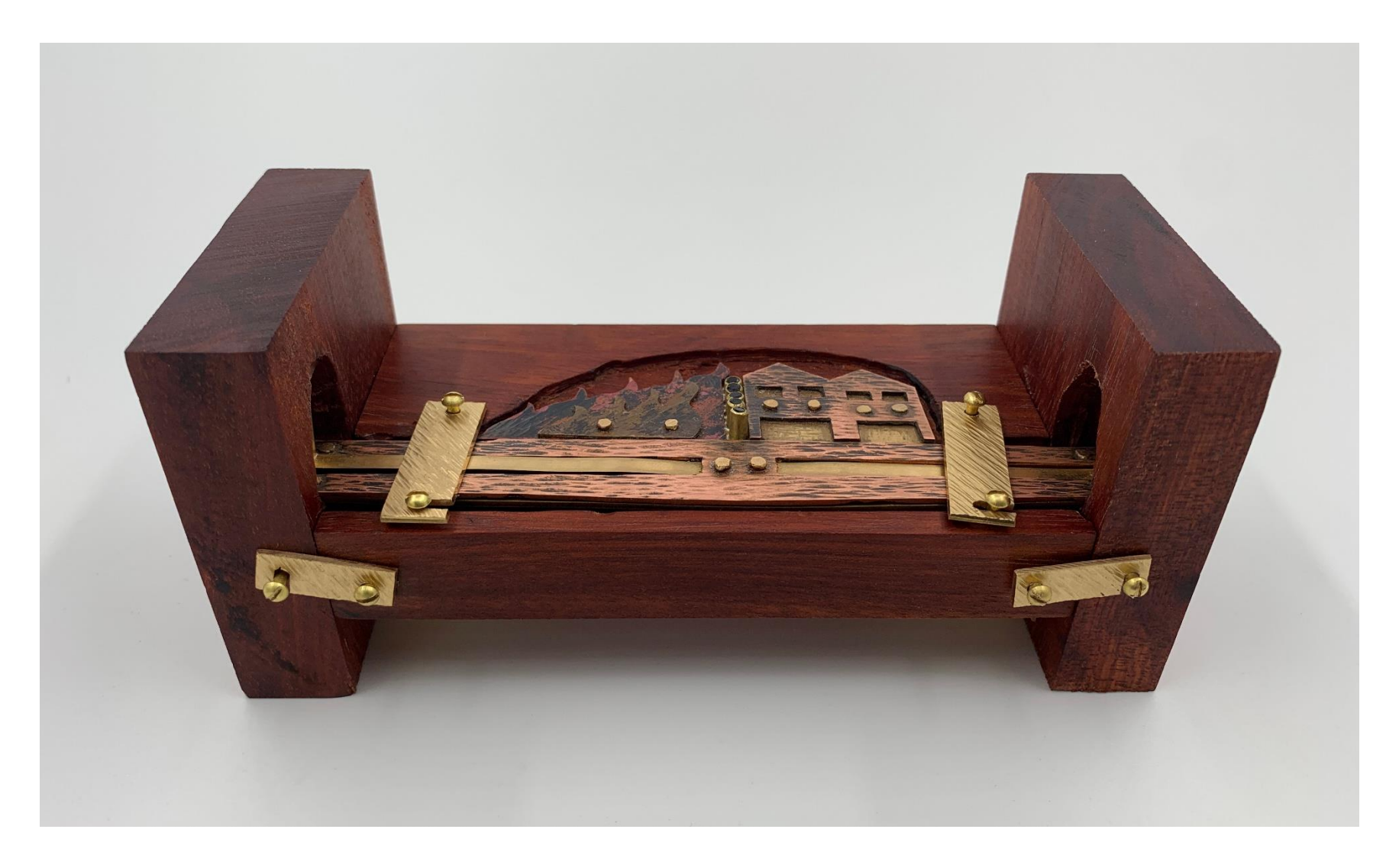
Figure 1: Marshall Harp