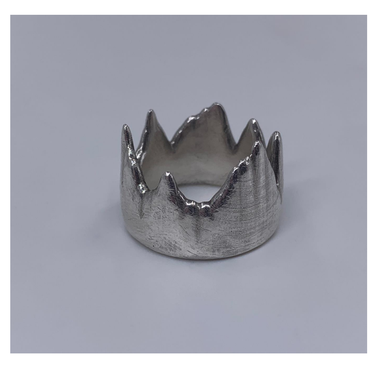
Figure 3: Stalactite Crown Ring