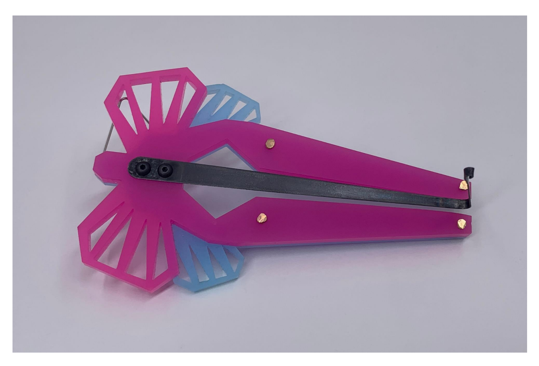
Figure 6: Butterfly Harp