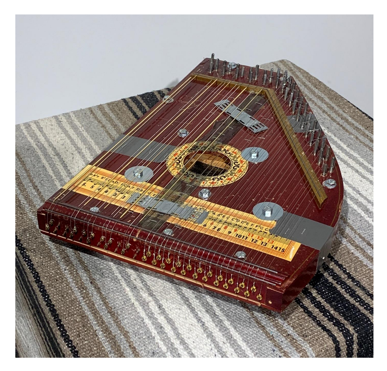
Figure 7: Portrait of a Former Self (Quick Fixes)