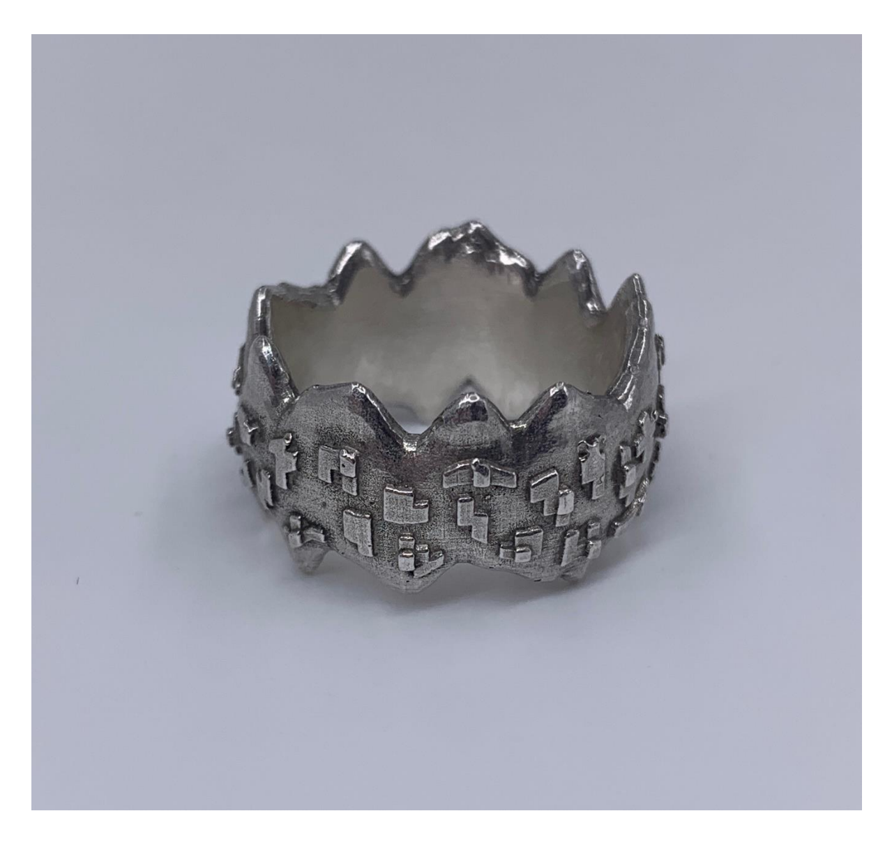
Figure 5: Pentomino Ring