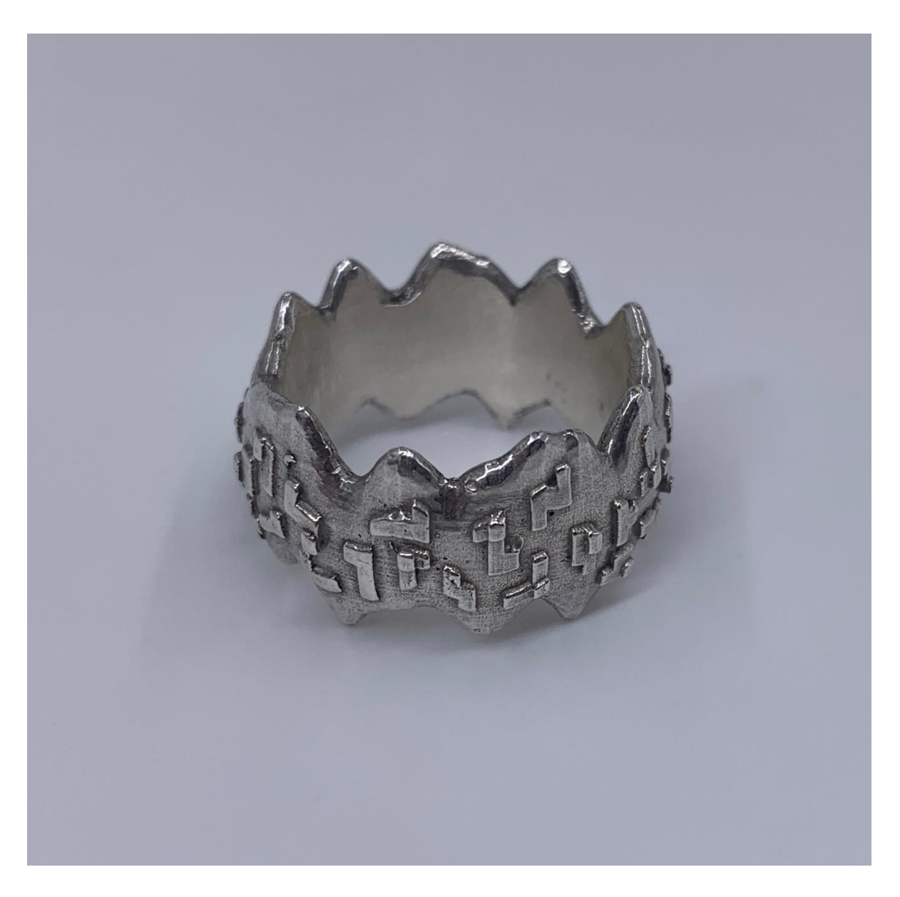
Figure 4: Pentomino Ring