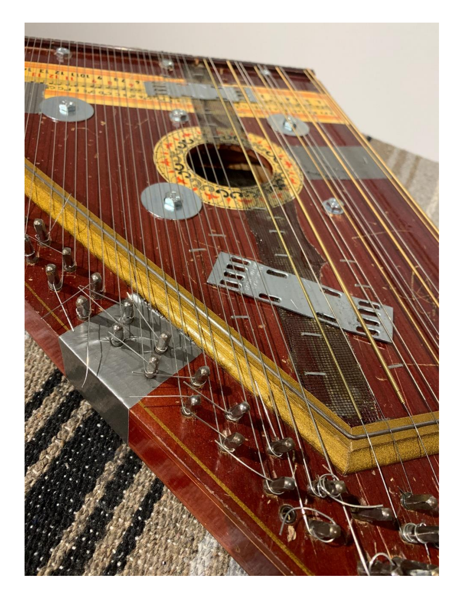
Figure 10: Portrait of a Former Self (Quick Fixes)