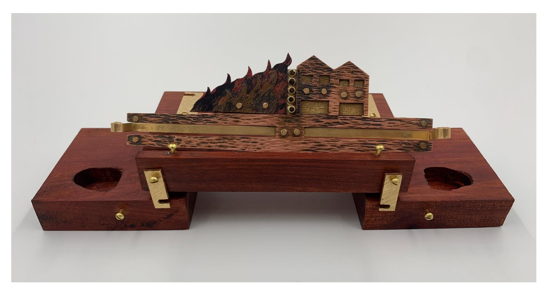
Figure 2: Marshall Harp