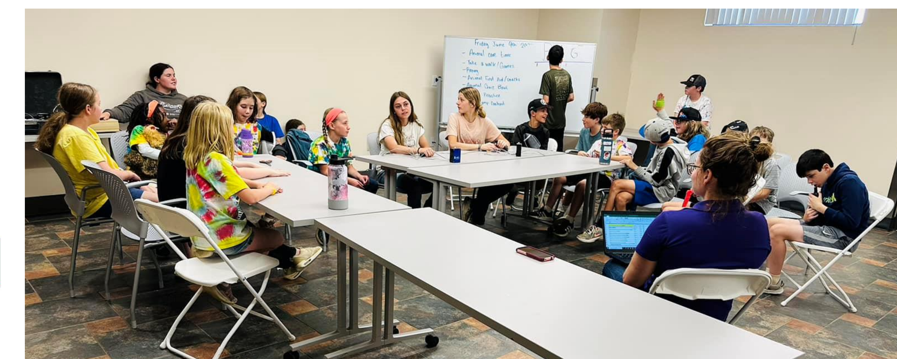
Urban Ranchers Summer Program. End of the week quiz to discuss knowledge