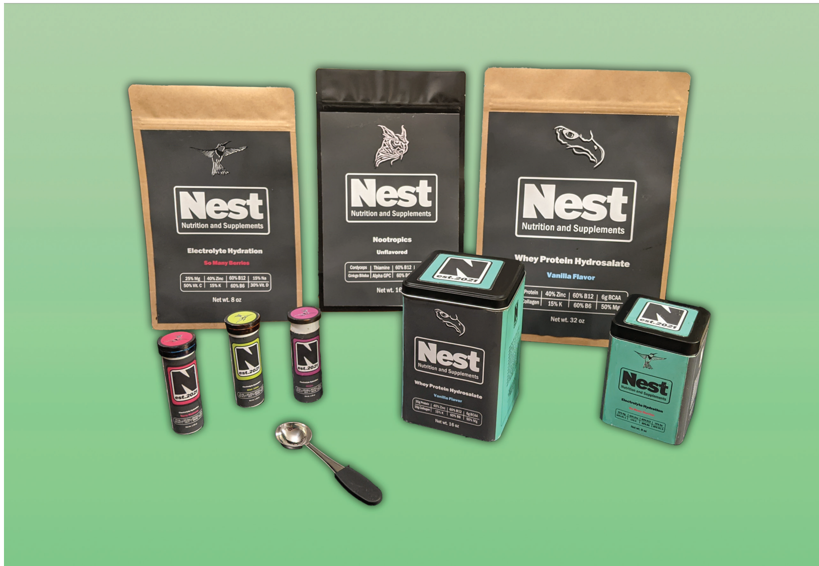
Figure 3: Nesting Branding and Packaging