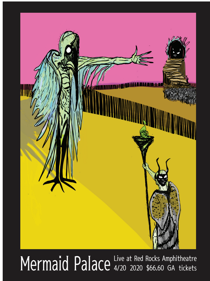
Figure 2: Mermaid Palace Concert Poster