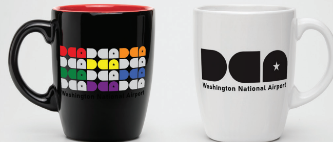
Figure 5: DCA Rebrand