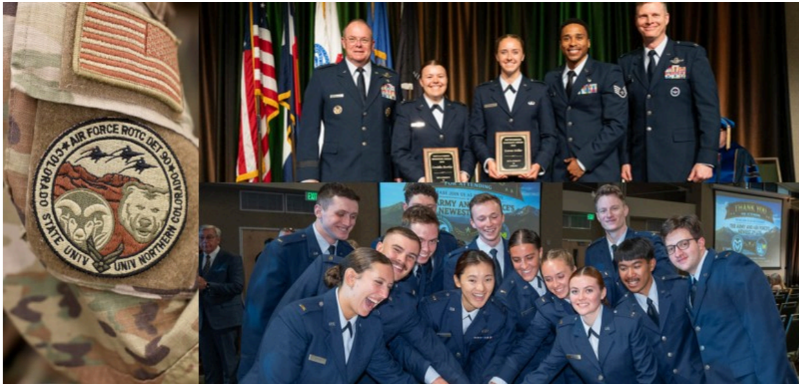
CSU Air Force ROTC was named the region's best for the seventh time.