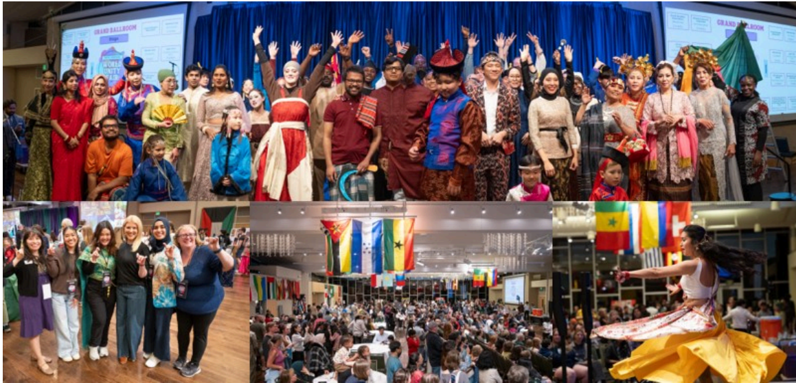
For the 70th year, CSU's World Unity Fair welcomed thousands of community members of all ages for a vibrant celebration of global cultures. More than 70 countries were represented at this year's event.