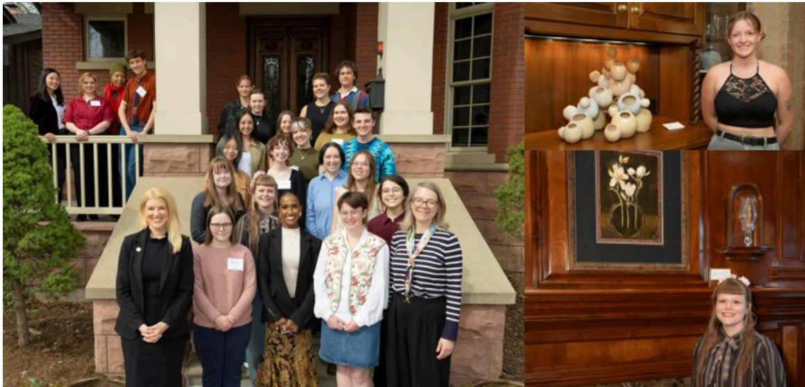
Selected student and alumni artwork is showcased in Magnolia House throughout the coming year as part of CSU's new President's Art Prize .