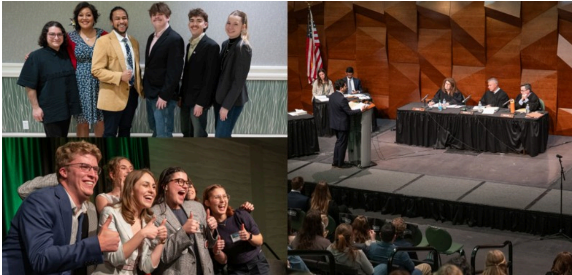
Semifinalists for the inaugural Colorado Democracy Prize were announced at CSU's third annual Democracy Summit this spring.