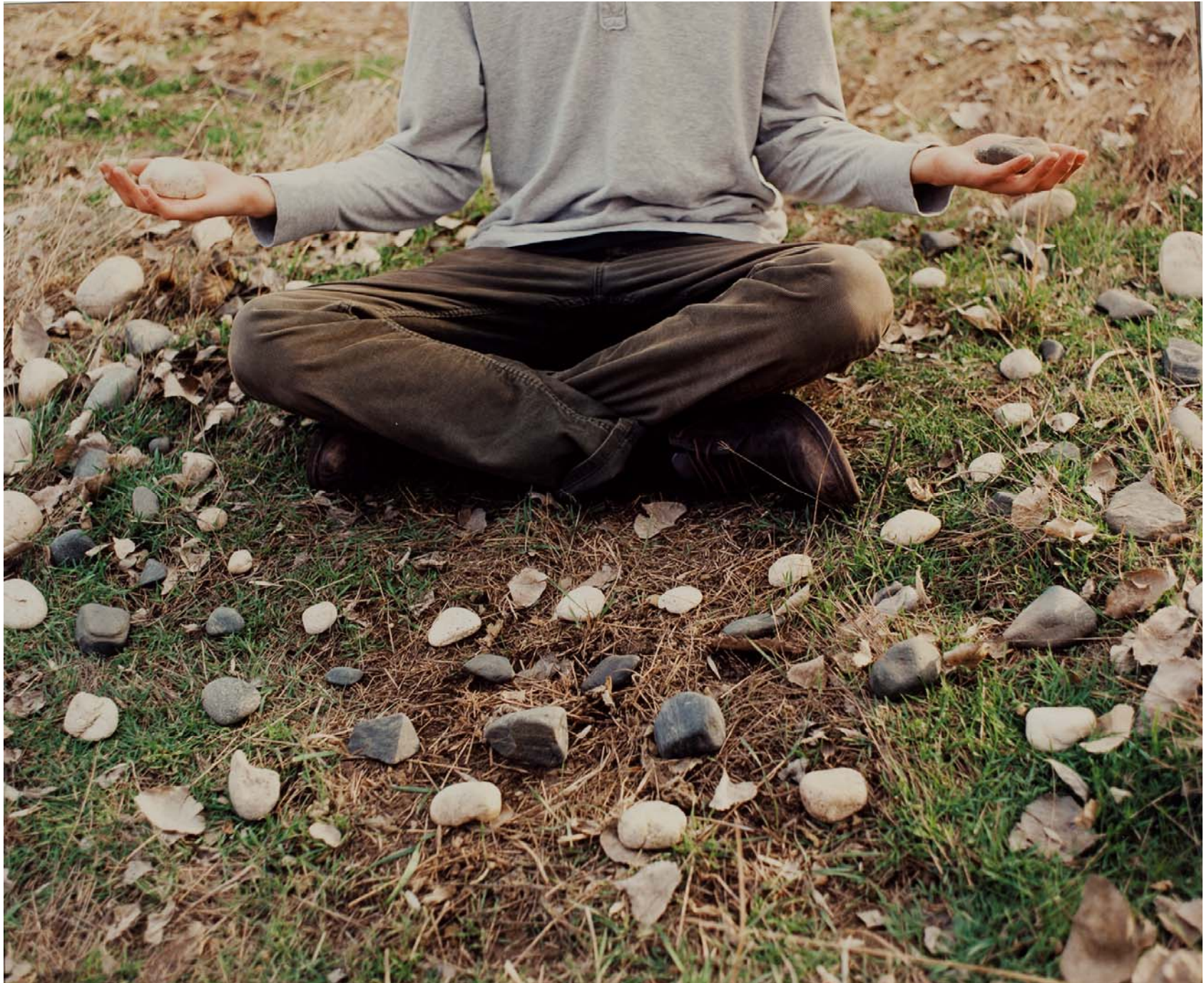
Figure 3: Early Spring Sings.