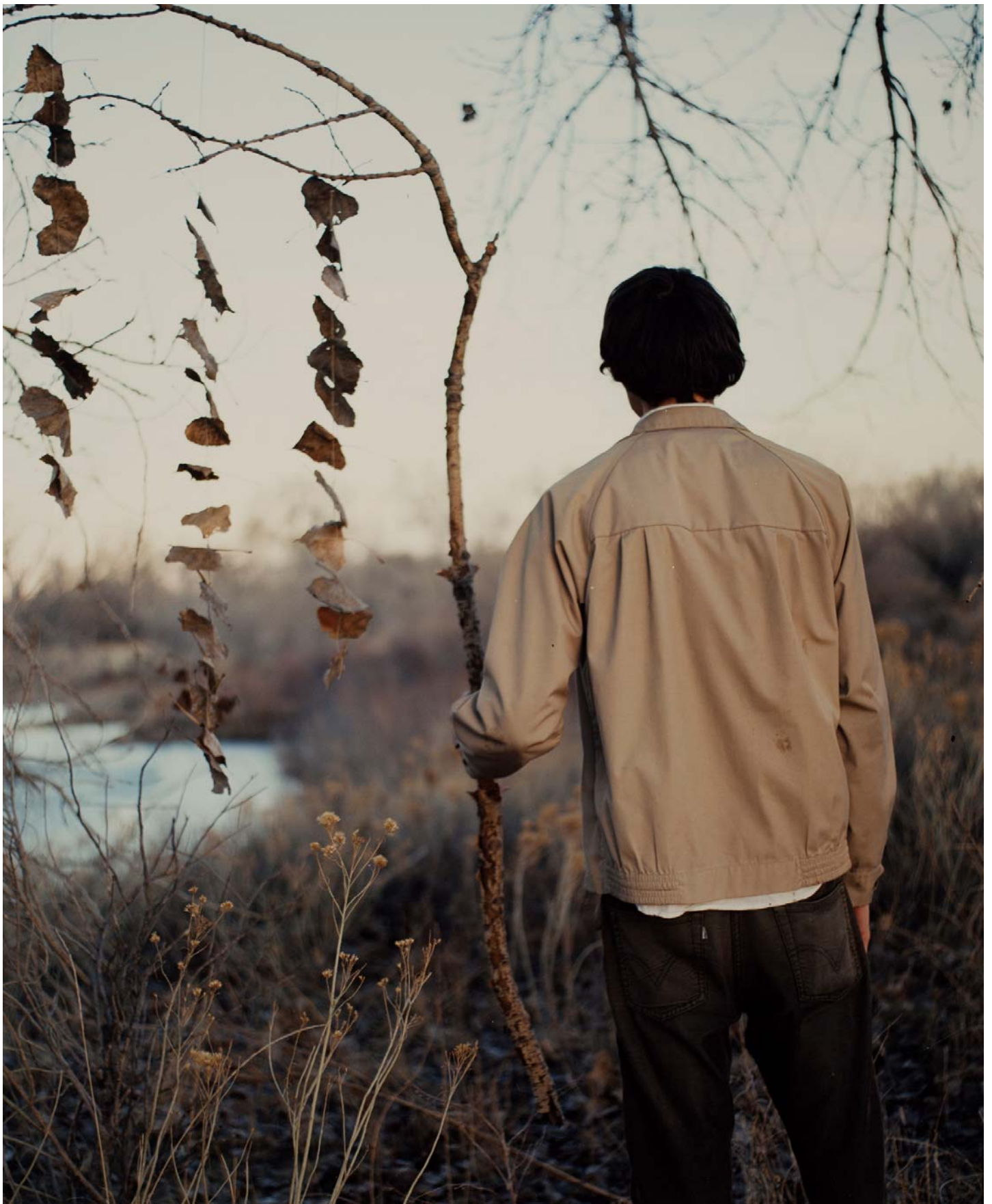
Figure 8: Live Like the Trees Pt. I.