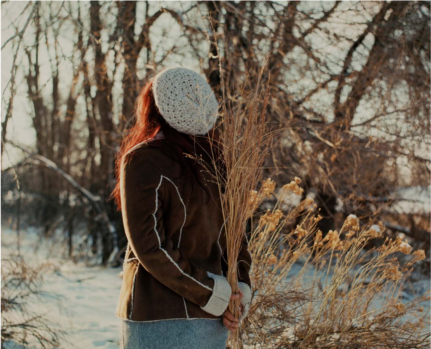
Figure 14: What is Held Behind the Back.