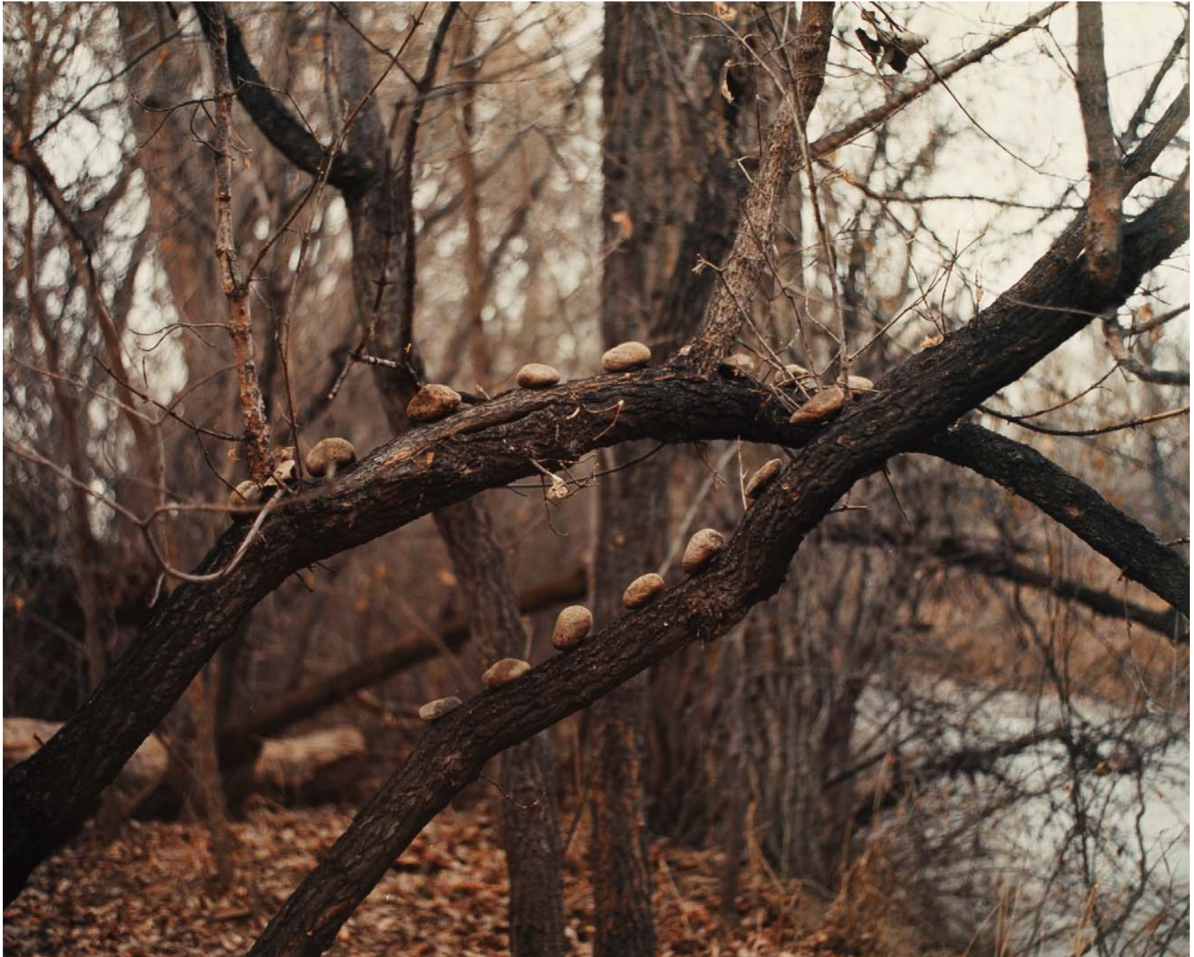
Figure 9: Live Like the Trees Pt. II.