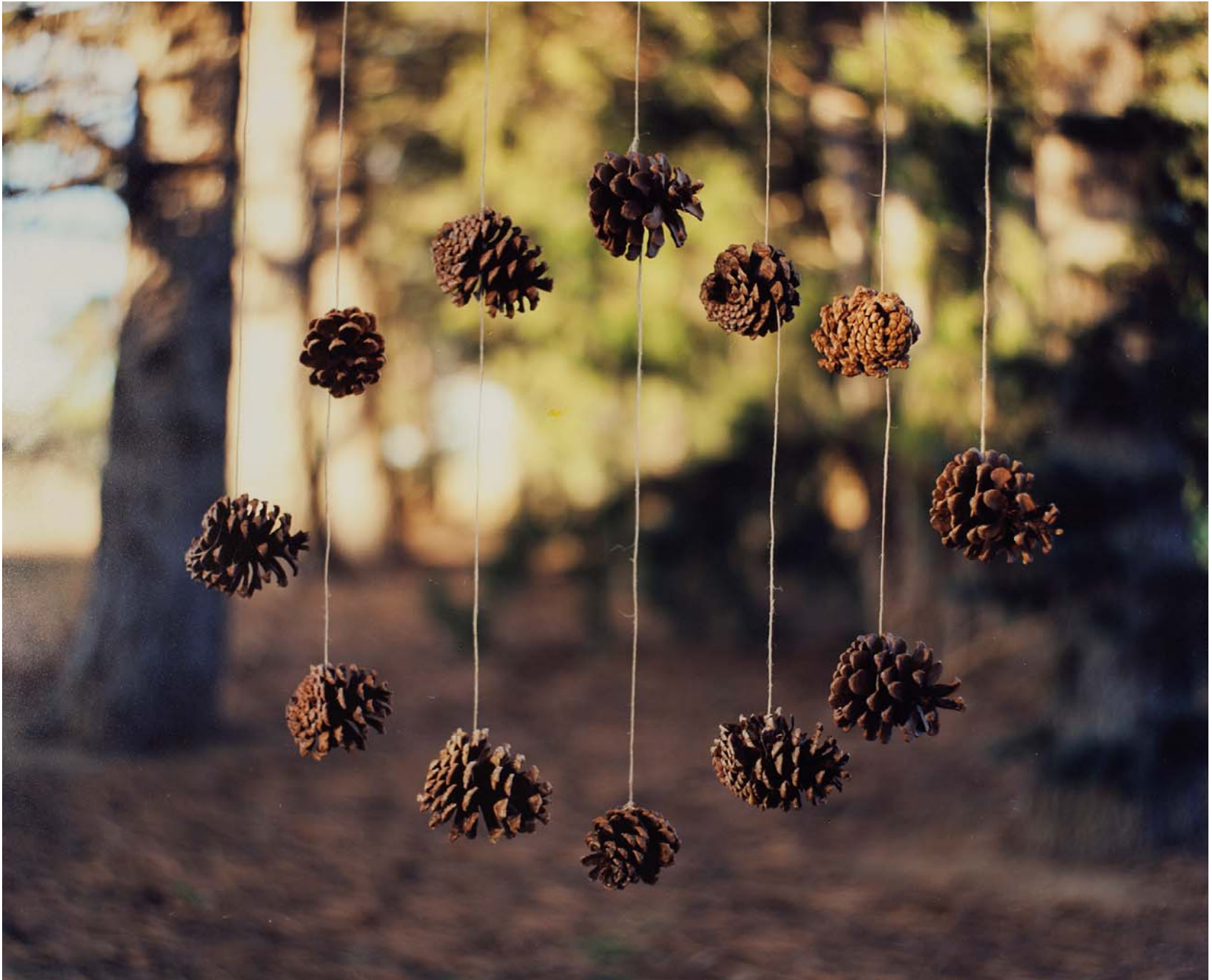
Figure 13: Tree Rings Pt. III.