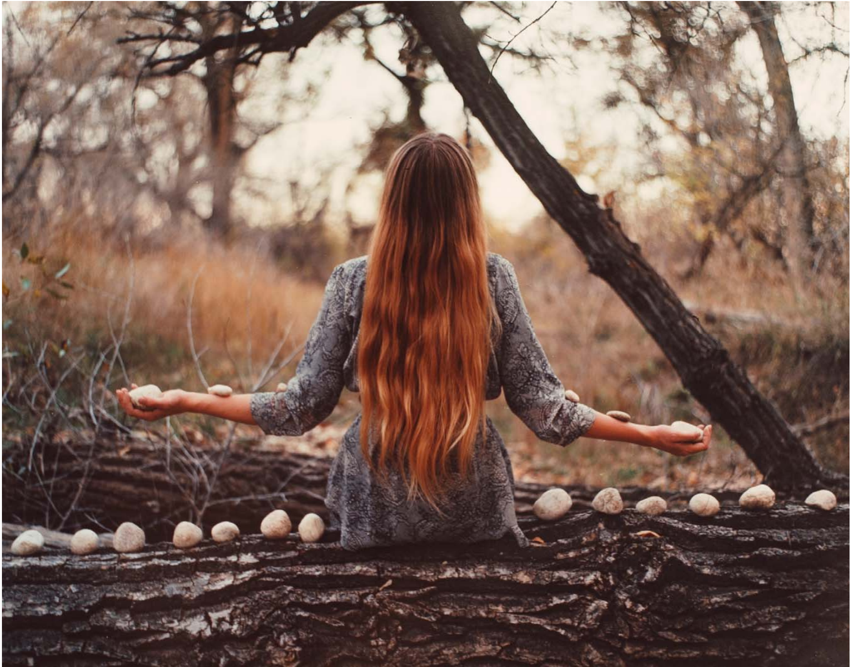
Figure 12: The Weight of an Uncertain Fate.