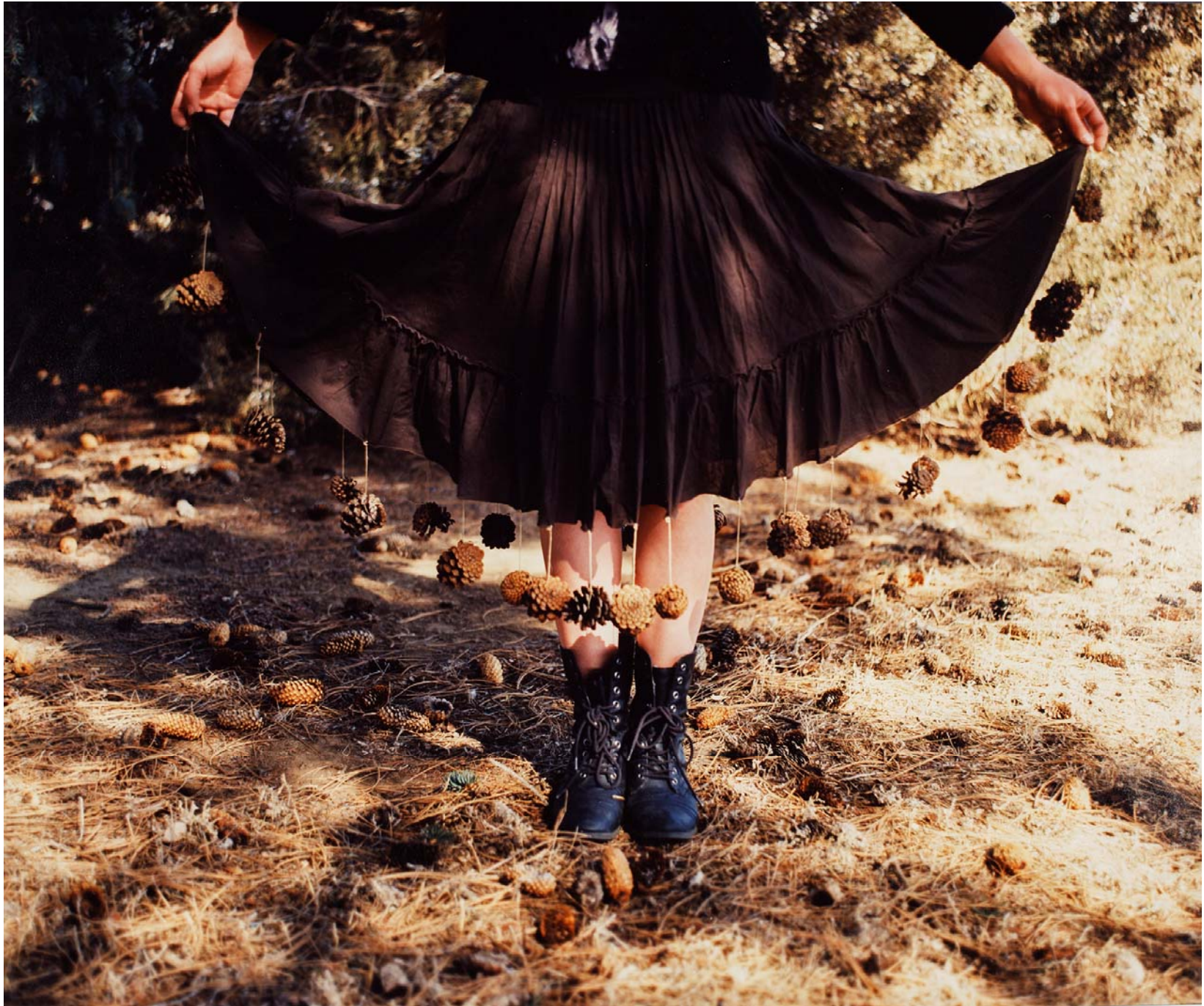
Figure 4: Hemmed in Harmony.