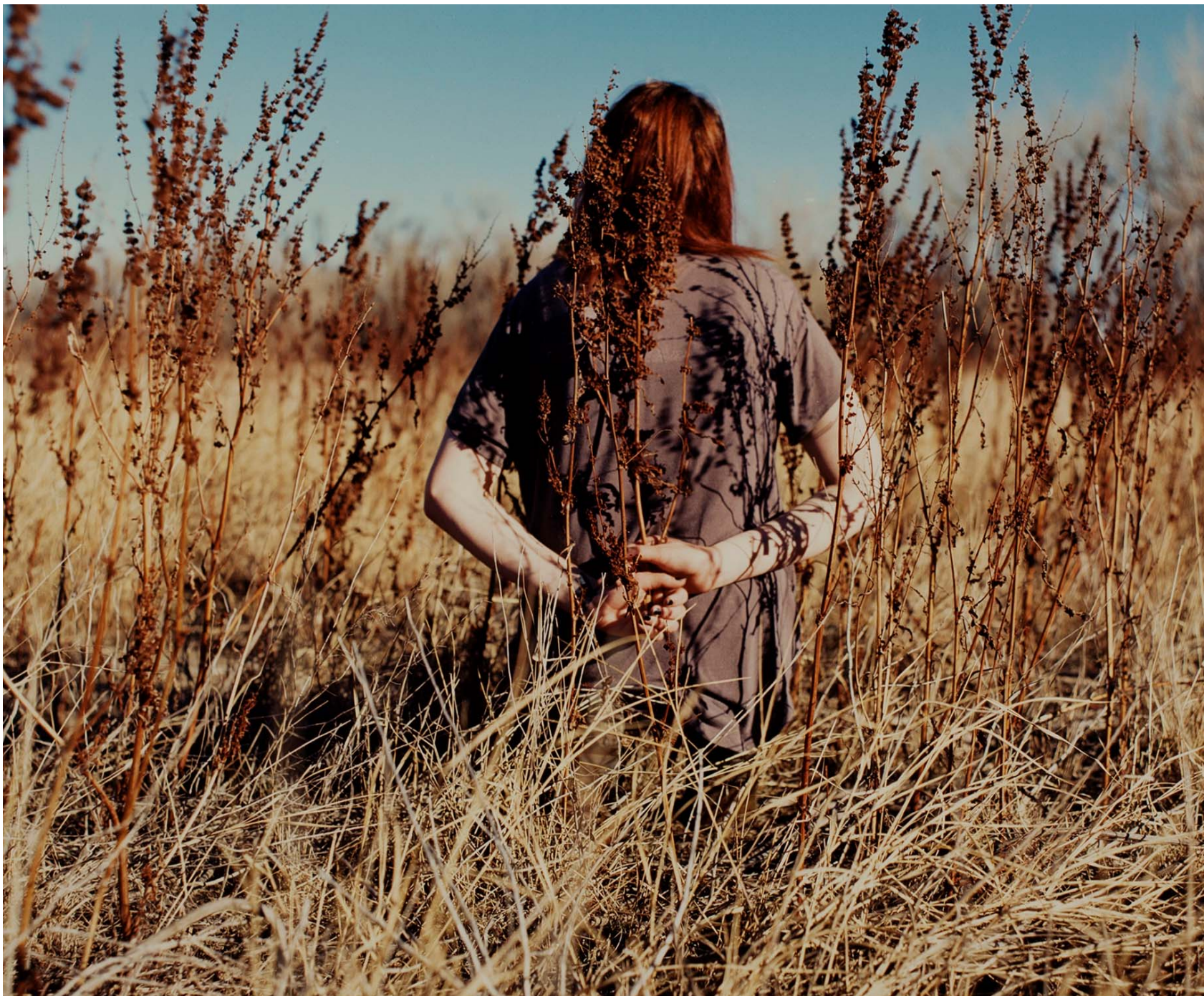
Figure 2: As the Wind Blows Over Open Meadows.