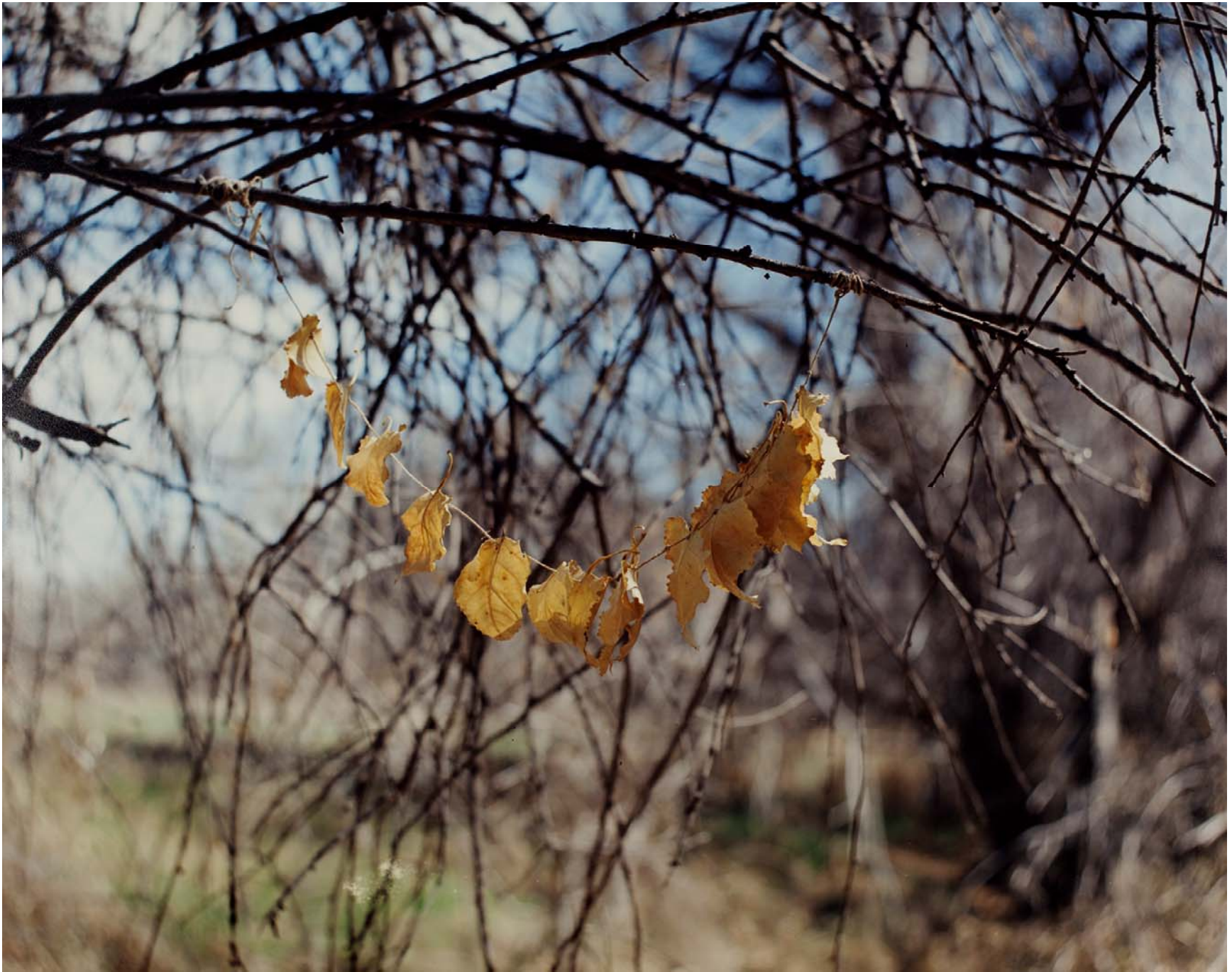
Figure 7: Linked Like Leaf Strings Pt. II.