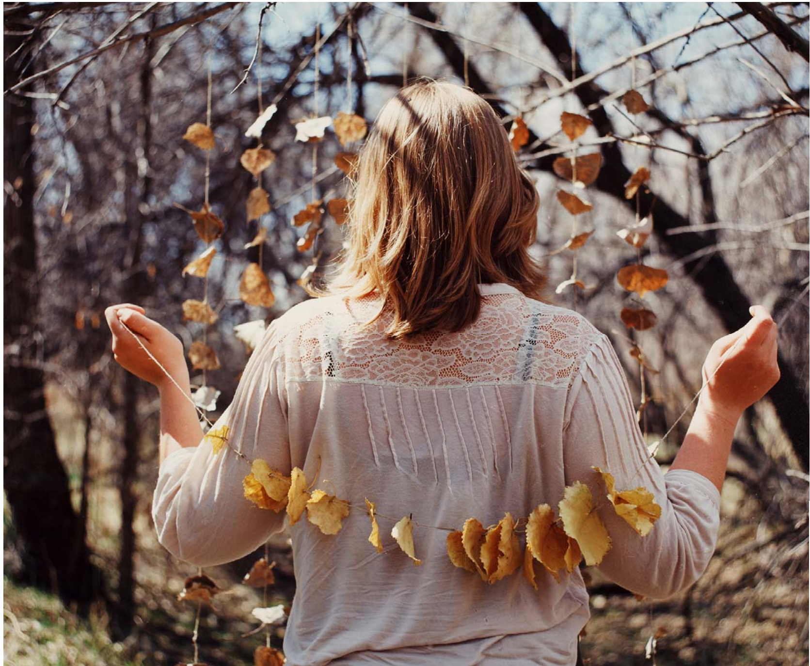
Figure 6: Linked Like Leaf Strings Pt. I.