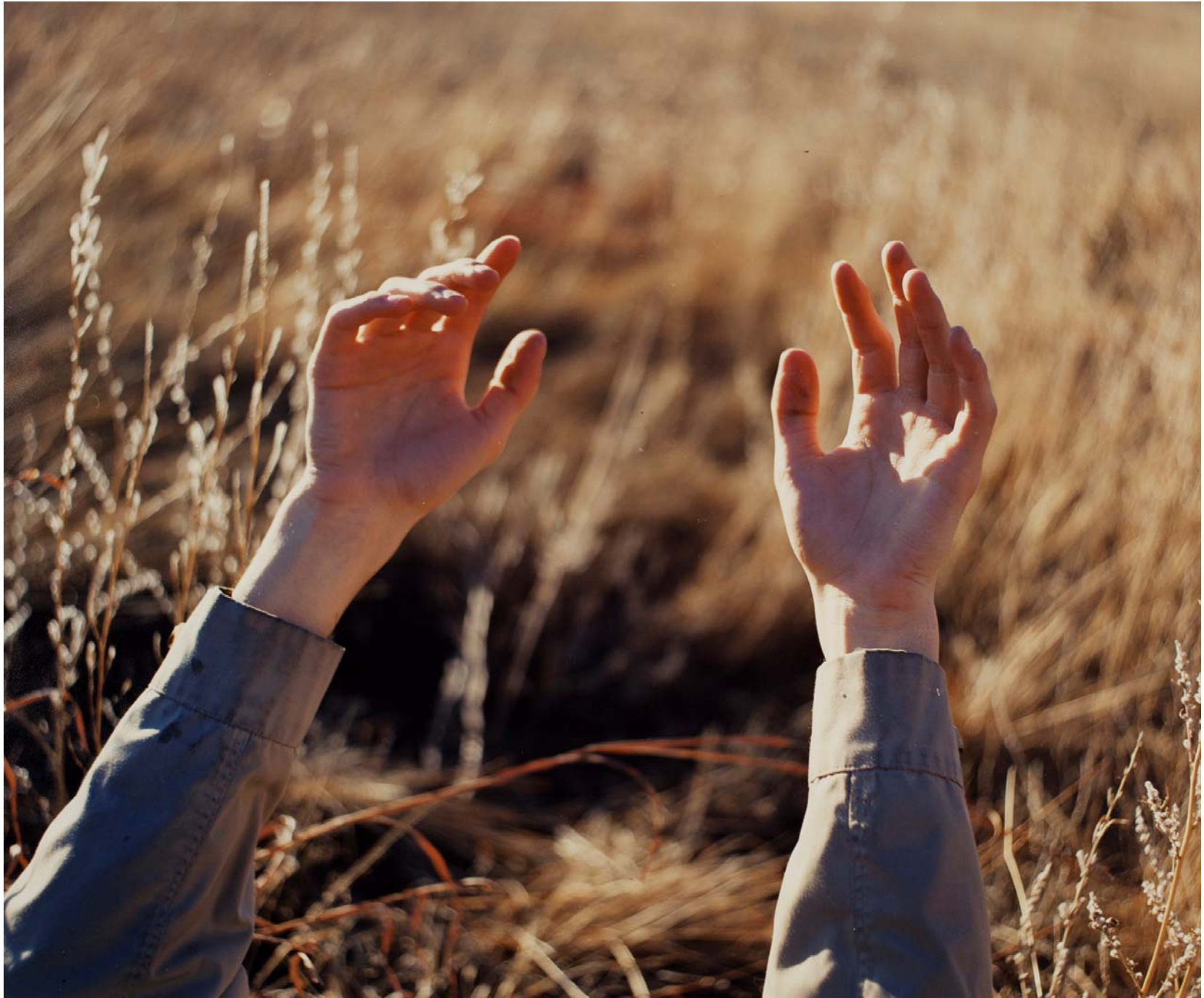
Figure 11: Signs of Surrender.