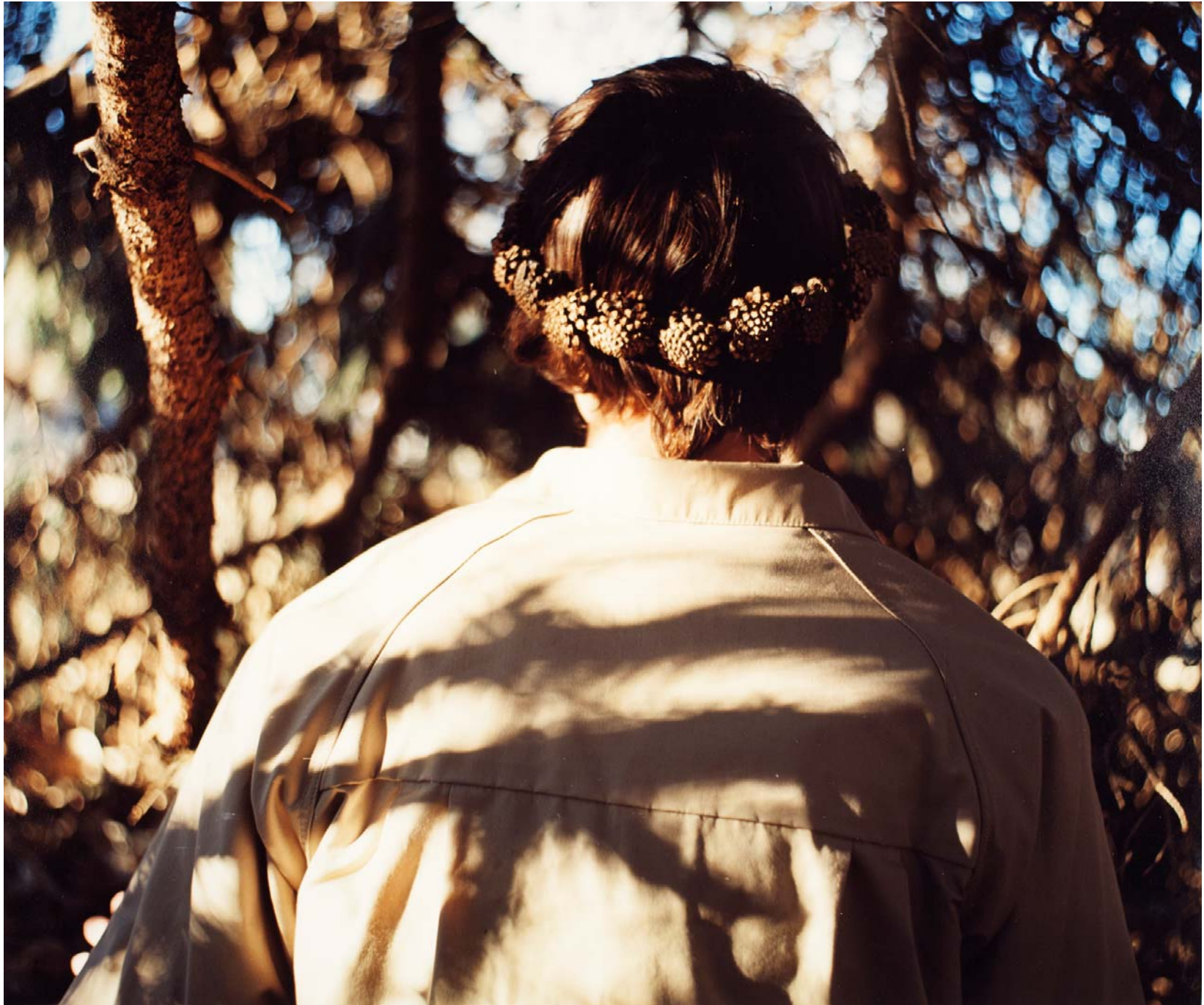
Figure 5: Learning to Let Go.