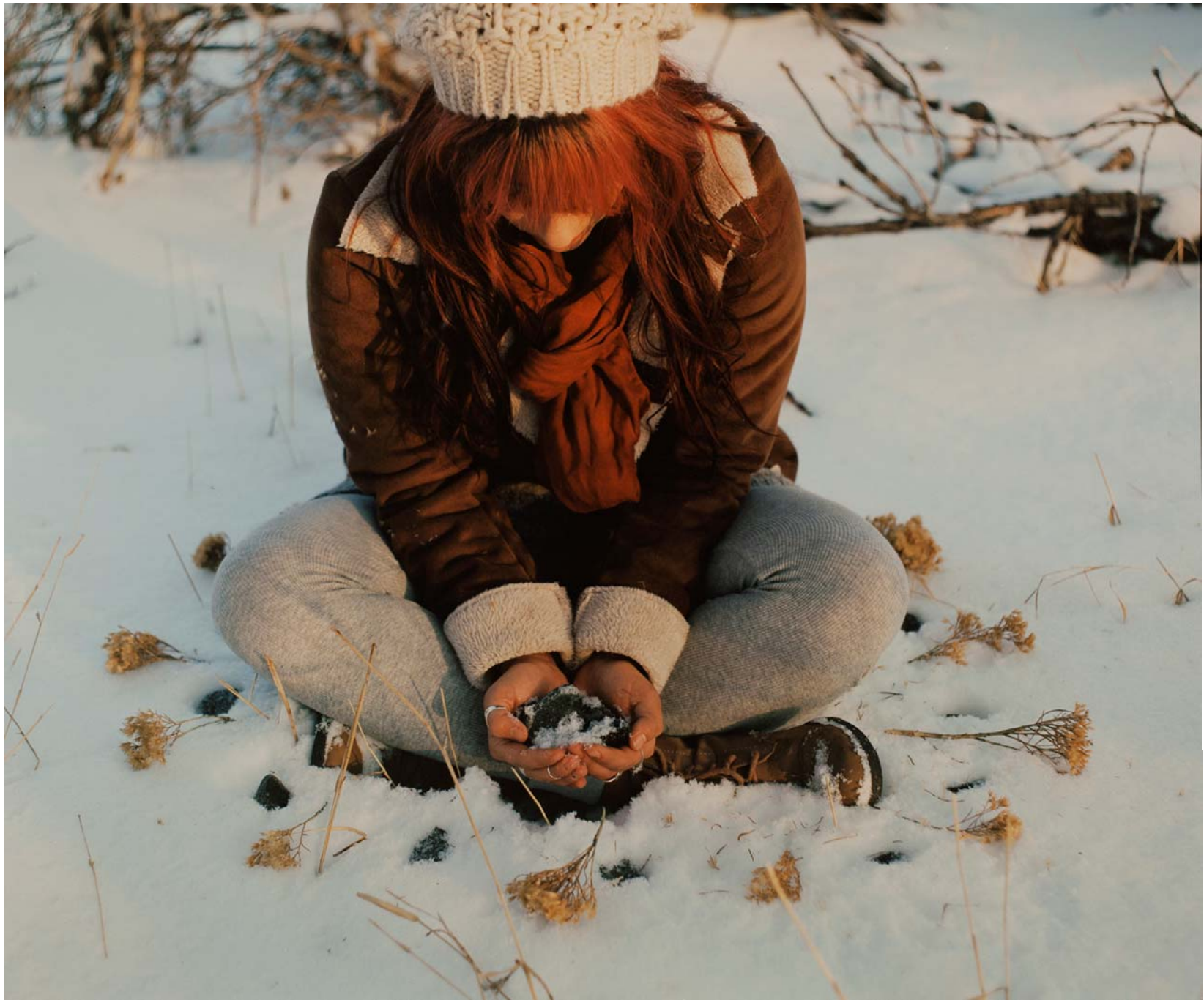
Figure 15: Winter's Wreath Pt. III.