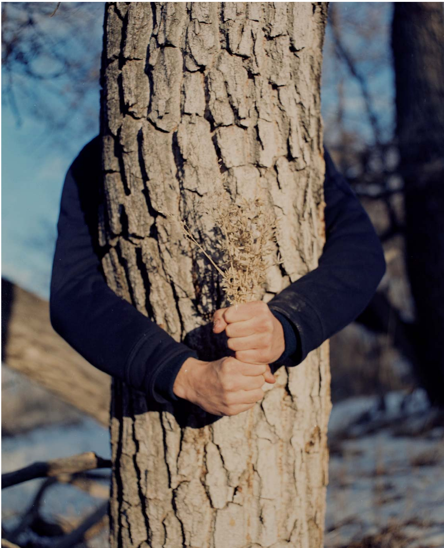
Figure 1: An Anonymous Offering.