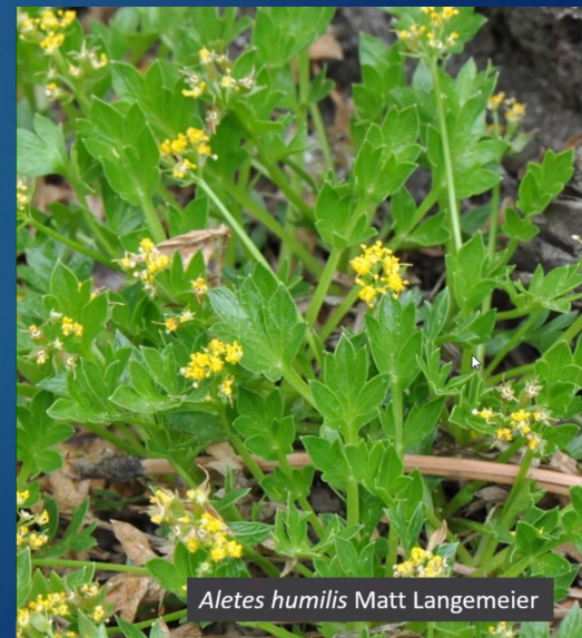
Aletes humilis