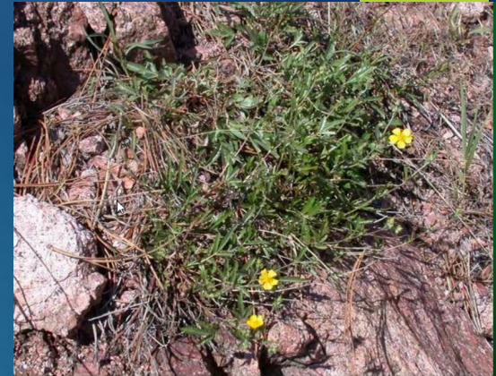
Potentilla rupincola