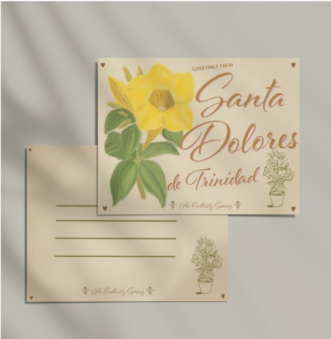
Figure 4: Postcard