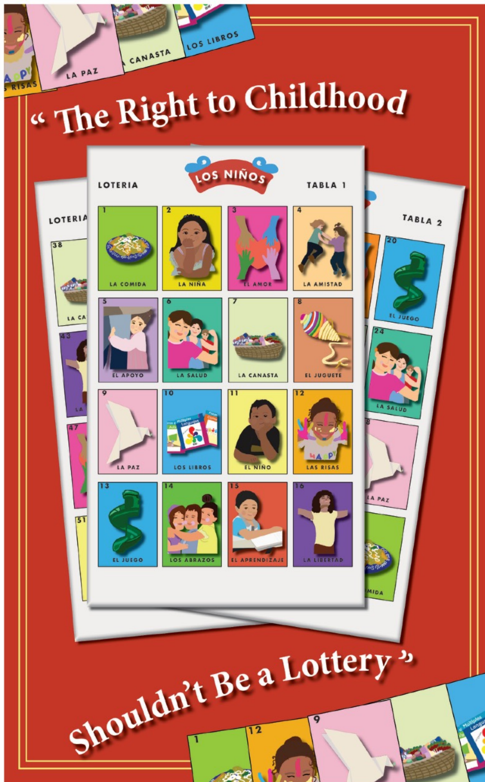
Figure 2: Mexico Poster