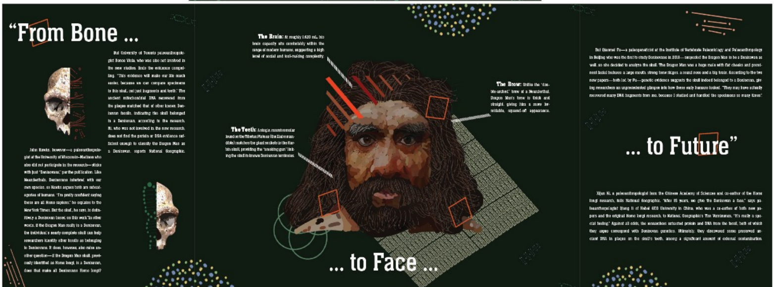
Figure 7: Science Article Magazine