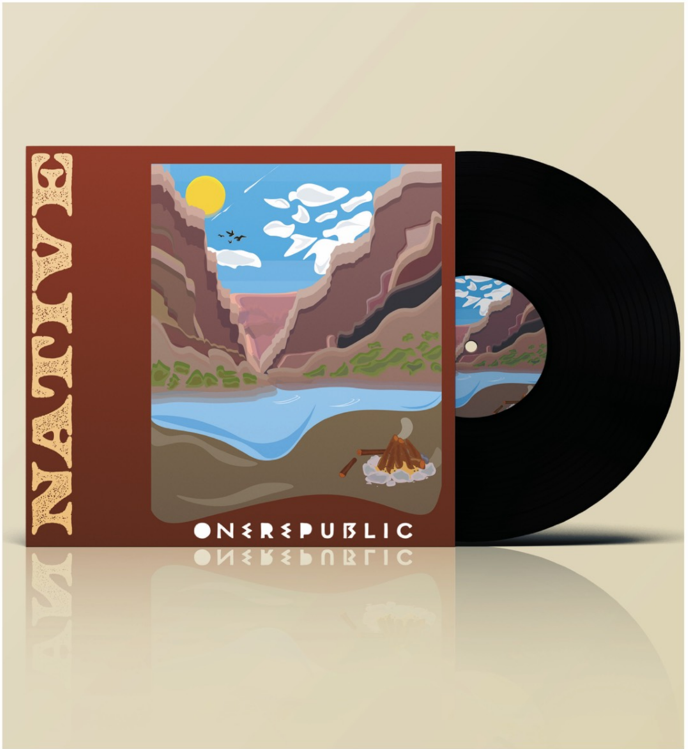
Figure 8: Colorado Band