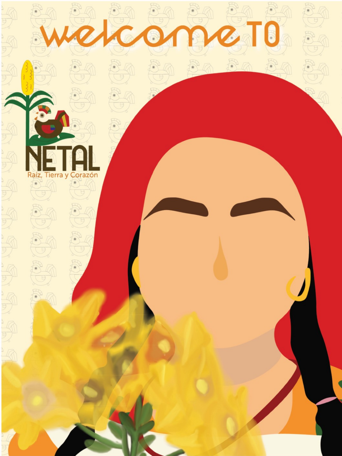
Figure 1: NETAL