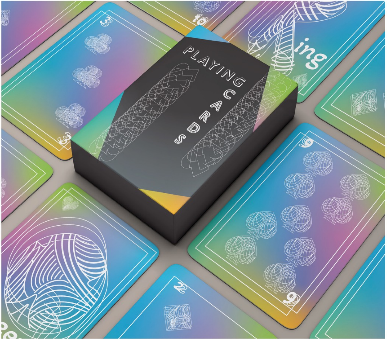
Figure 6: Deck of Cards