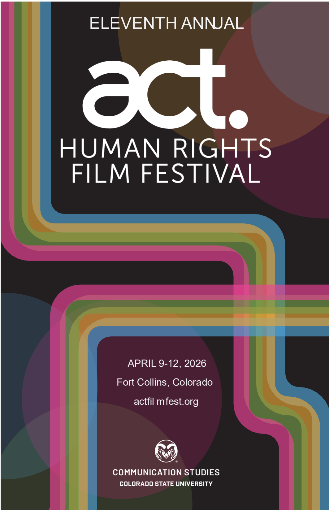
Figure 2: Art and Art History Poster