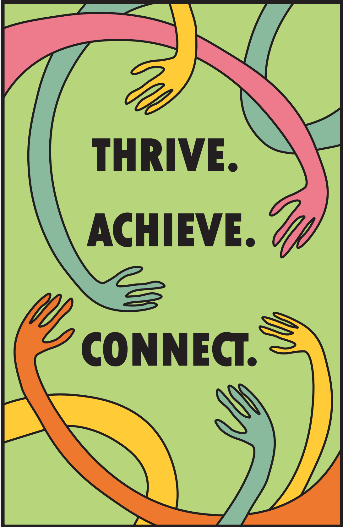
Figure 2: Art and Art History Poster