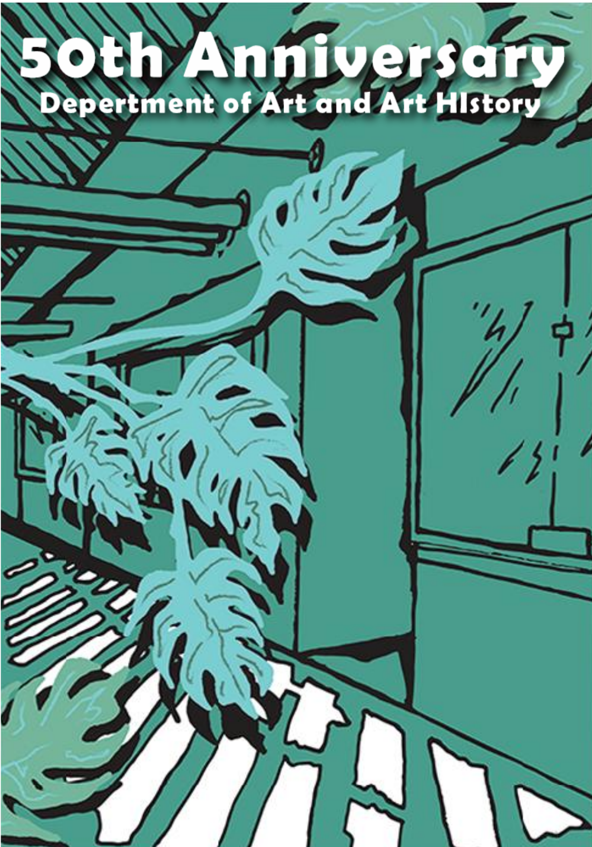
Figure 2: Art and Art History Poster