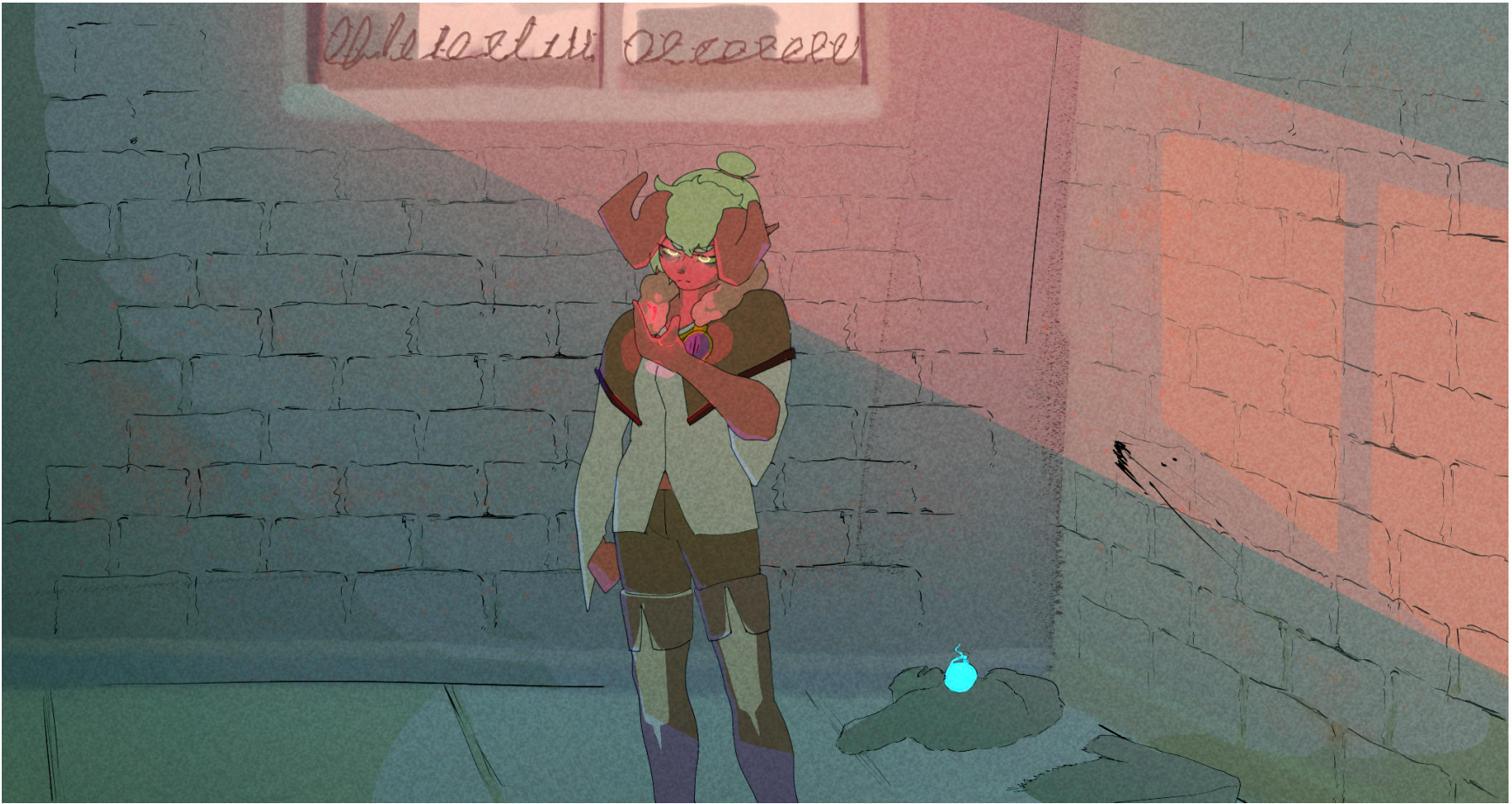
Figure 3: Job Done (2026)