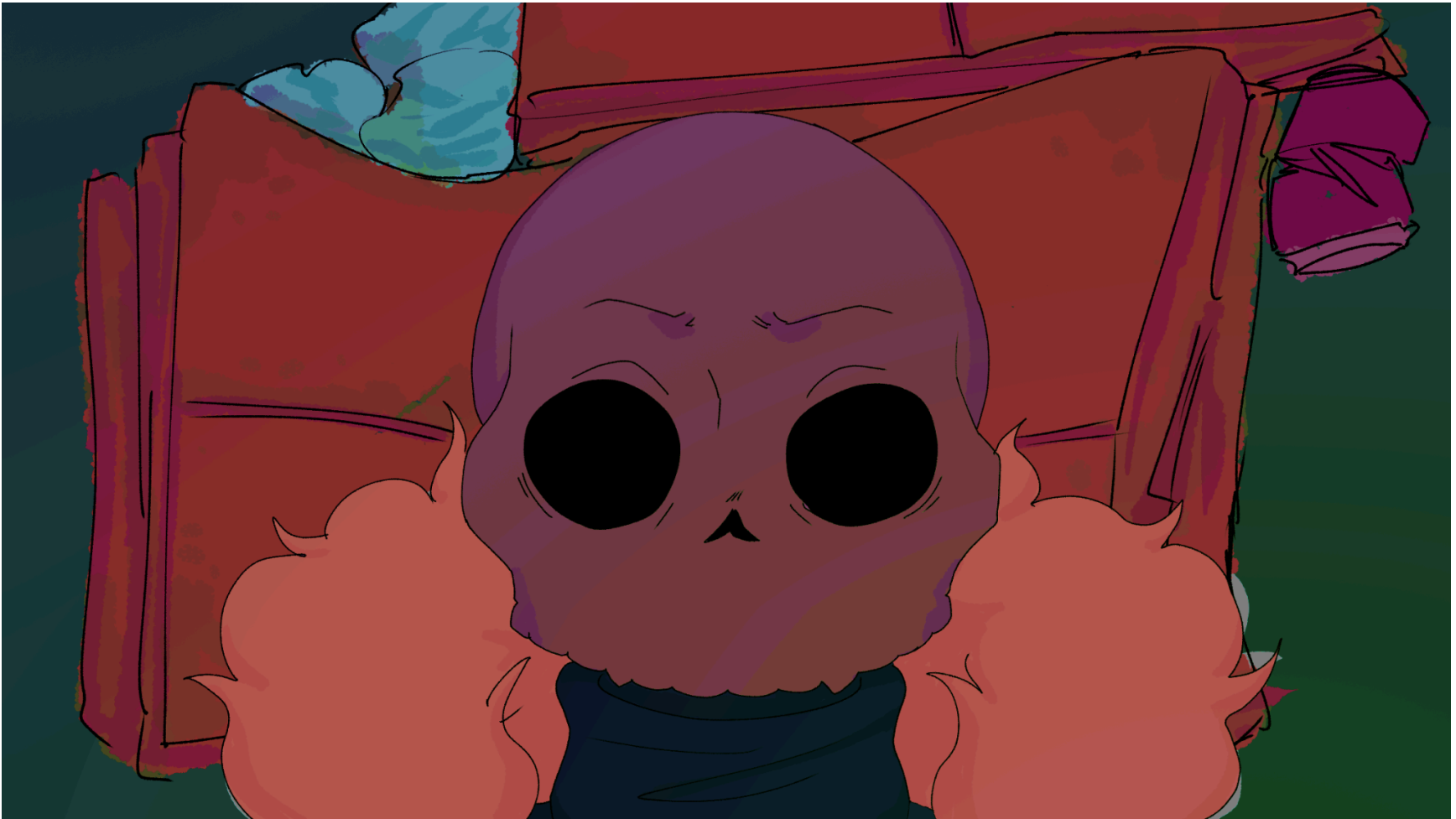
Figure 1: Back to It (2025)