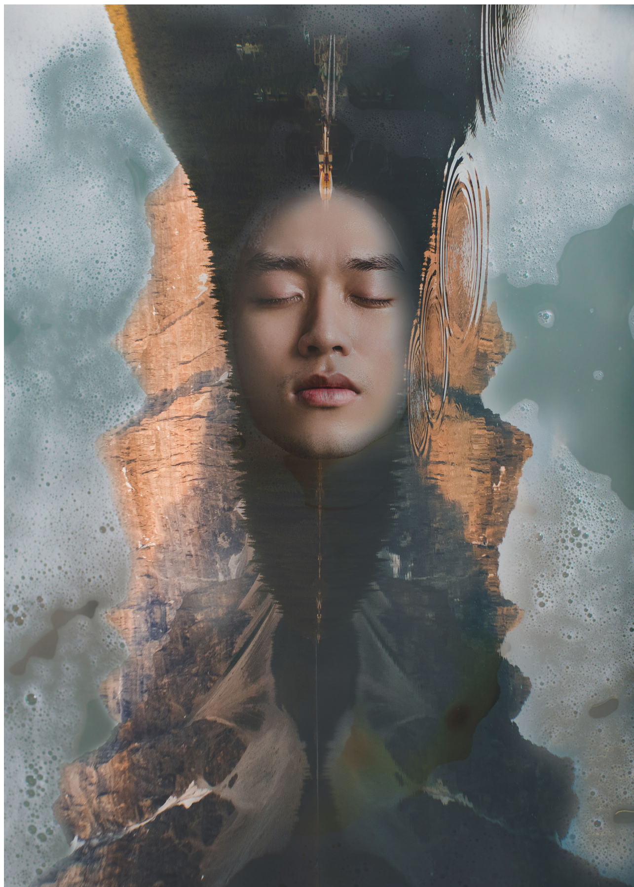
Figure 2: Dreaming