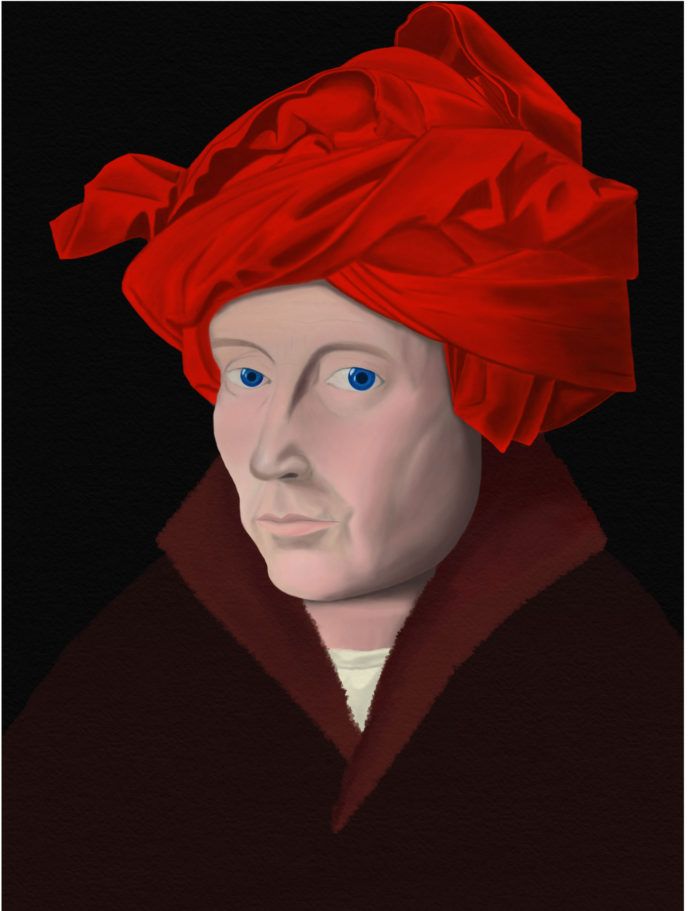
Figure 9: Jan Van Eyck