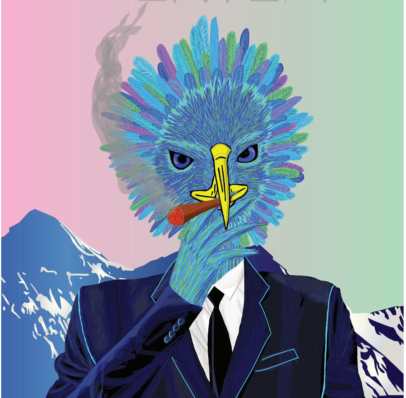
Figure 8: Vertex Festival Poster