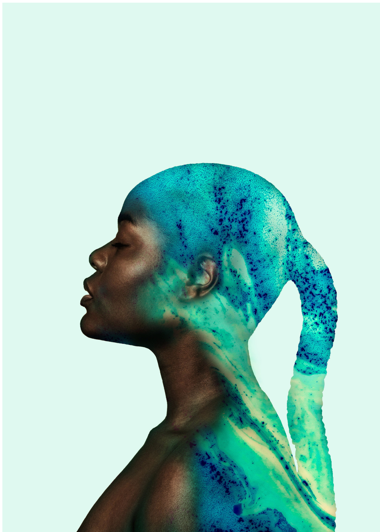
Figure 1: Sync