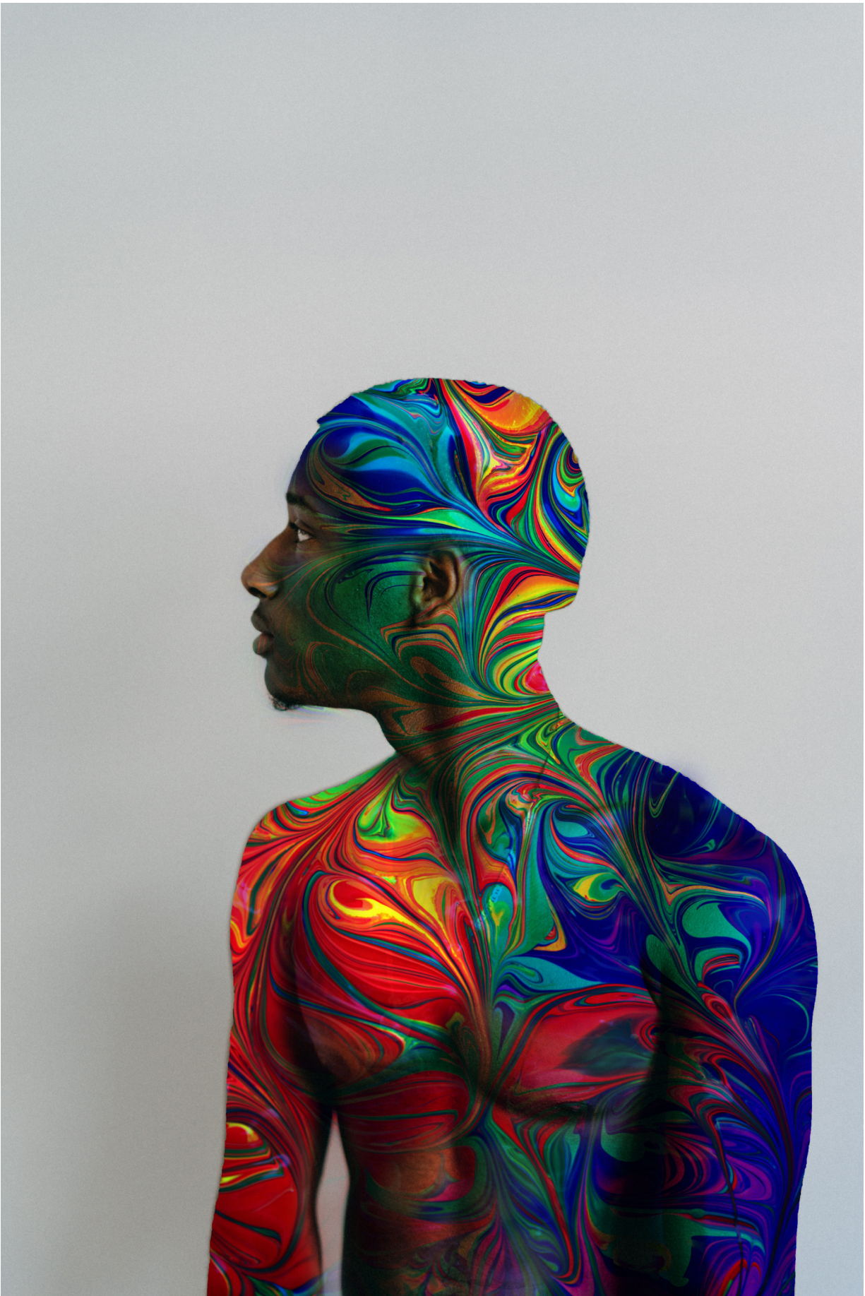
Figure 10: Wet Paint