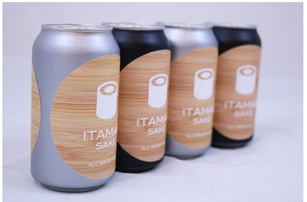
Figure 6: Itamae Sushi + Sake Packaging