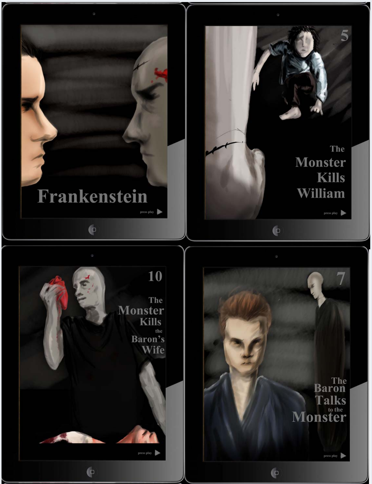
Figure 9: Frankenstein App Design.