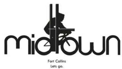
Figure 5: Midtown Logo Design.