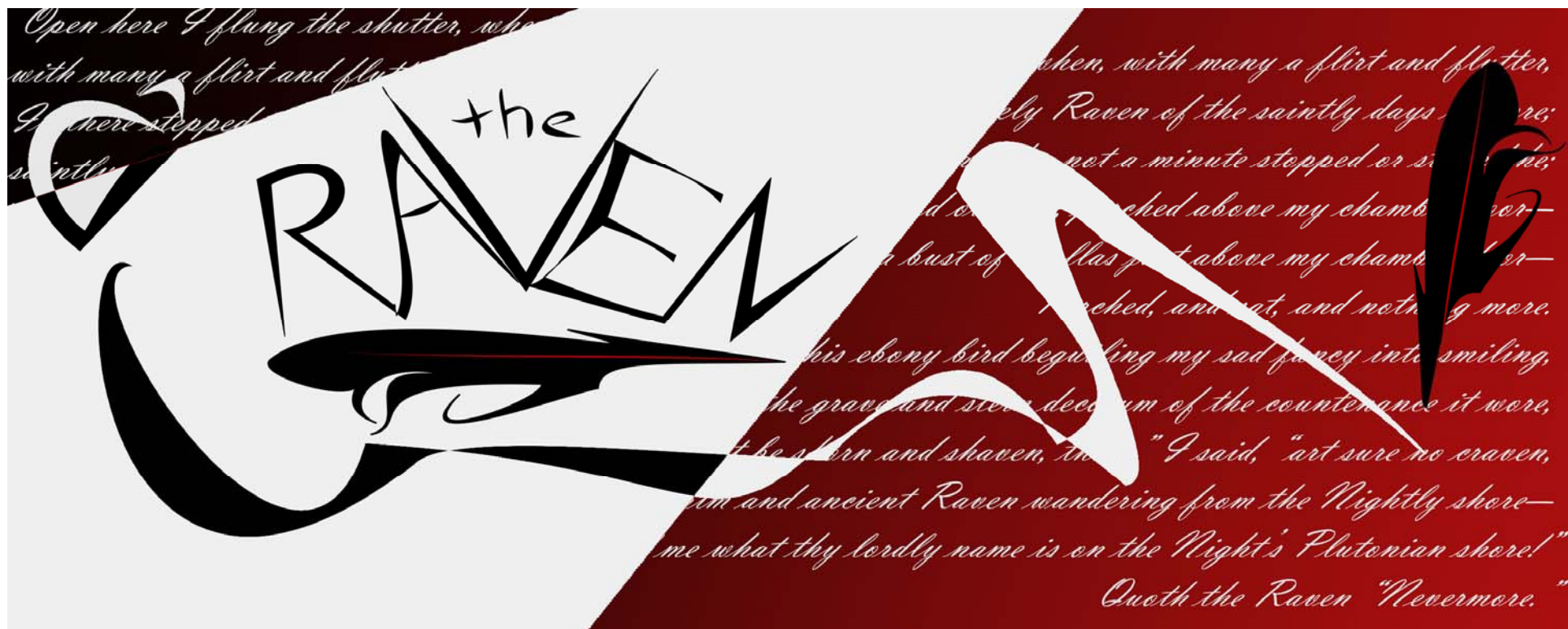
Figure 3: The Raven.