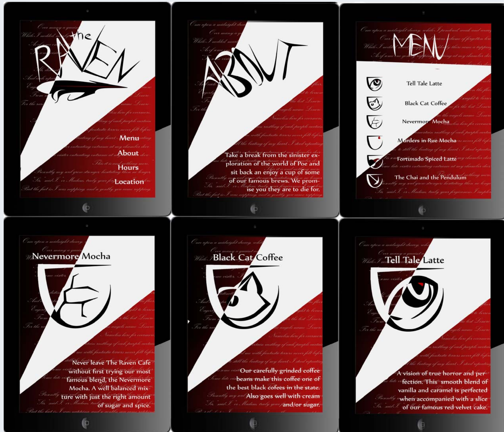
Figure 4: The Raven App Design.