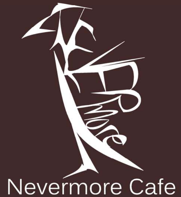
Figure 2: Nevermore Café.