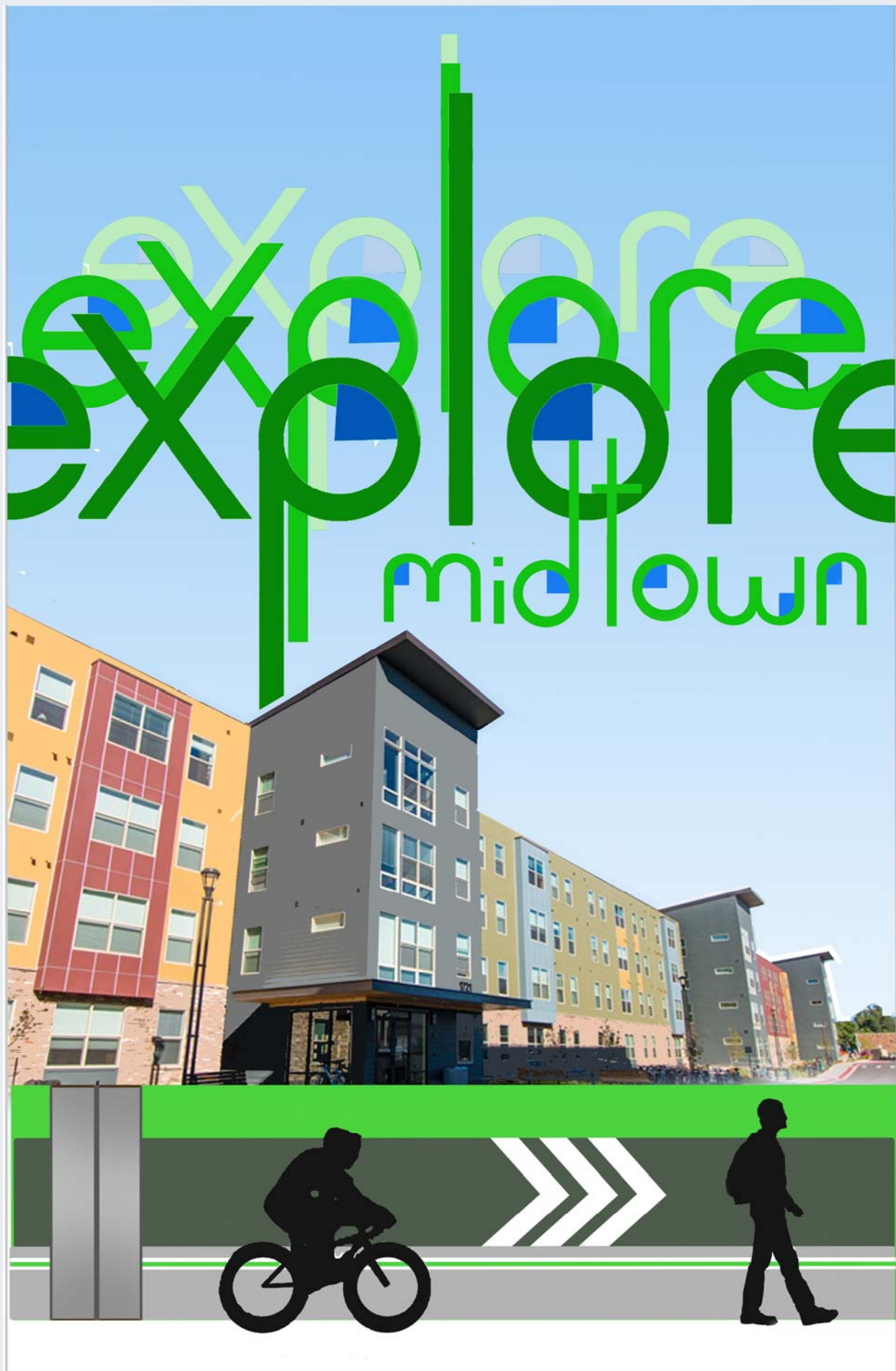
Figure 6: Explore Midtown.