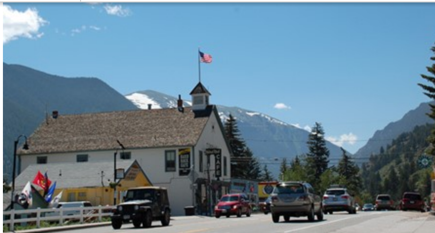
Image of the Town of Empire, CO.

In recent days, the town discovered the major leak on a resident's private property and initiated efforts to resolve the crisis. Town officials have also confirmed that the filtration system has been upgraded and enhanced, benefiting the population and the drinking water. The Colorado Department of Public Health took further measures by conducting tests and approved the water quality produced by the well. Due to these actions, water is now flowing to approximately 85% of the town, and residents and business owners are eager for optimistic results in the upcoming weeks. Although numerous measures are being addressed, Empire will still have to face many difficult decisions and expensive challenges before the water shortage is fully resolved. Reports mentioned that the town is beginning to search for another water supply to prevent similar outcomes from reoccurring in the unforeseen future. Anyone affected by the water shortage crisis in Empire is encouraged to visit the town's website for the most accurate and up-to-date information.