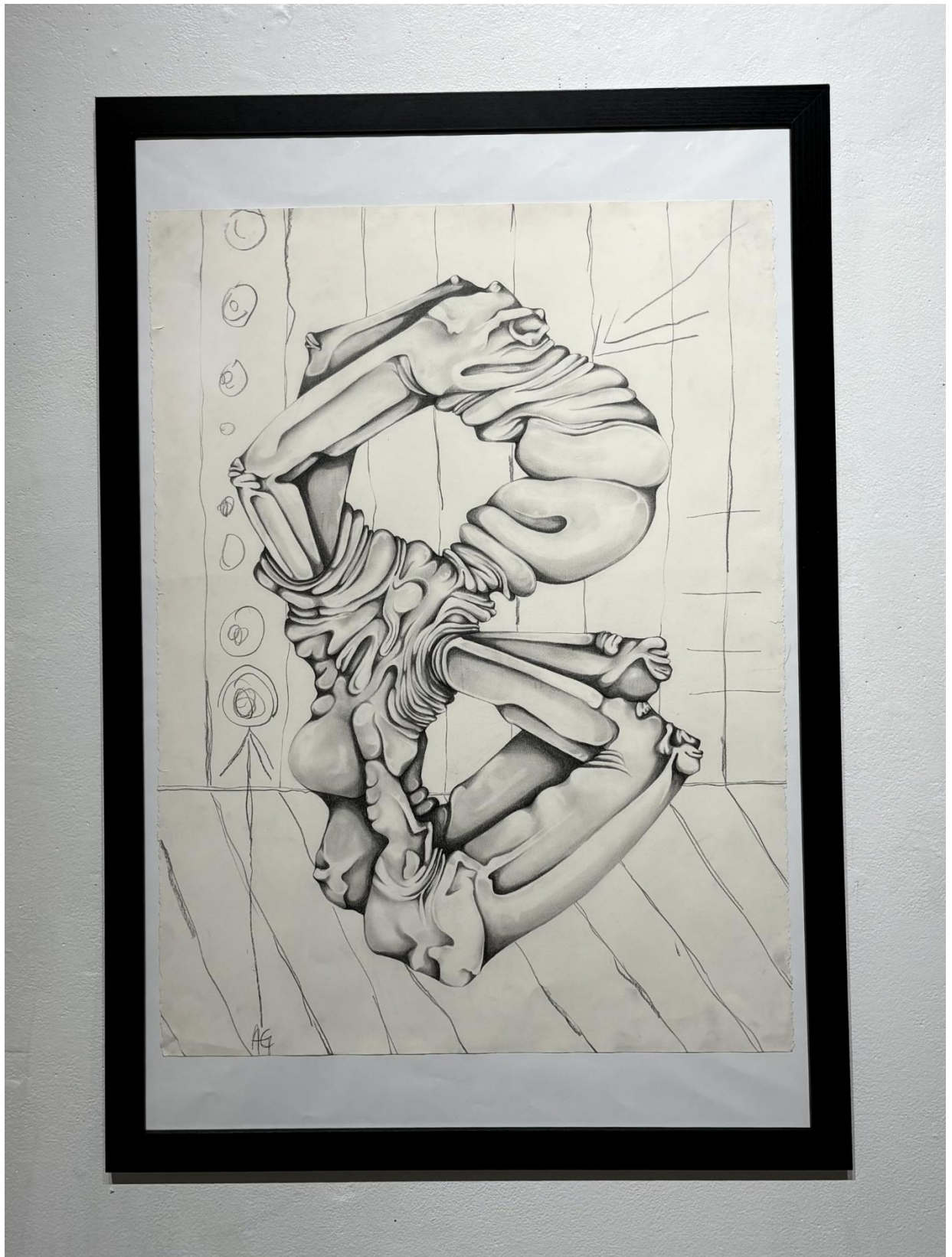
Figure 1: The Lover