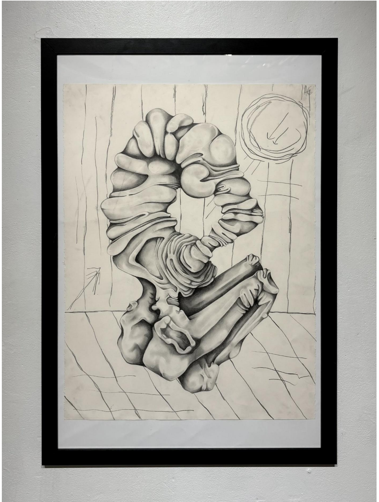
Figure 2: The Glutton