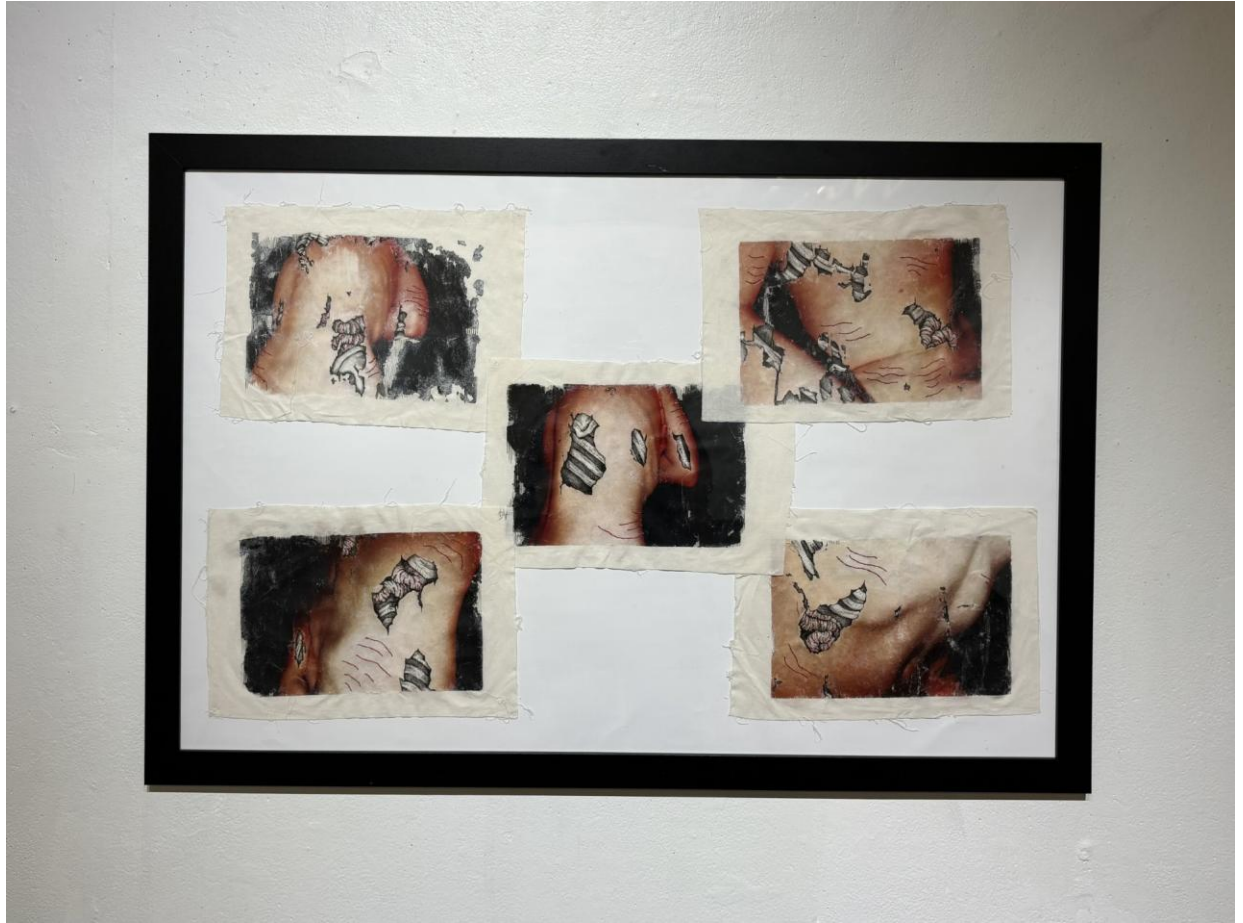
Figure 5: Let Me See Inside Myself