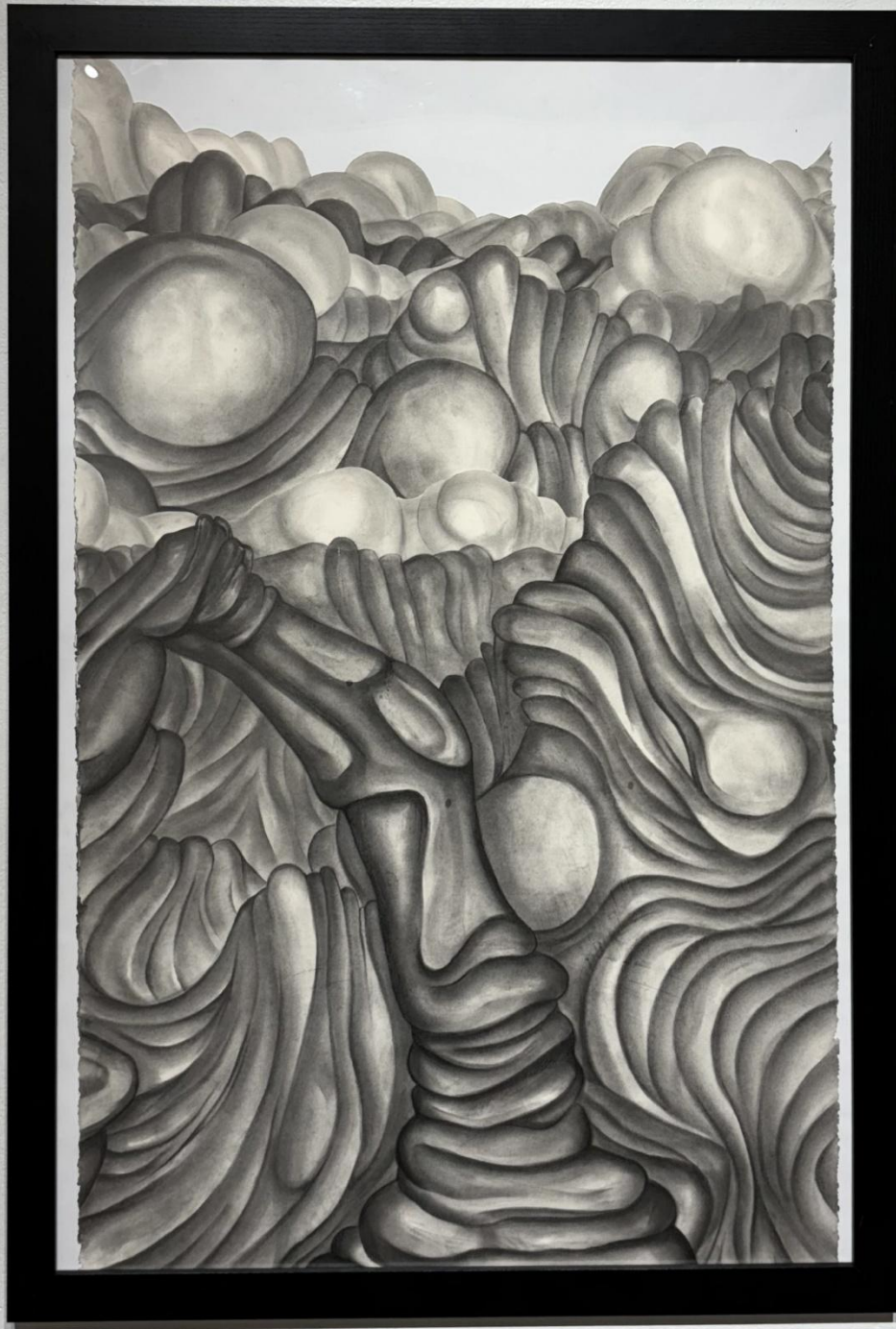
Figure 4: I Am A Landscape