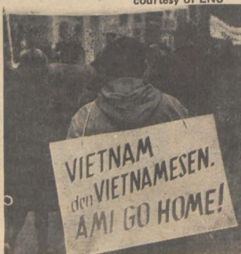
Demonstration in Düsseldorf.