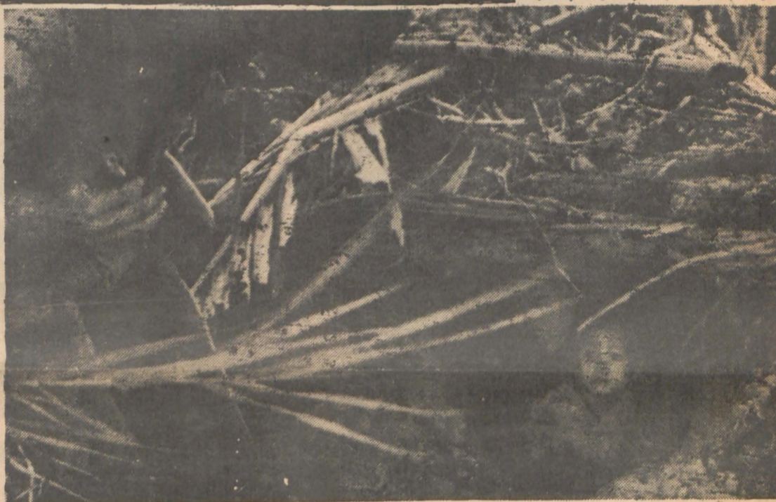
LOOKING FOR ENEMIES, this South Vietnamese soldier finds a mother and child hiding in a guerrilla dugout after South Vietnamese troops moved in to "reclaim" Suc Trang.