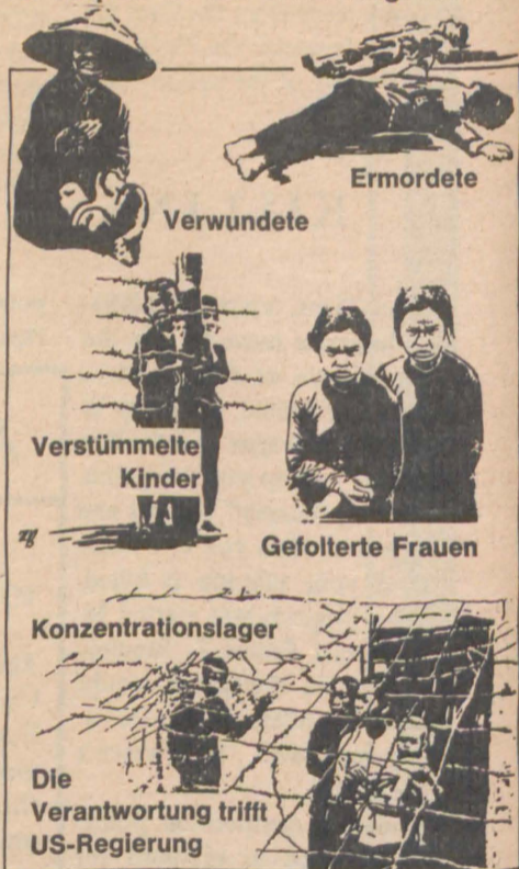
A leaflet brought out by the Bavarian Peace Committee calling for solidarity with the people of Vietnam. "Children are being murdered, wounded, maimed, women tortured", it says. The other side quotes Senator Gruening that nothing more reveals the erroneousness, absurdity, stupidity and bankruptcy of US policy than what is now happening in Vietnam.]