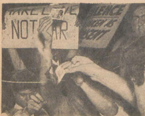
Young Australian conscripts burn their call-up papers in protest.