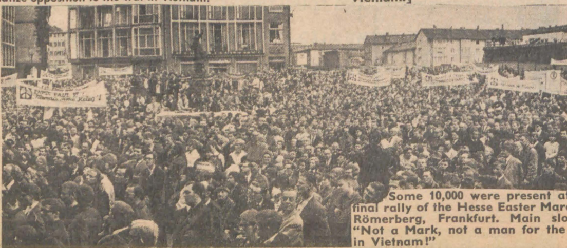
Some 10,000 were present at the final rally of the Hesse Easter March at Römerberg, Frankfurt. Main slogan: "Not a Mark, not a man for the war in Vietnam!"