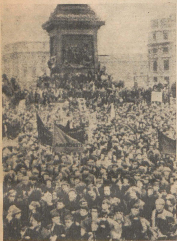
Britain: Thousands rally at Trafalgar Square, London, to demand nuclear disarmament and peace in Vietnam.