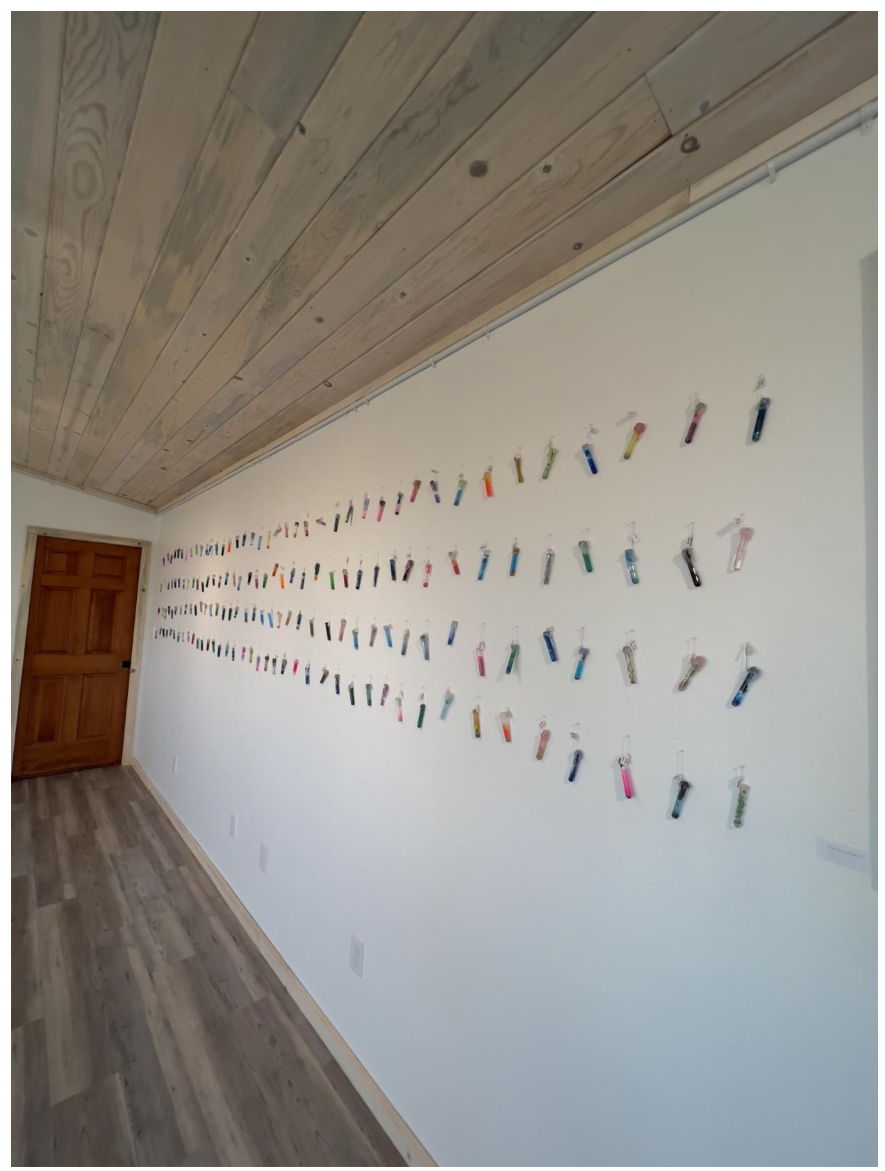
Figure 2: Pick Your Poison