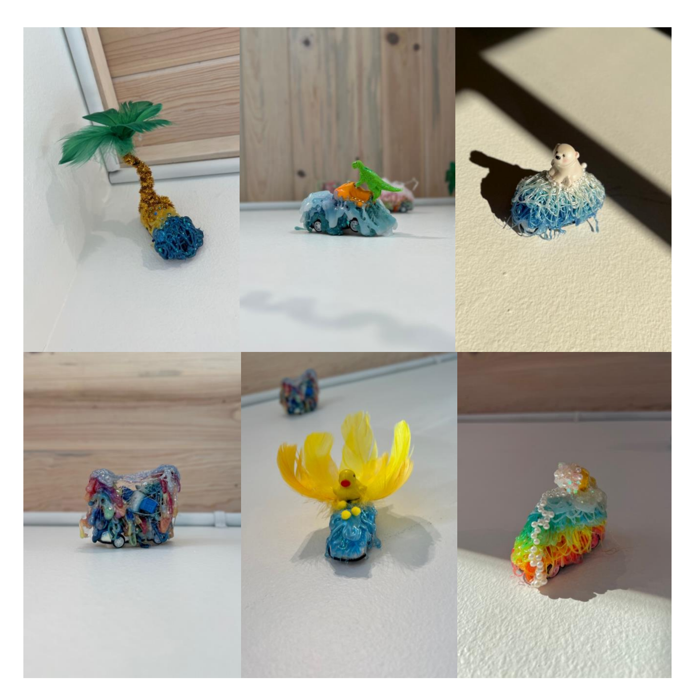
Figure 1: Childs Play (Detail Images)