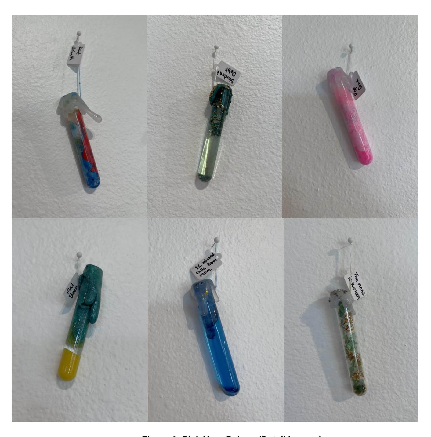
Figure 2: Pick Your Poison (Detail Images)