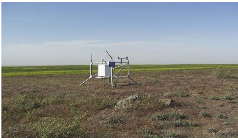
Figure 3. "HERO" AgriMet station located North boundary of BTF.

field, including other analysis, is done at this stage of the ASIM program and a soil moisture report is created.