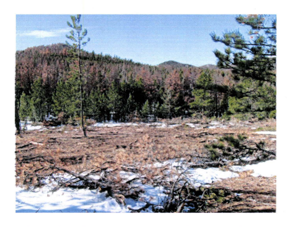
From NE Corner Of Project, Looking South