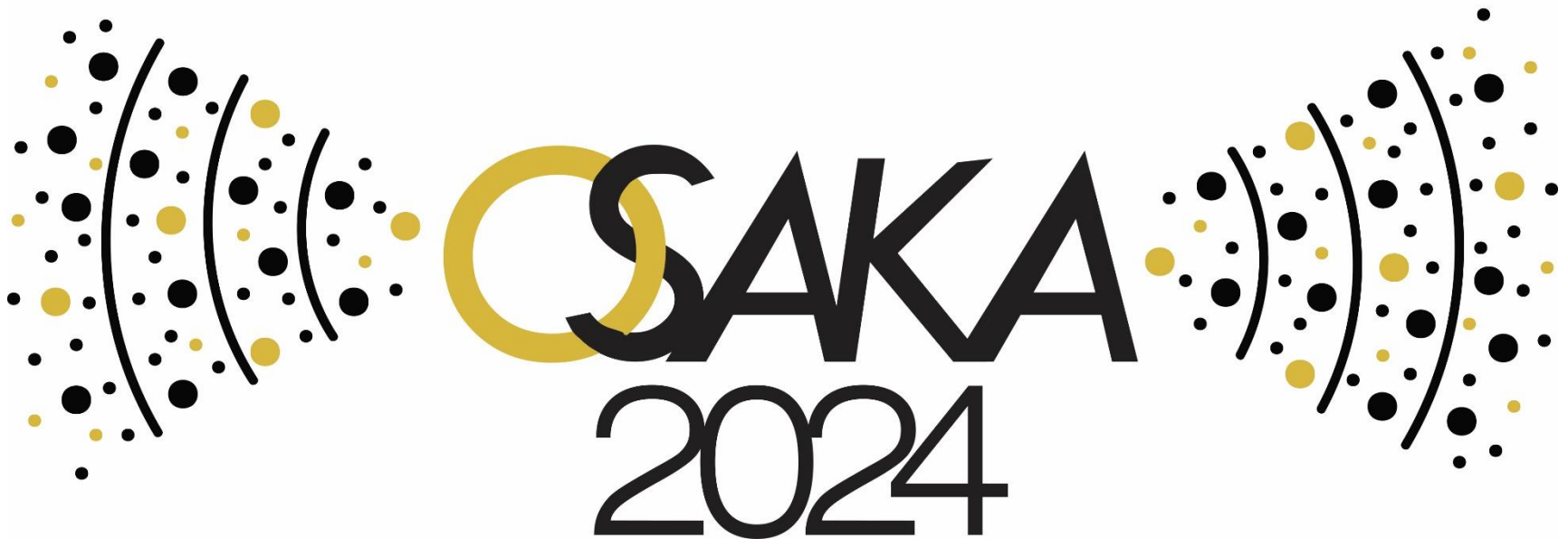
Figure 5: Logo