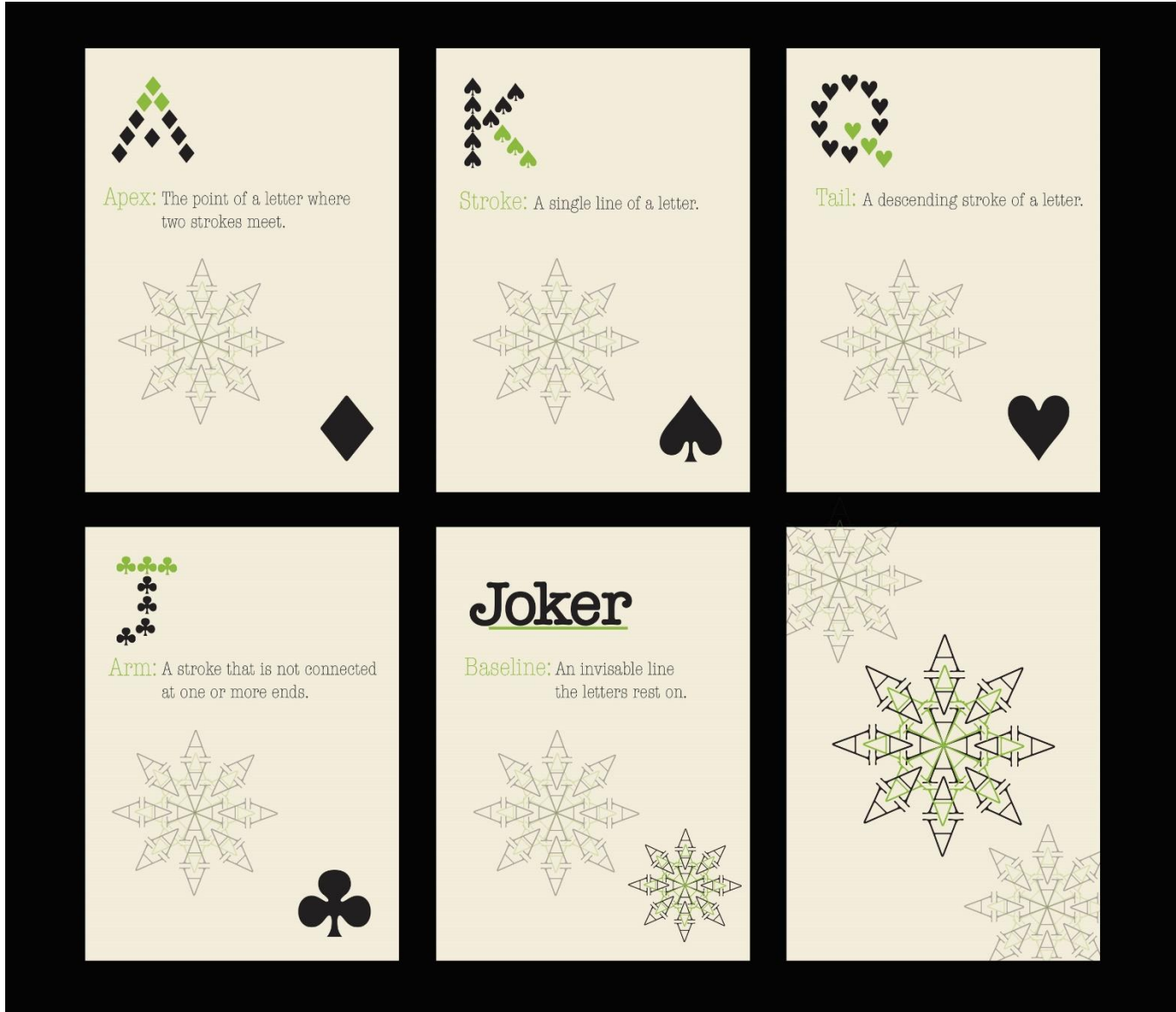
Figure 1: Playing Cards