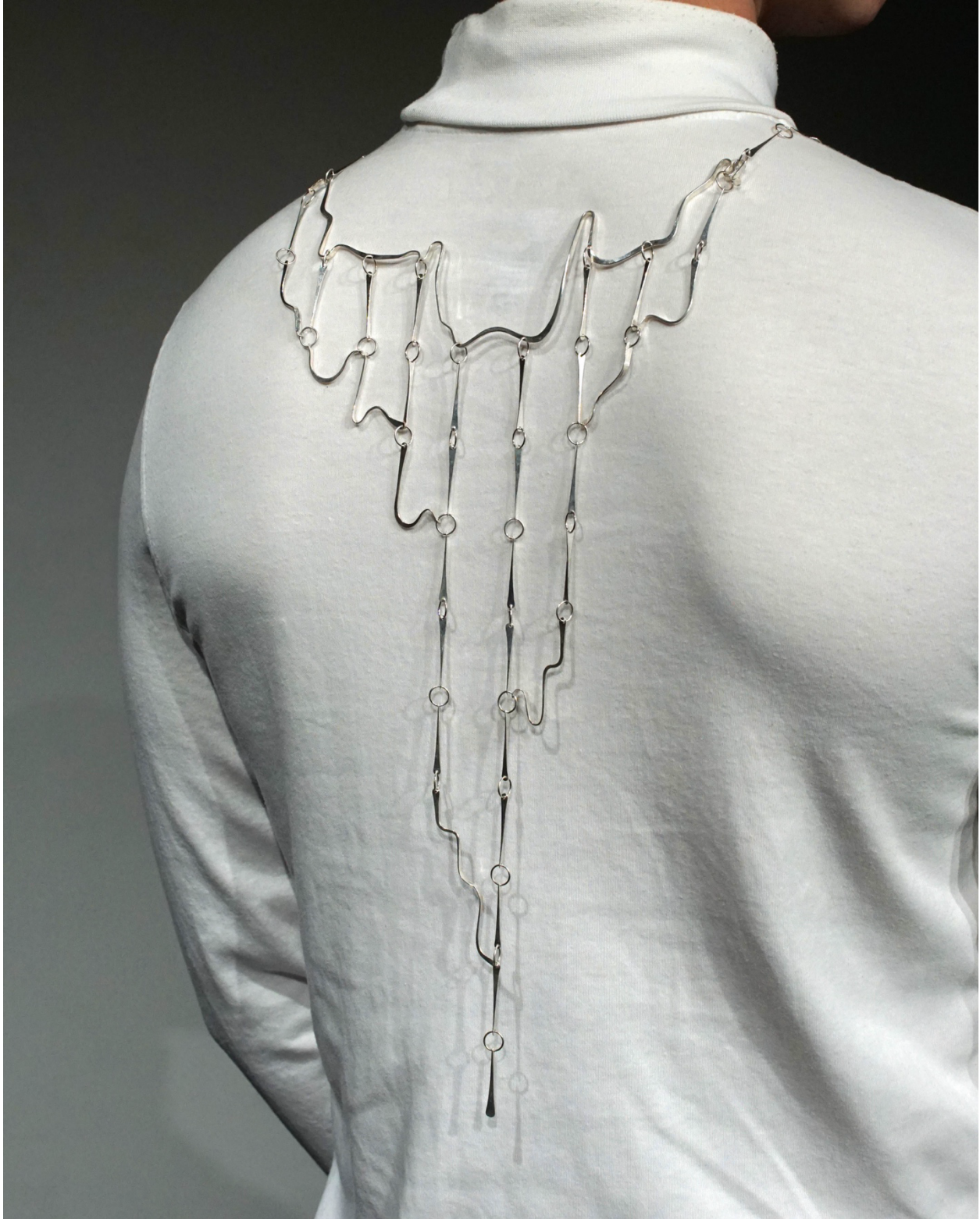
Figure 2: Body of Water (back)