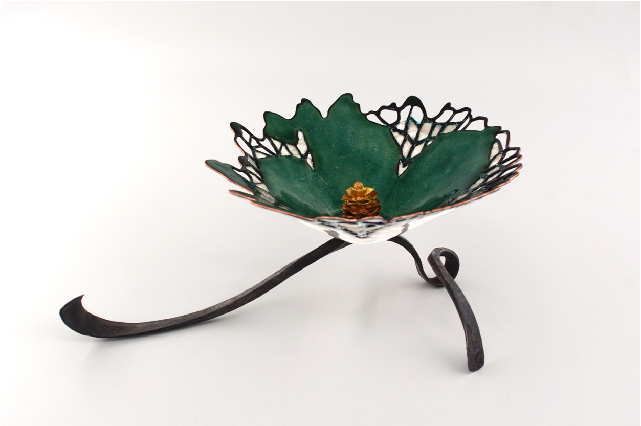
Figure 3: Preserving Winter