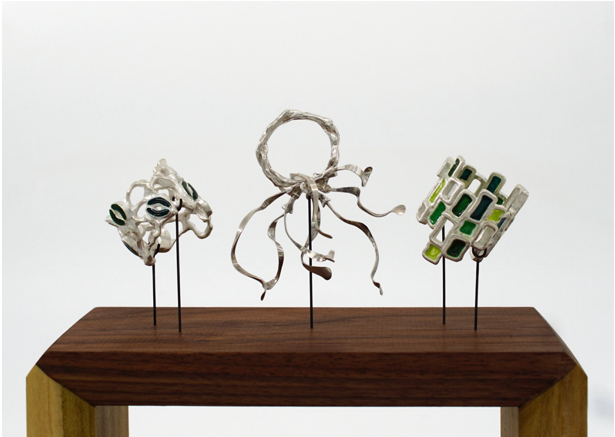
Figure 9: Biological Opportunism