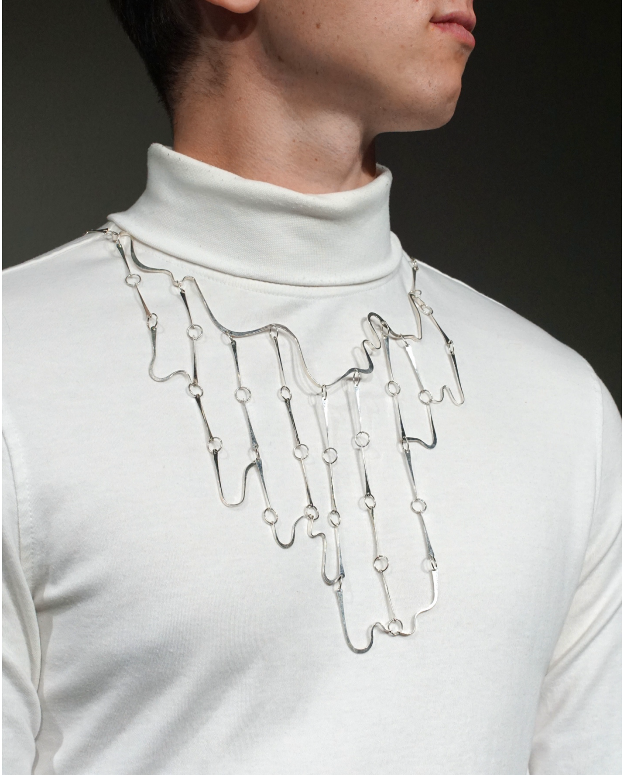
Figure 1: Body of Water (front)