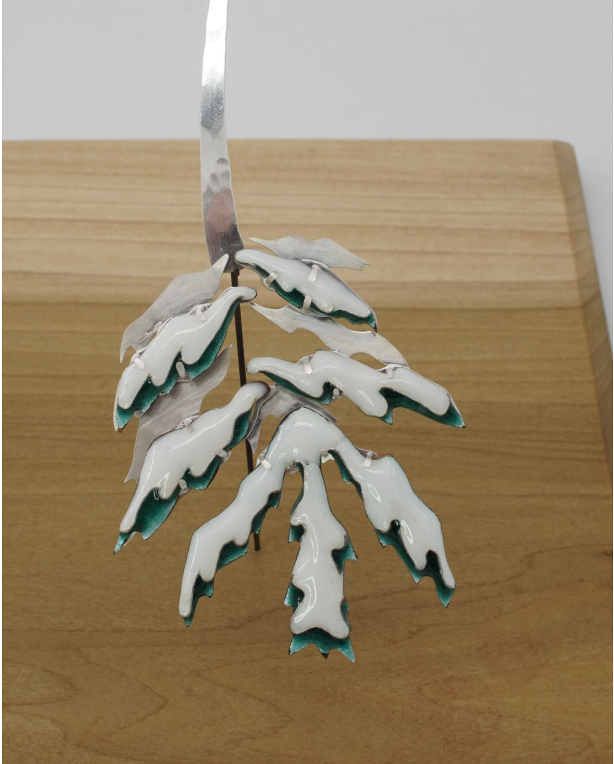
Figure 5: Density of Quiet (front detail)