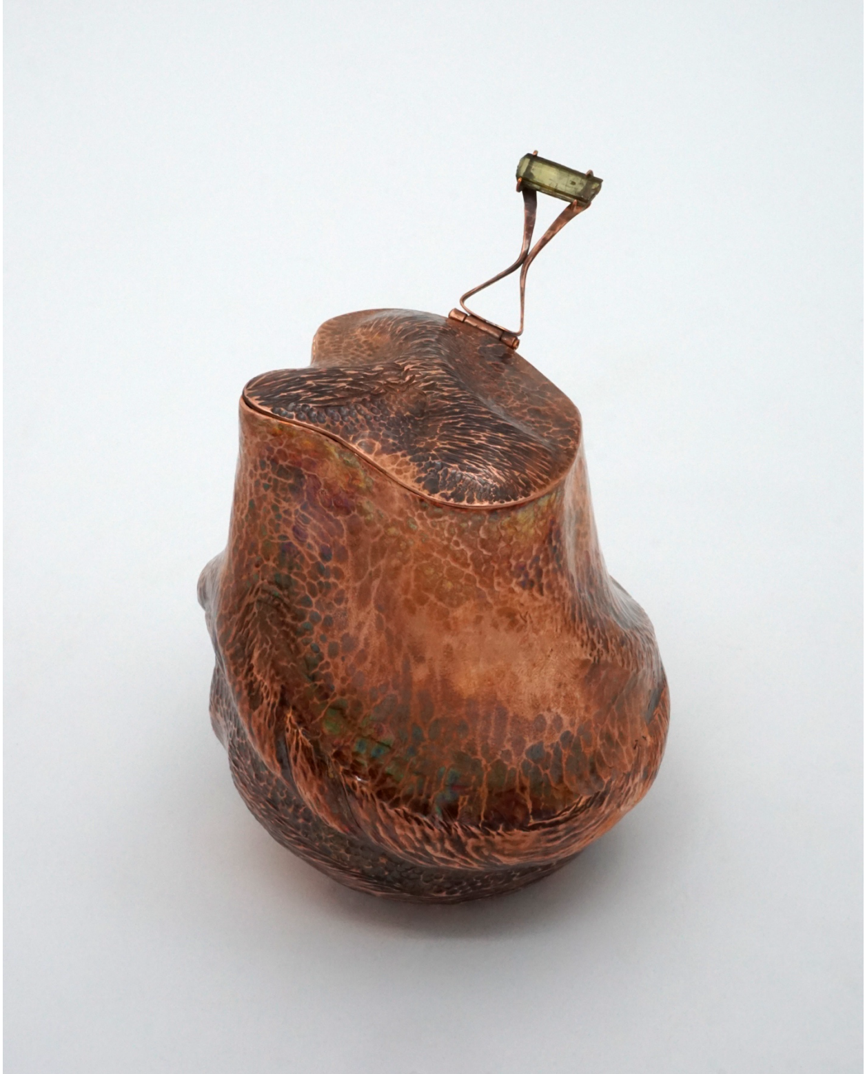
Figure 7: For Maple