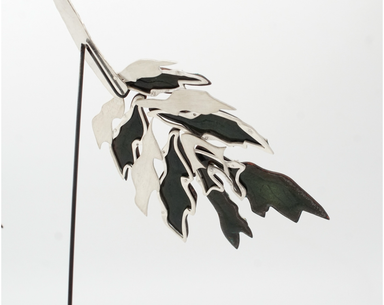
Figure 6: Density of Quiet (back detail)