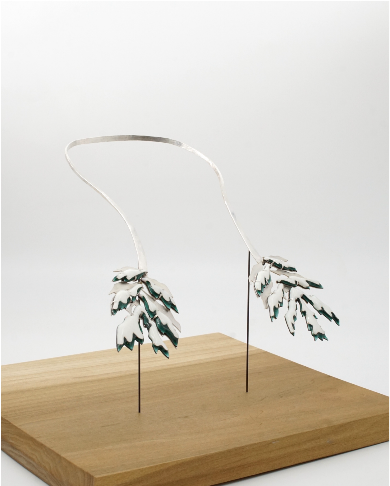
Figure 4: Density of Quiet