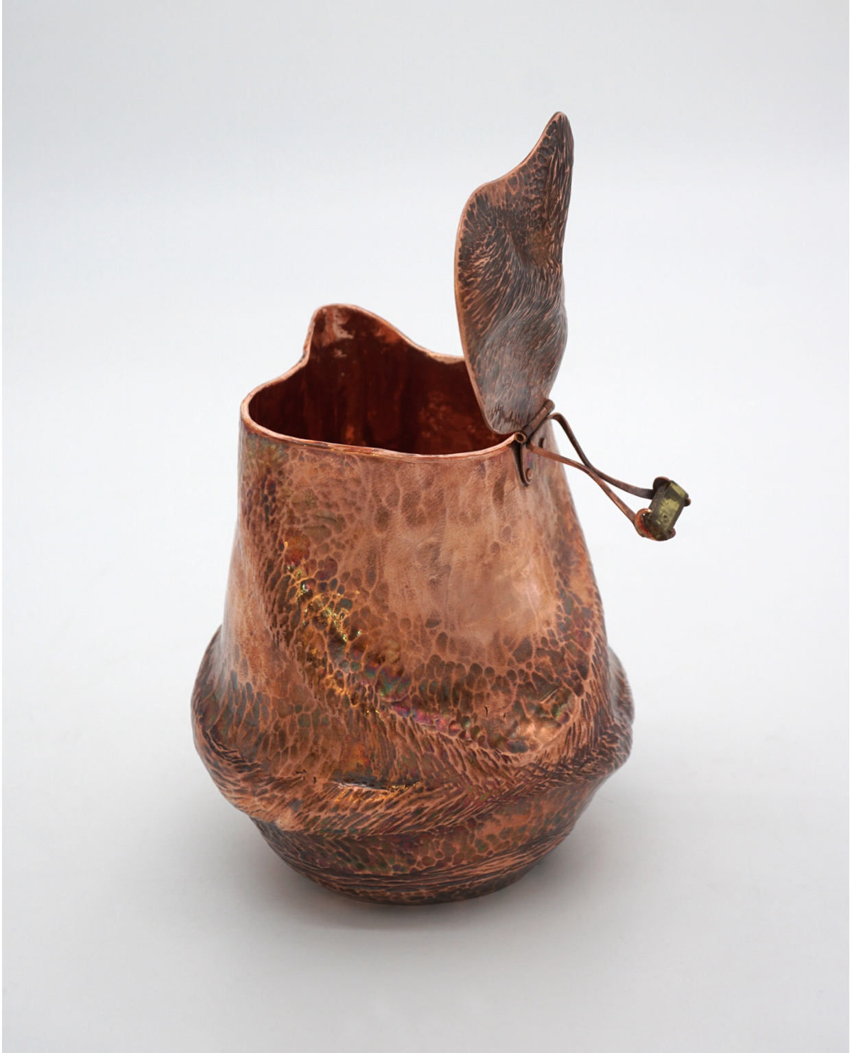
Figure 8: For Maple (open)