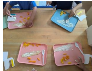
Figure 2. Preschoolers make cucumber roll-ups by spreading cream cheese and chopping bell peppers.