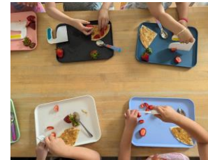
Figure 3. Preschoolers make fruit pizzas with tortillas, almond butter, strawberries, and bananas.