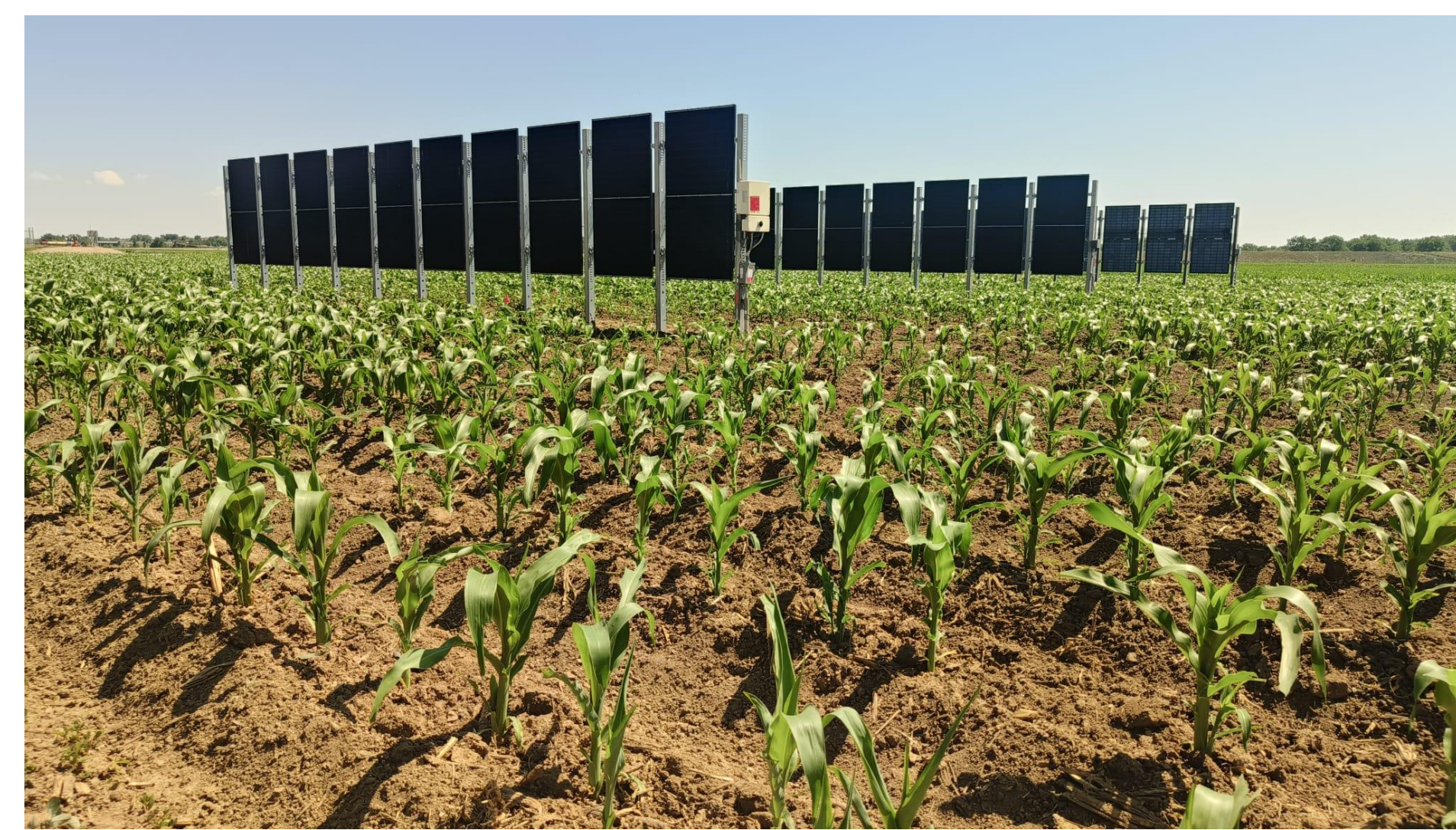
Fig. 2. Vertical bifacial agrivoltaics site at ARDEC-S, Fort Collins, CSU: 2025 sweet corn crop.