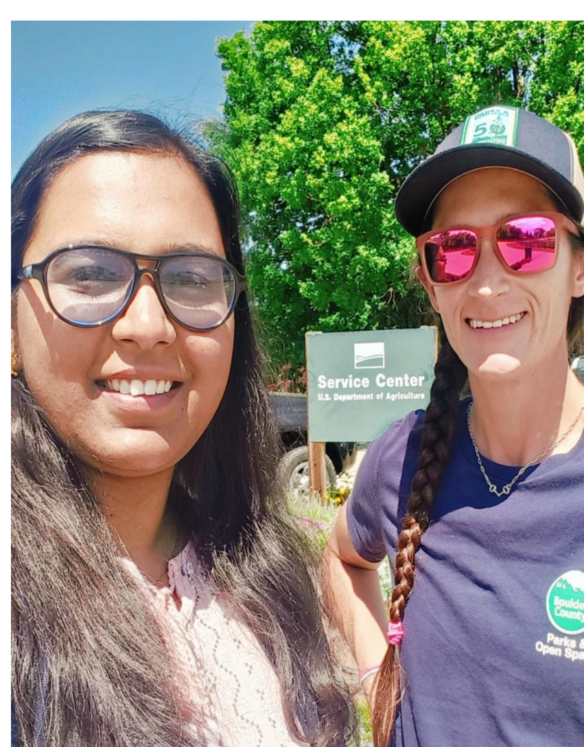
Fig. 1. Visit to extension office, Boulder county.

Agrivoltaics—combining agriculture with solar energy production—has gained momentum in recent years as available land for traditional solar projects declines and demand for renewable energy grows in Colorado. These systems, still in the early stages of research, aim to determine whether farmers can successfully produce crops or livestock alongside solar power. Benefits include reduced temperature fluctuations from panel shading and improved solar efficiency through plant-driven evaporative cooling.