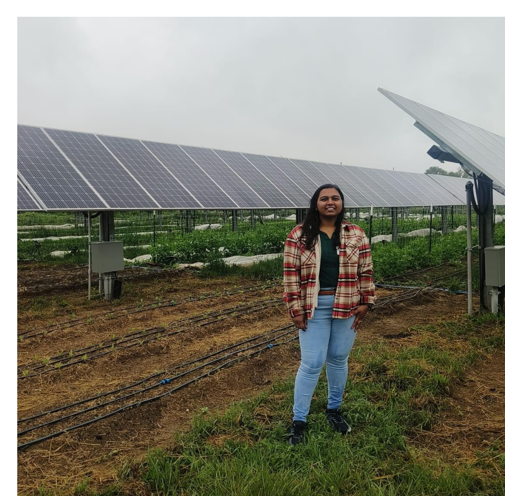
Fig. 3. Jack solar garden: solar tracking panels.