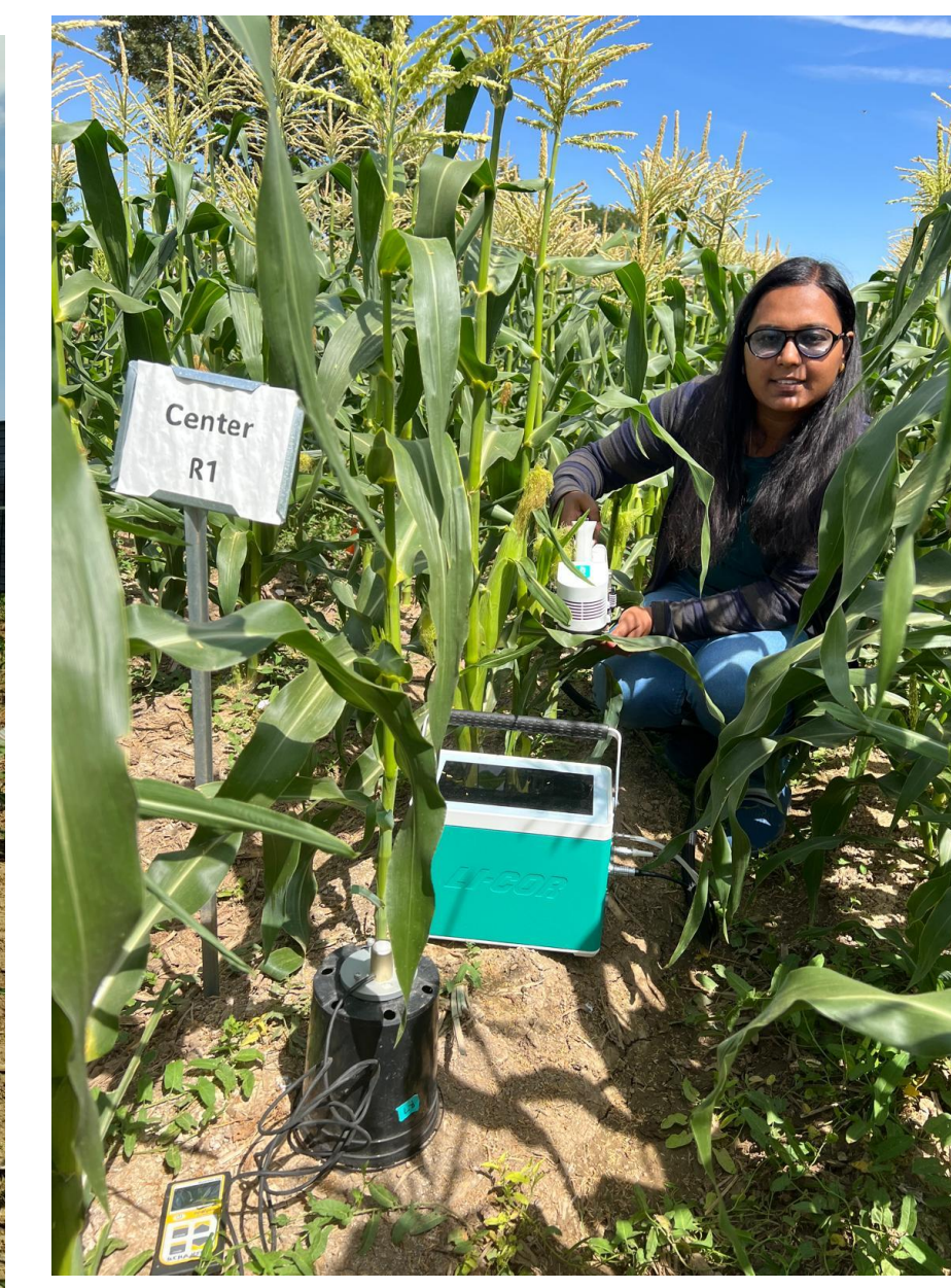
Fig. 7. Working with Licor 6800 in the sweet corn field.