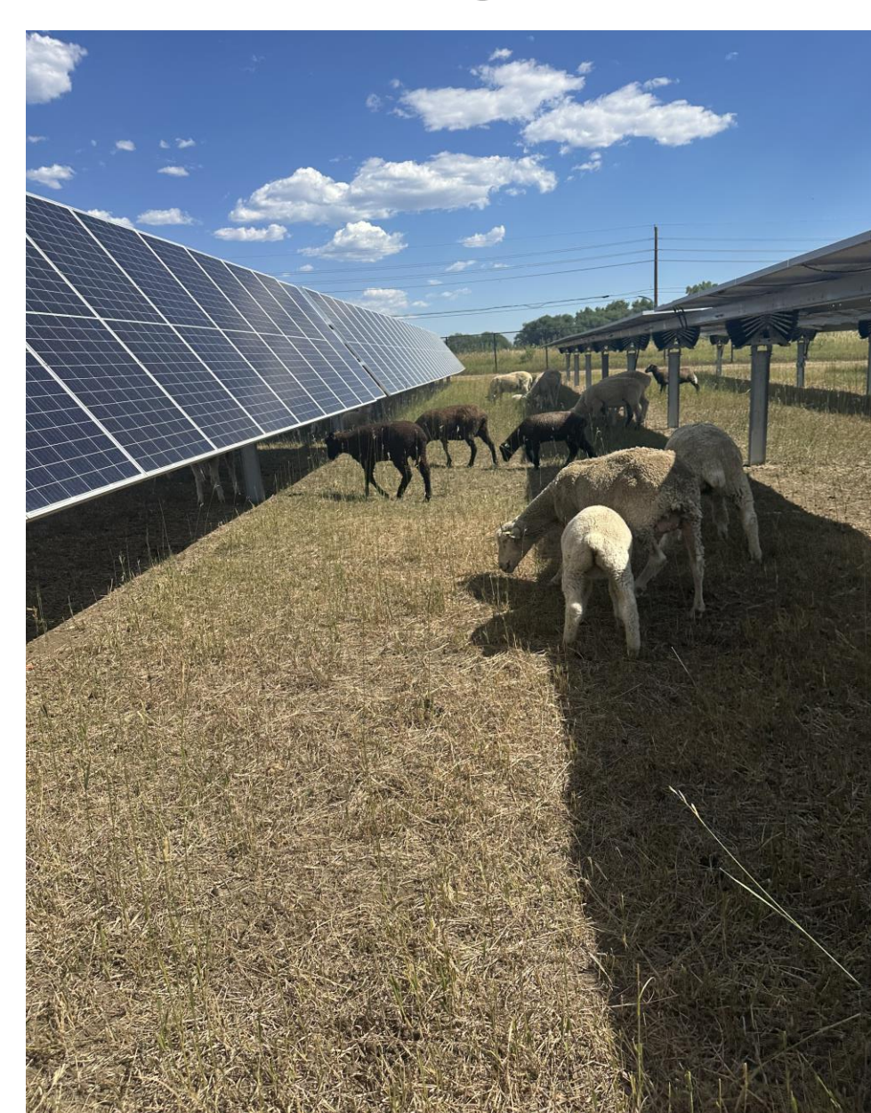
Fig. 5. Longroots ranch: sheep grazing.