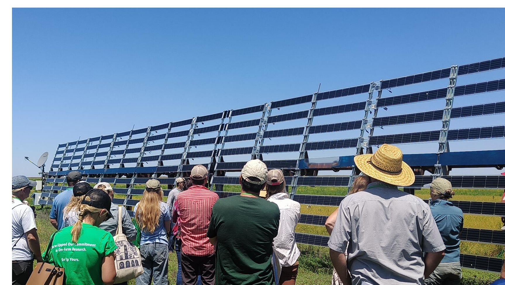
Fig. 4. Longboard Power: shelterbelt installed in camelina field.