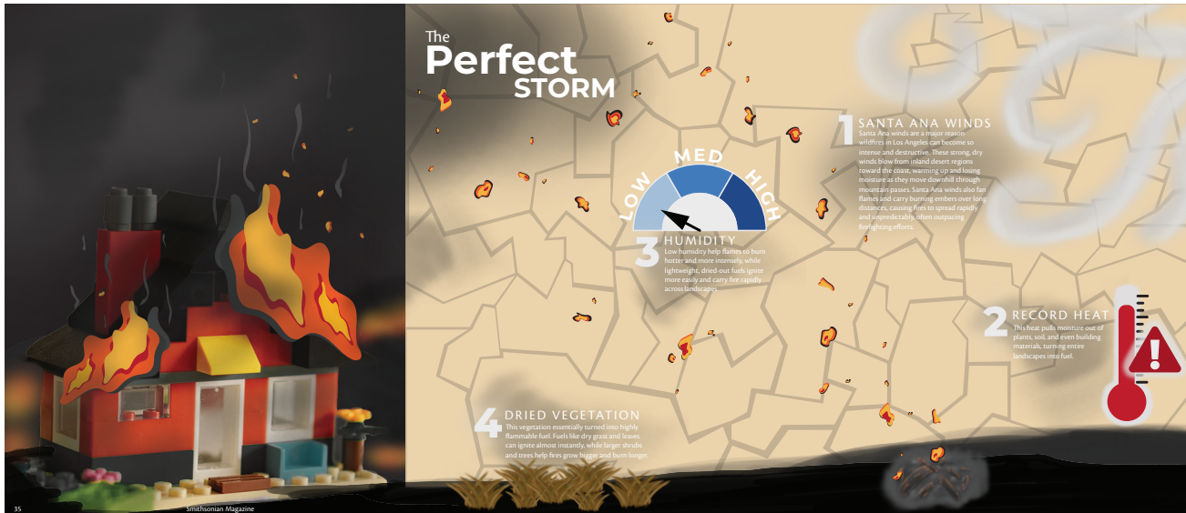
Figure 2: LA Wildfires Magazine Spread with Foldout