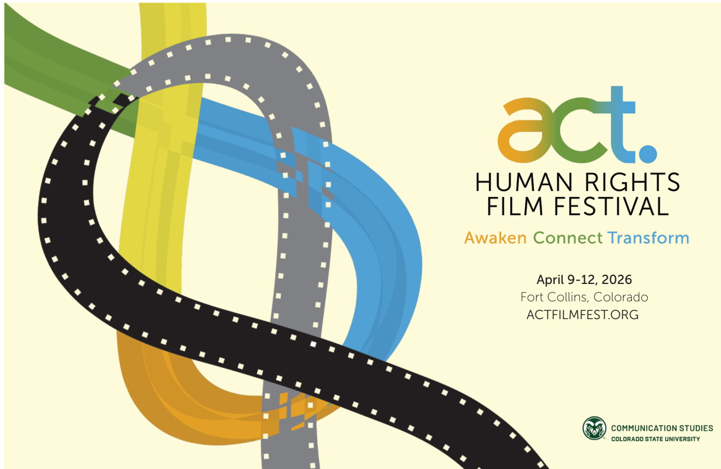
Figure 3: ACT Film Festival Poster: Horizontal