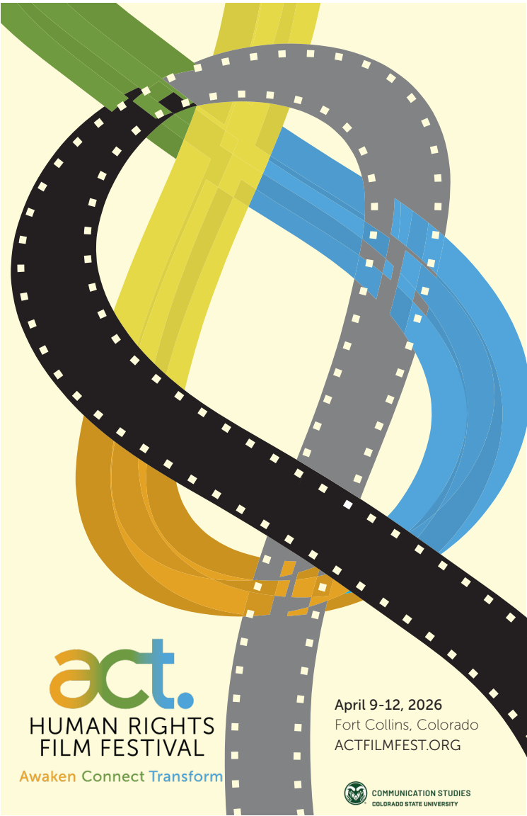
Figure 4: ACT Film Festival Poster: Vertical