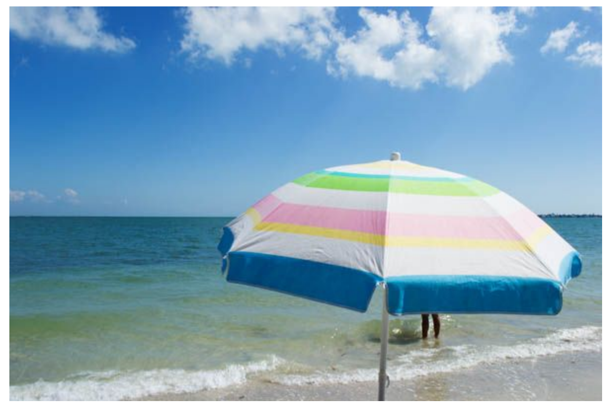
Figure 3: Legs