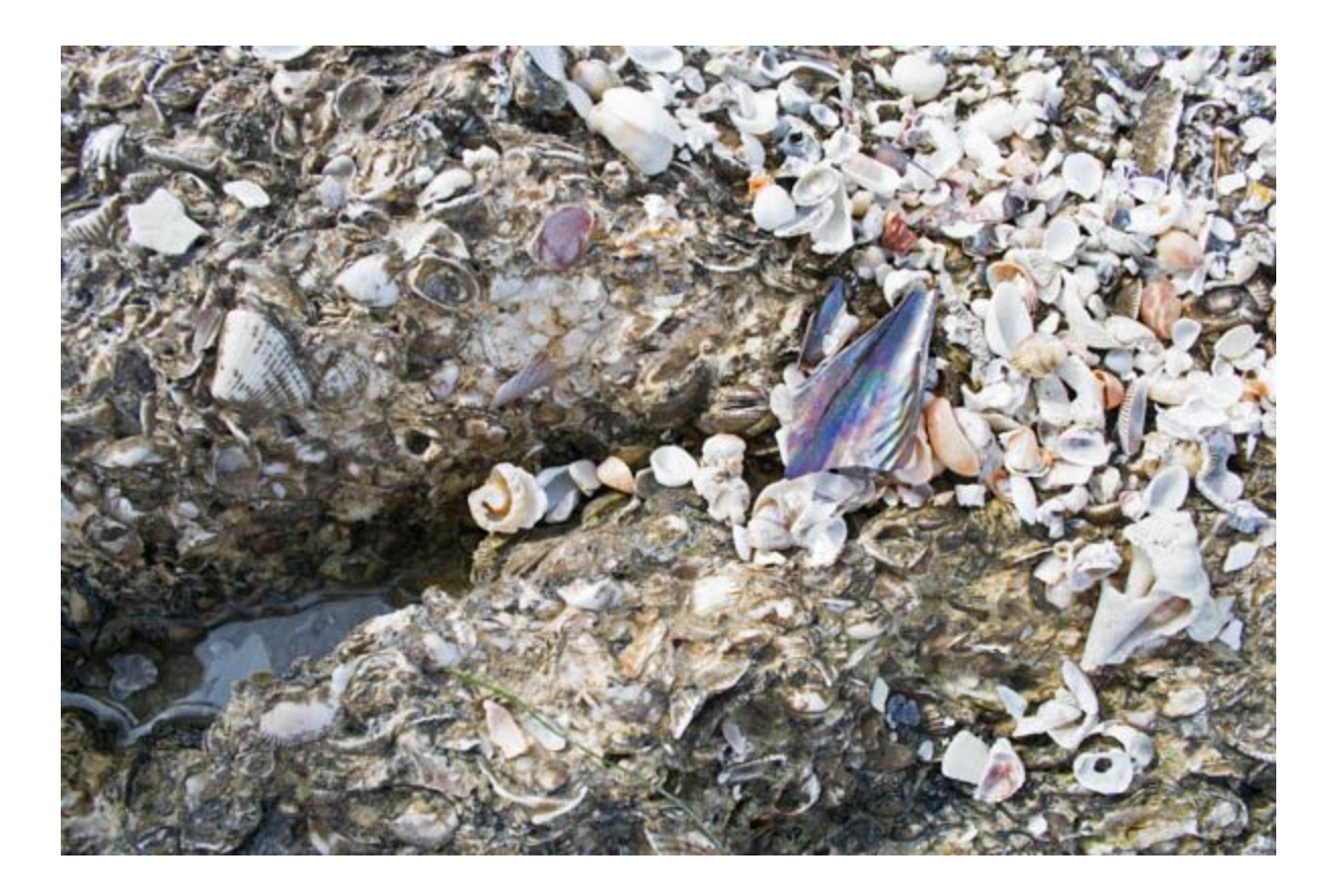
Figure 2: Shellstone