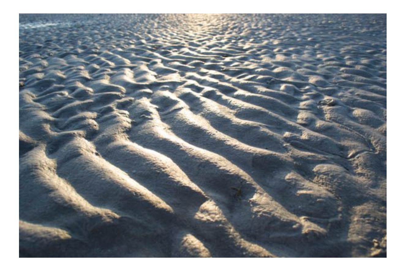
Figure 11: Sand Mimics Sea