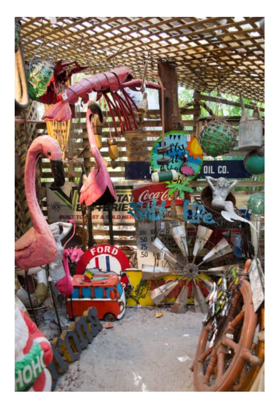
Figure 5: Island I-Spy