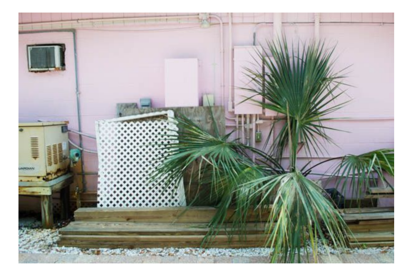
Figure 1: Back of the Shack