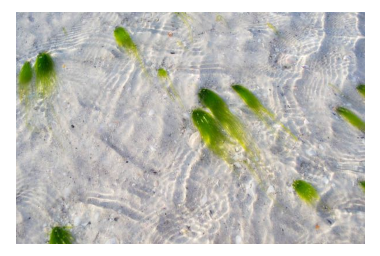
Figure 6: Tide-Glazed Seagrass