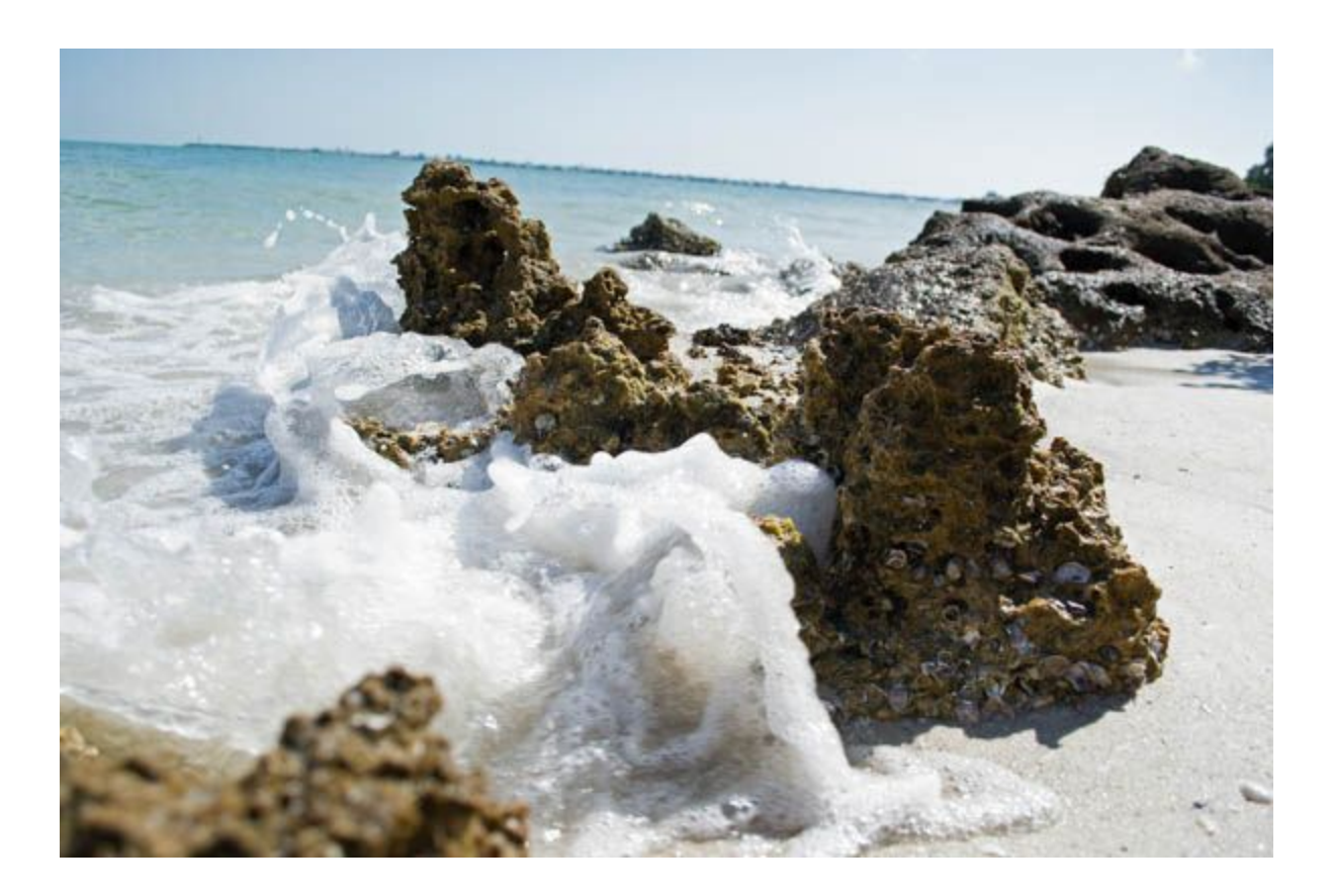
Figure 7: Crash