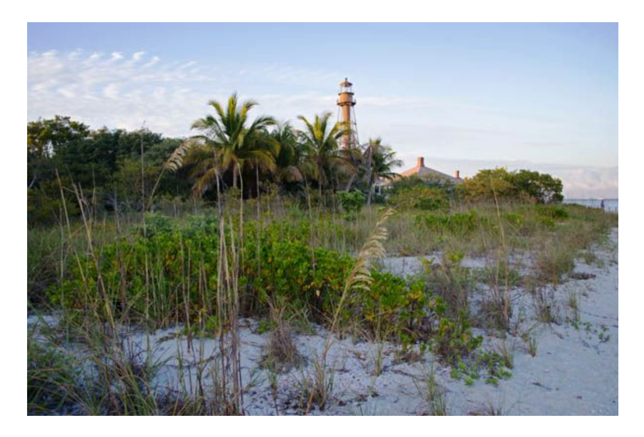
Figure 12: Sanibel Lighthouse, 1884