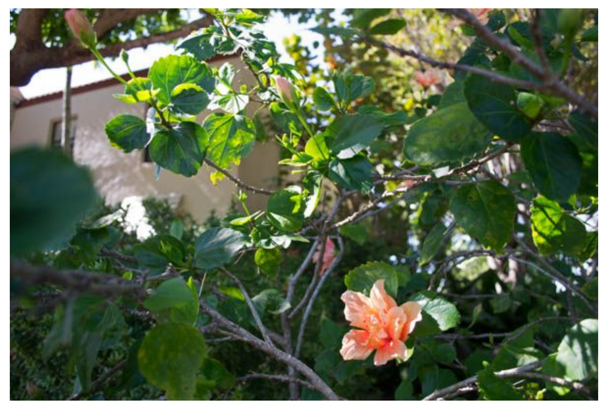
Figure 4: Moorings Bloom