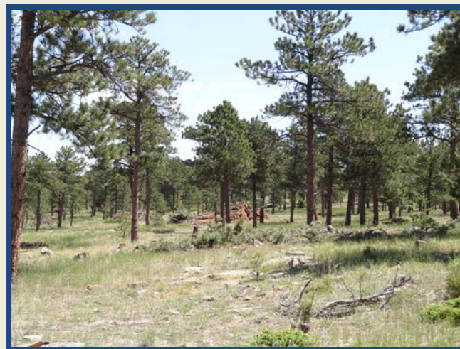
A completed fuels treatment area on Heil Valley Ranch, Boulder County.

The CSFS Boulder District and Boulder County Parks and Open Space completed 150 acres of treatment on the 6,800-acre Heil Valley Ranch. Treatments included forest restoration through mechanical treatment with utilization of tree boles. The property now has 254 acres of continuous treatment; an additional 200 acres adjacent to this project area will be treated in the future.