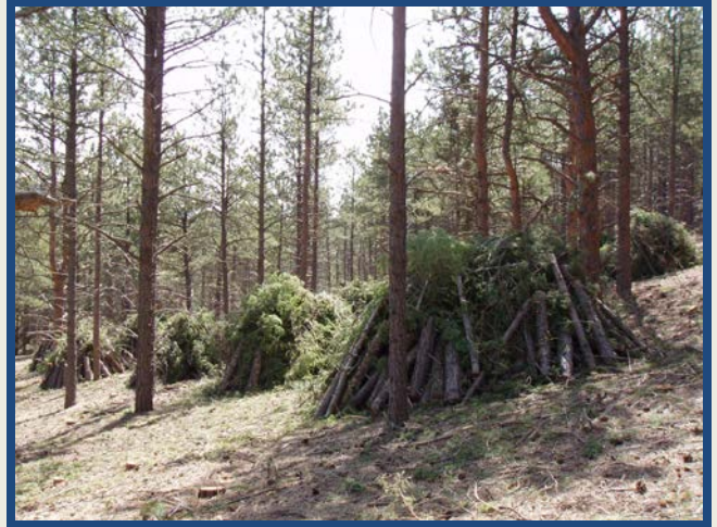
Piles stacked during a fuels thinning project in the Estes Valley Project area, Canyon Lakes Ranger District.

Valley, Lone Tree, Pingree Hill, Red Feather, Sheep Creek 1, Sheep Creek 2, Stringtown West and Thompson River.