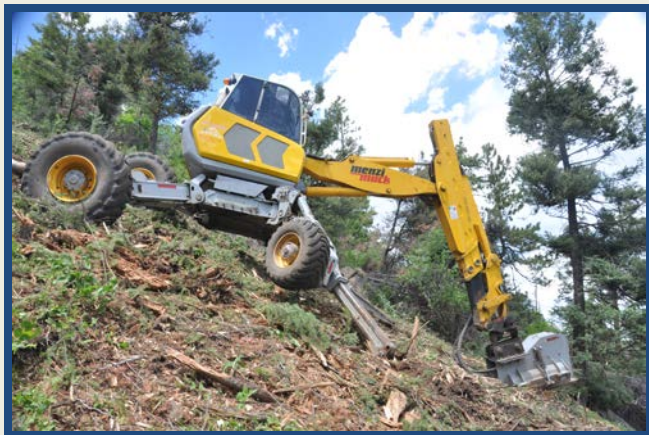
An all-terrain excavator removes fuels from a steep slope of the Rampart Range, Douglas County.

project, the trees will be more resilient to insects and disease, the quantity and quality of wildlife forage will increase, and the risk of a wildfire running through the tree tops will be reduced.