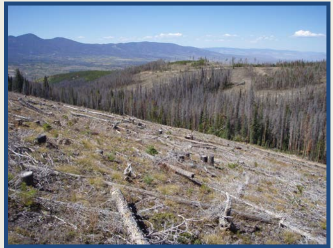
Harvested lodgepole pine stands in northern Colorado.

For more information about these studies or for copies of related publications, contact Chuck Rhoades by email at crhoades@fs.fed.us .