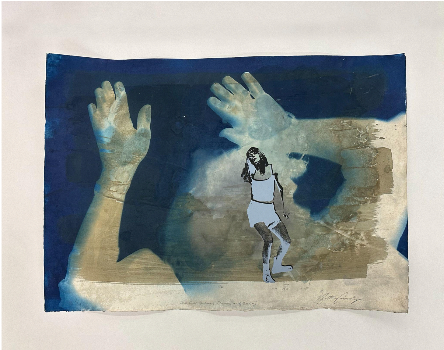
Figure 3: The Gulf Between Dreams and Reality