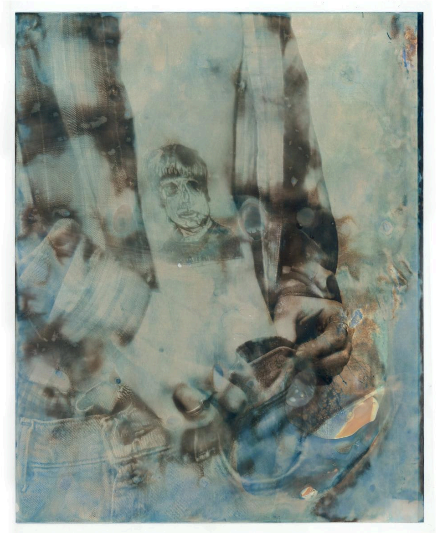
Figure 4: The Words Died on His Lips