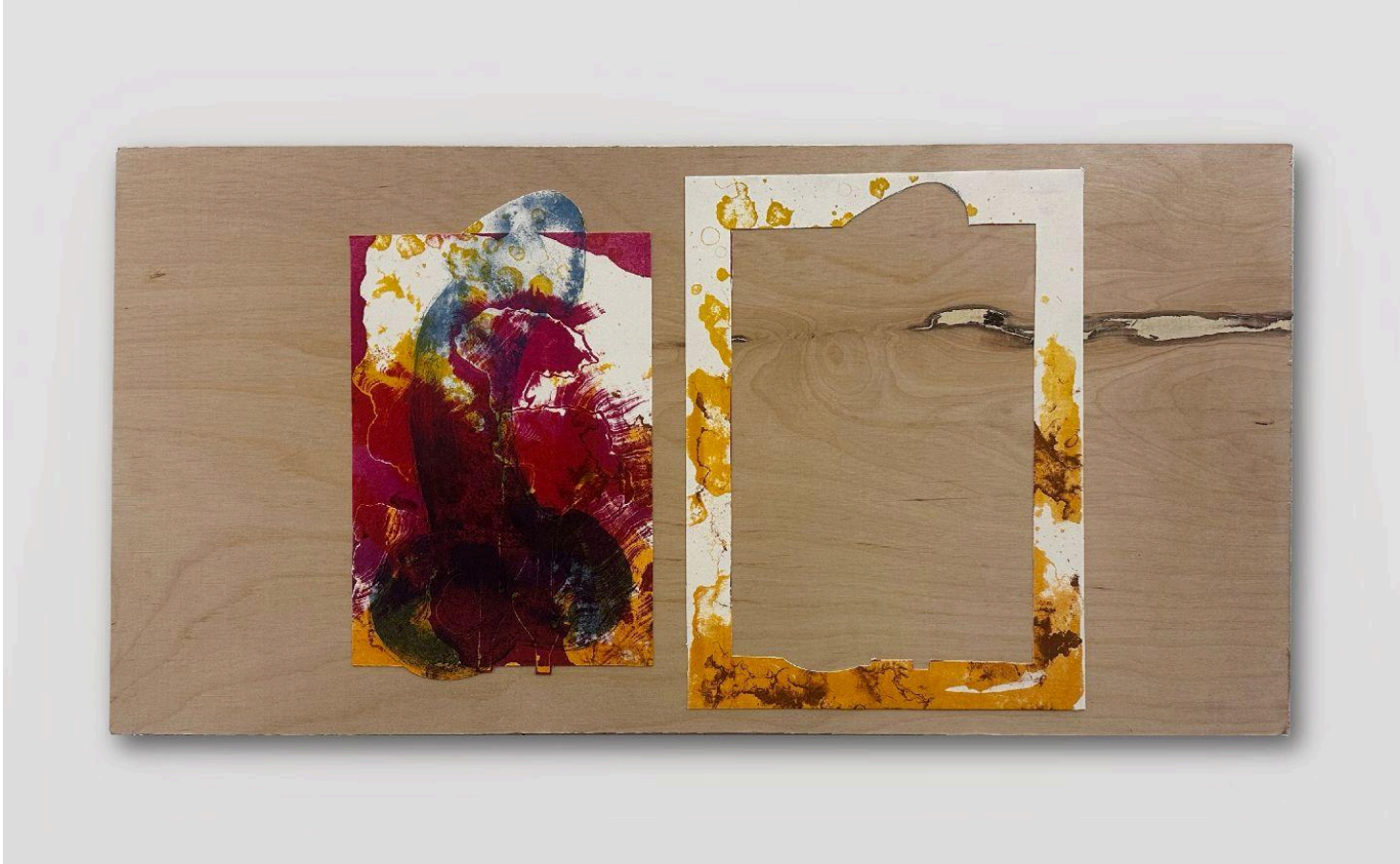
Figure 6: Phallacy IV