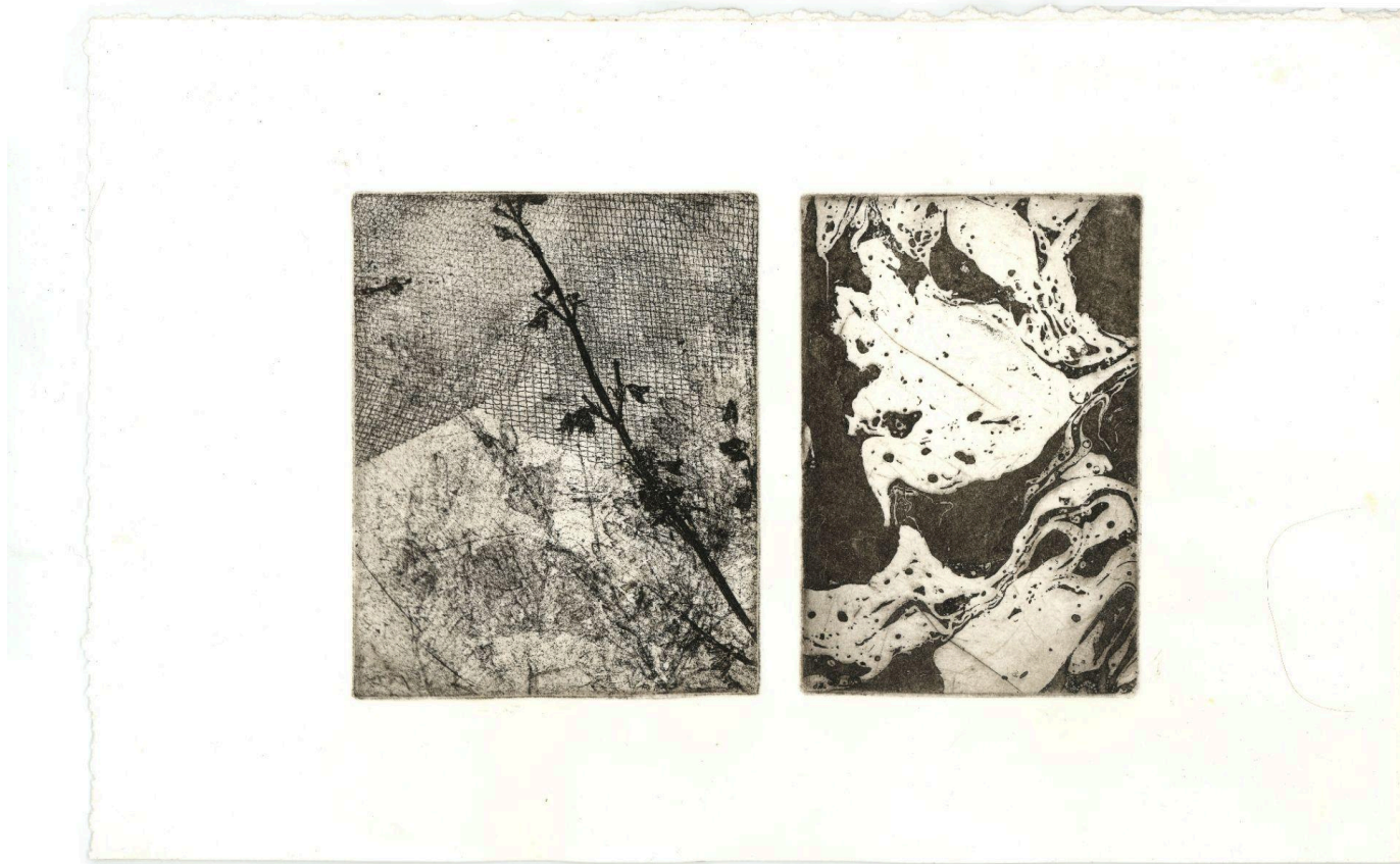
Figure 2: Moving Through Fabric