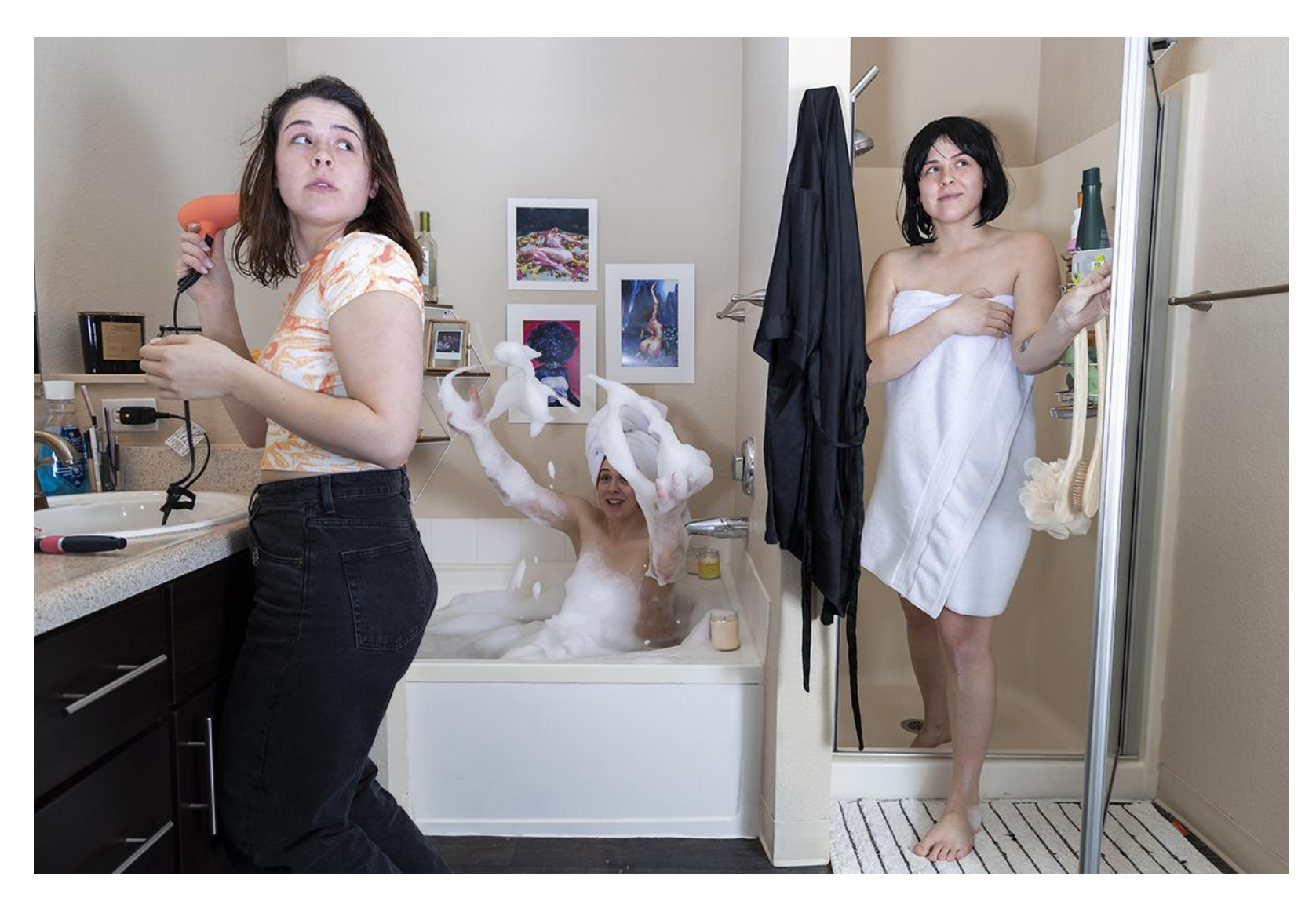
Figure 12: Inner Dialogue 10