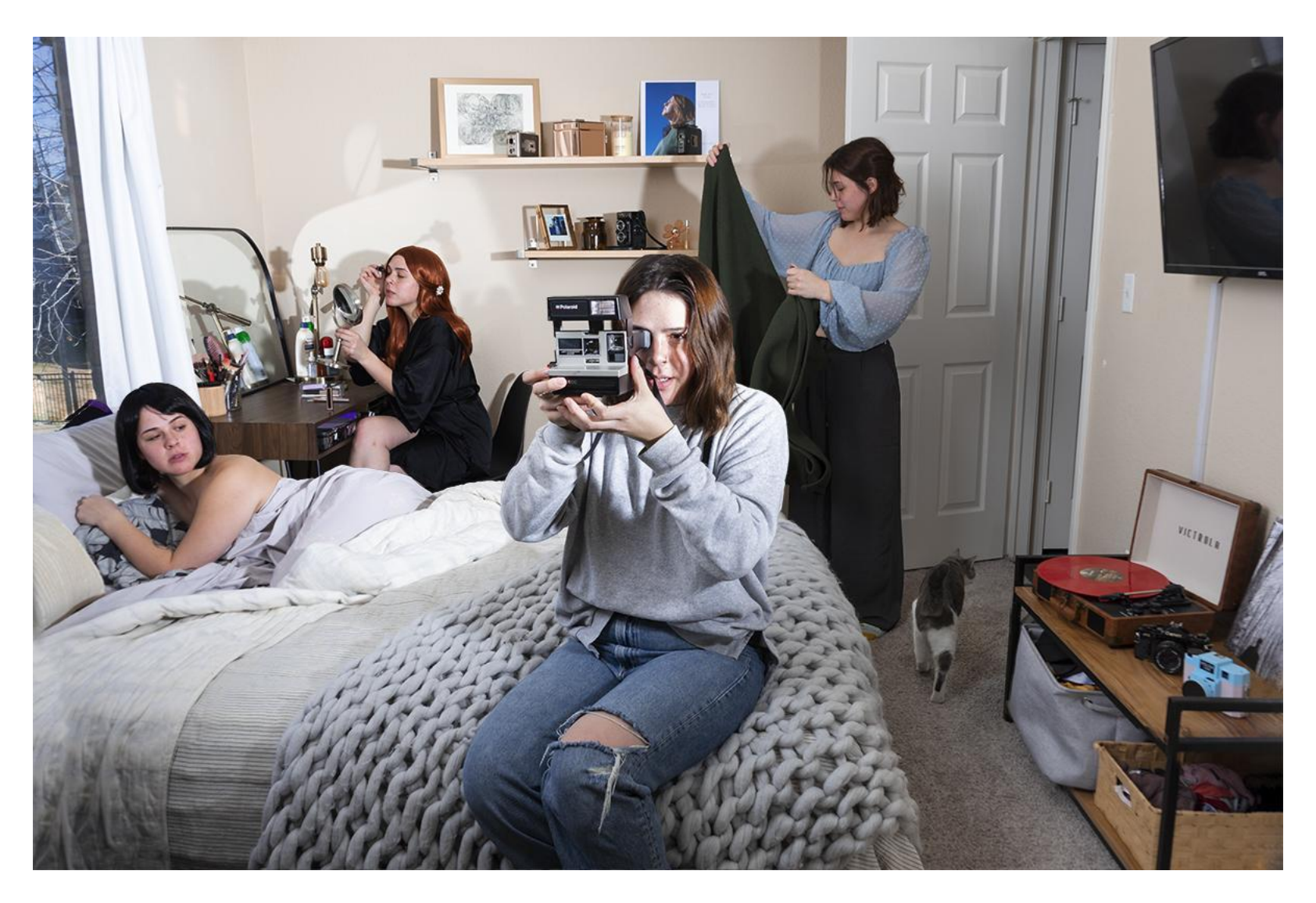
Figure 6: Inner Dialogue 4