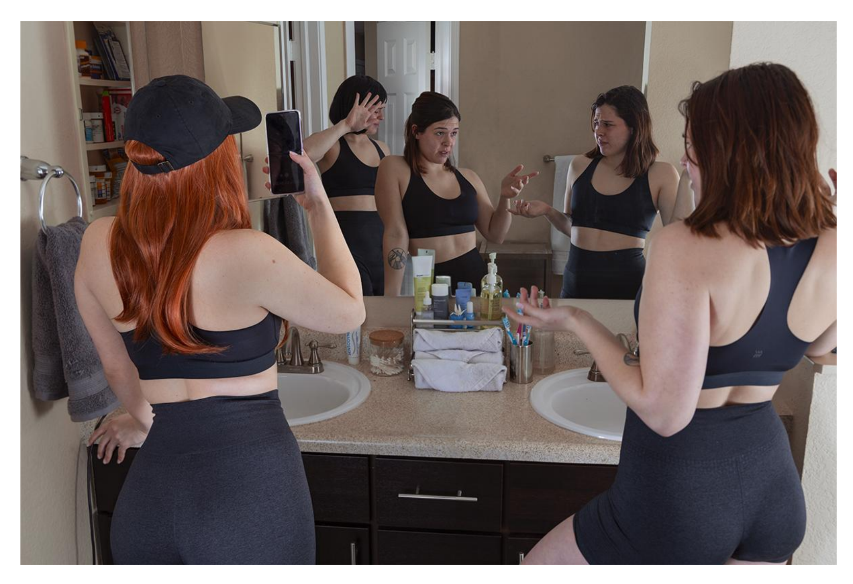
Figure 11: Inner Dialogue 9