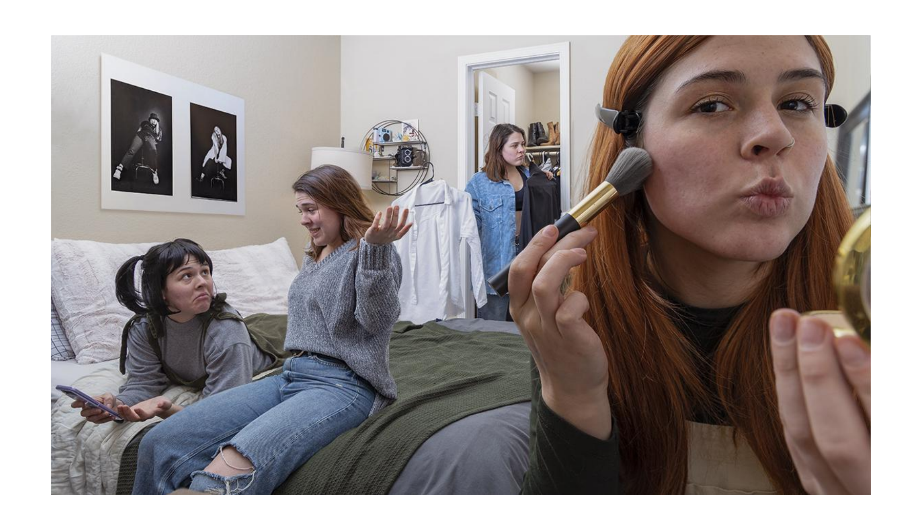
Figure 10: Inner Dialogue 8