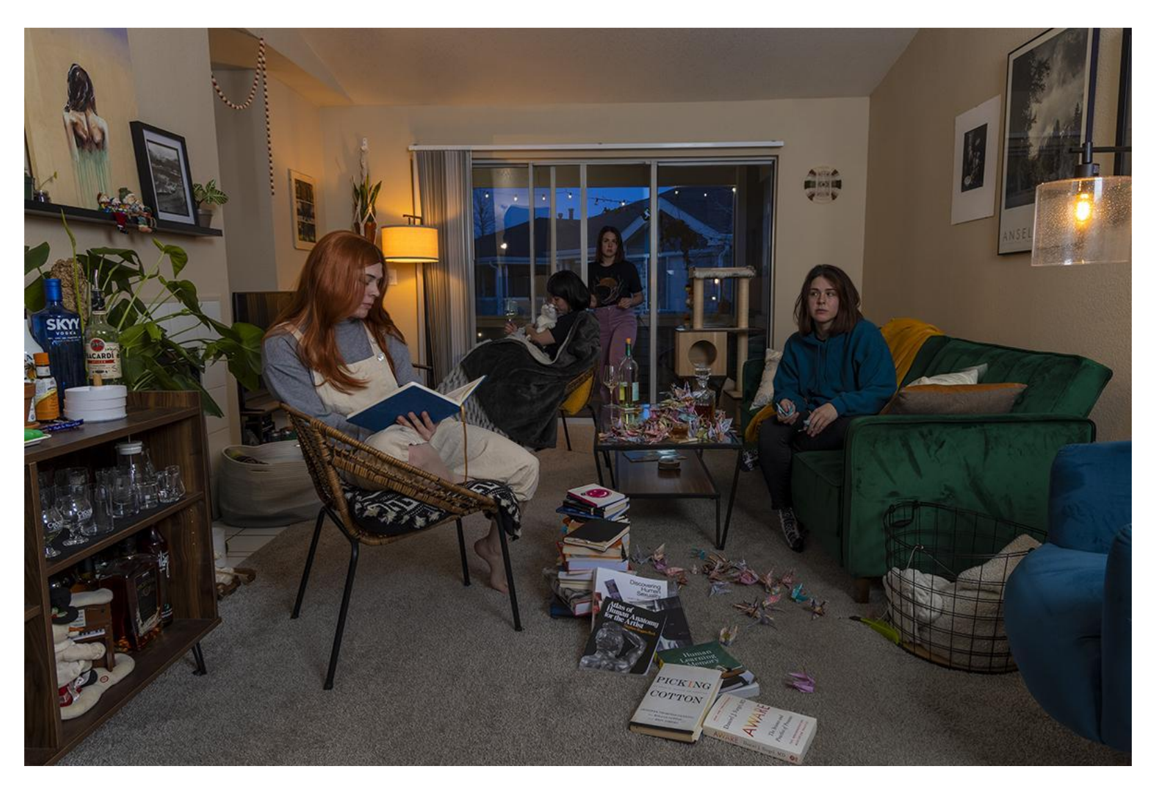
Figure 7: Inner Dialogue 5