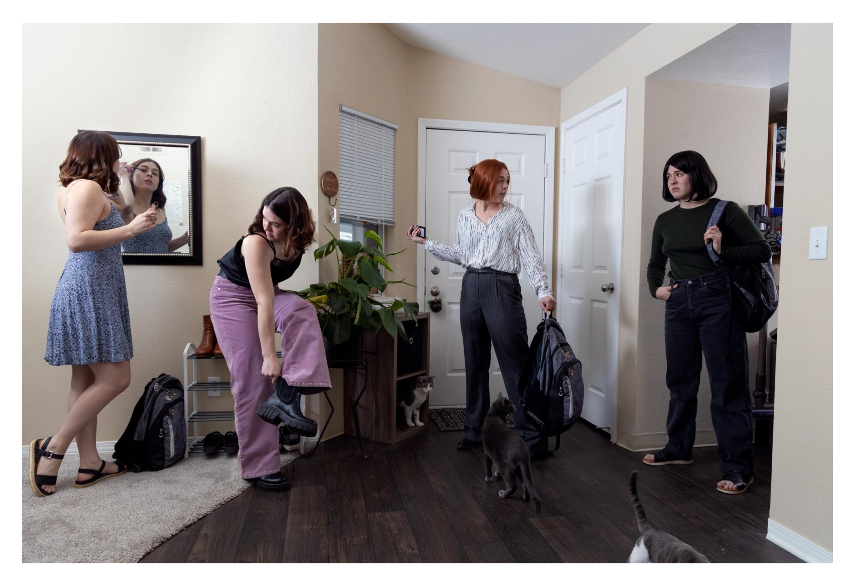
Figure 8: Inner Dialogue 6