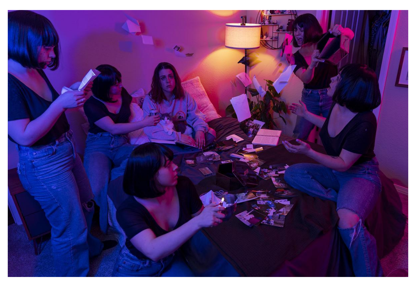
Figure 13: Inner Dialogue 11