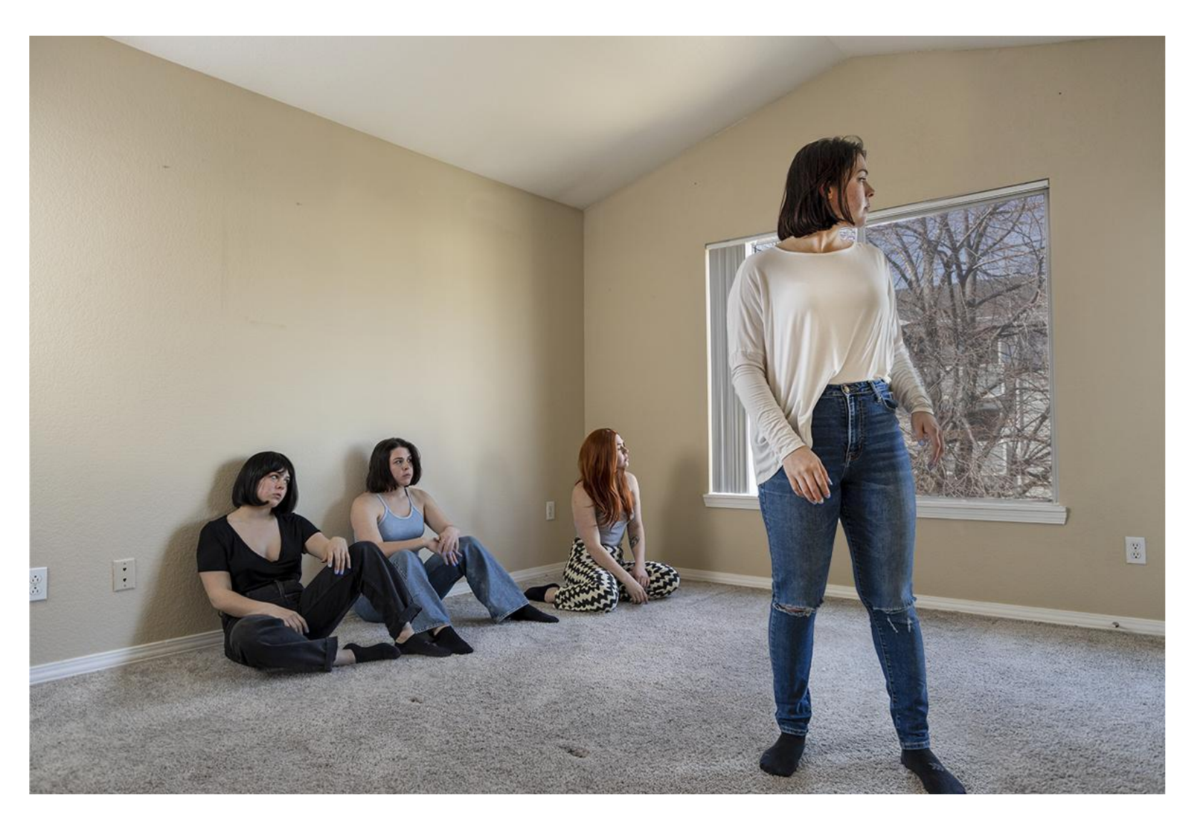
Figure 15: Inner Dialogue 13