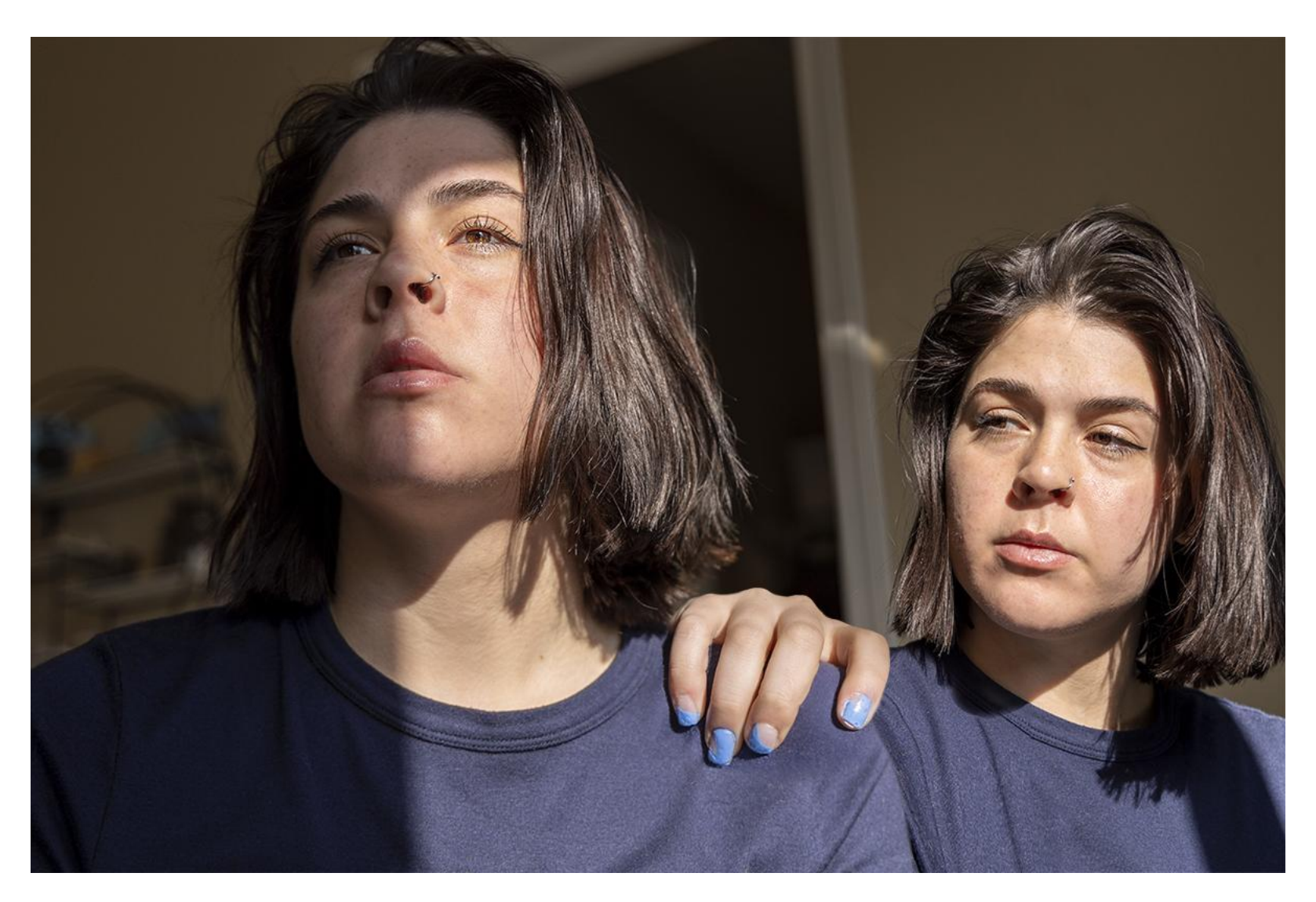
Figure 14: Inner Dialogue 12