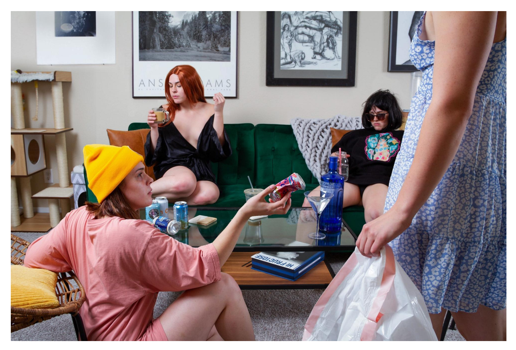
Figure 4: Inner Dialogue 2