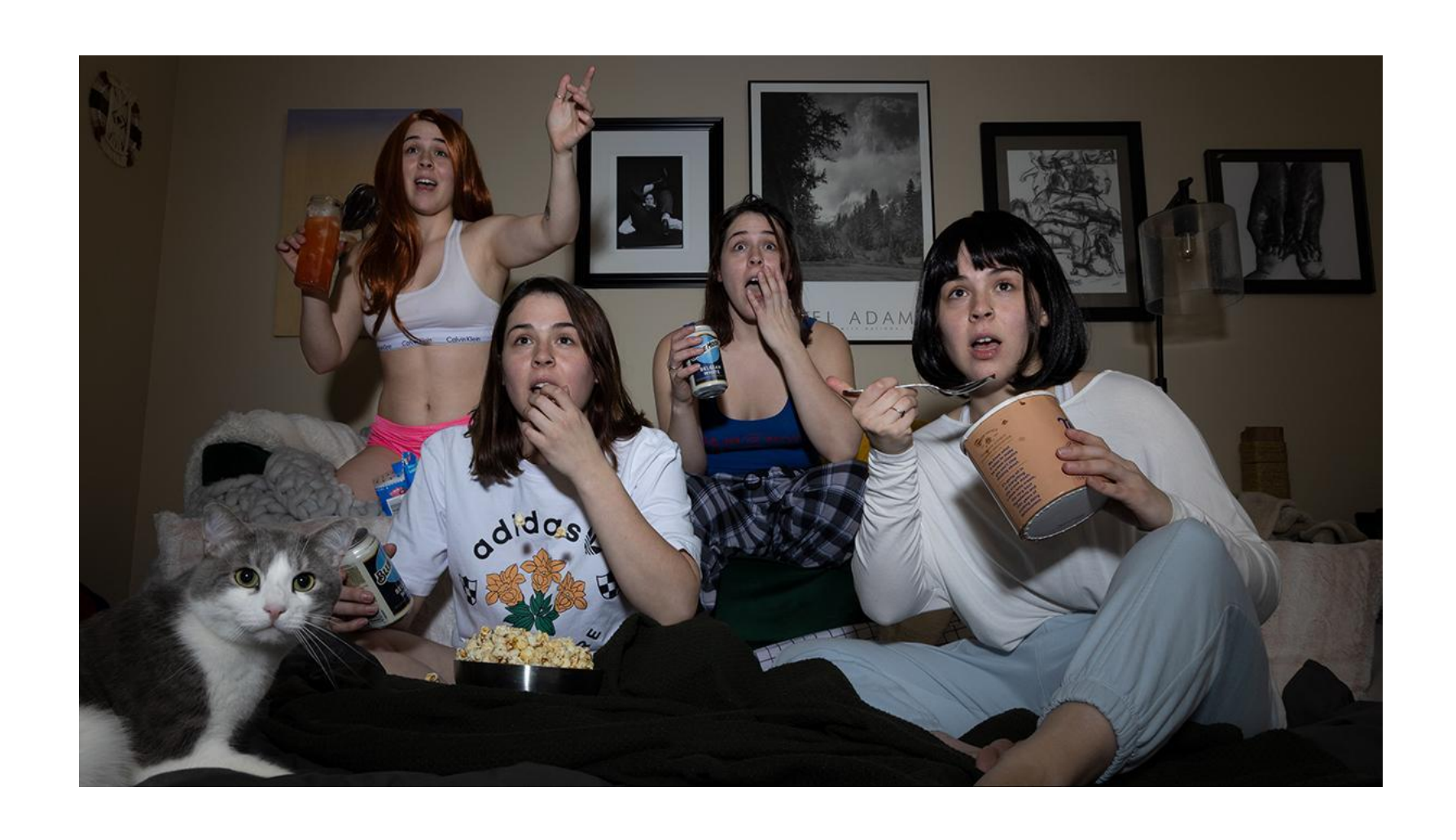
Figure 9: Inner Dialogue 7