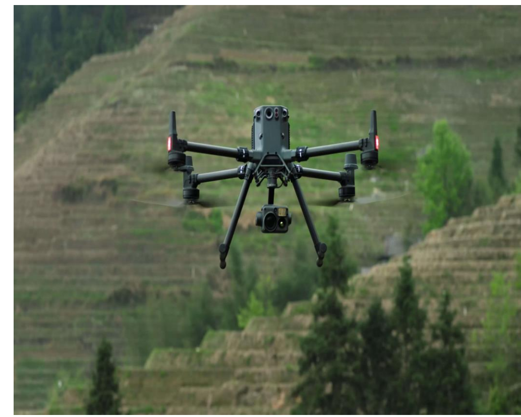
Figure 1. Before and during flight images of the DJI Matrice 350 RTK drone.