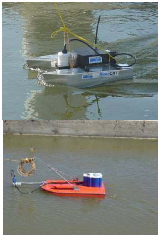
Figure 1. Boat-mounted Acoustic Doppler Profilers collecting flow rate and cross-sectional measurements in irrigation canals