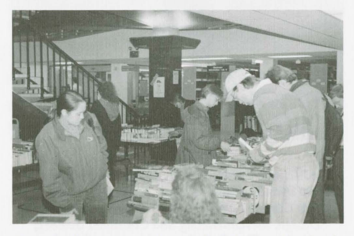
Bargains being snapped up at the Libraries' book sale on November 18, 1993. Approximately 1,600 books were sold, bringing in more than $1,000.00.