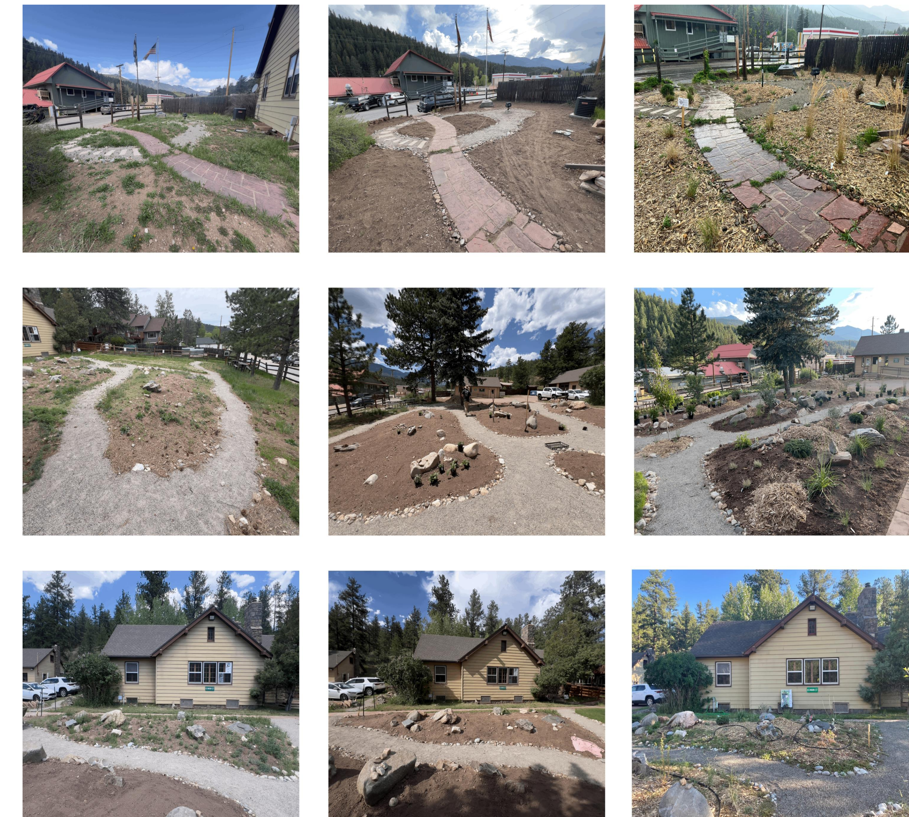
Figure 2. picture of the site on the final day