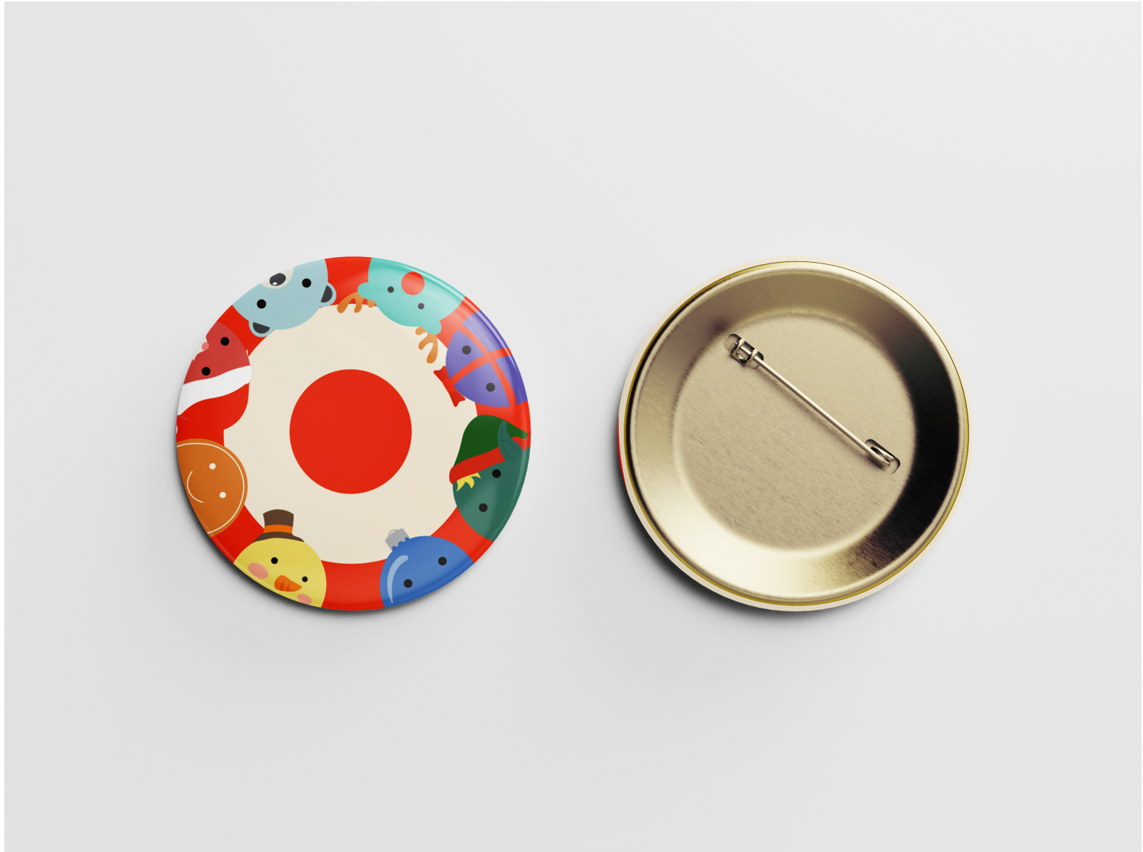
Figure 9:Target campaign Pin