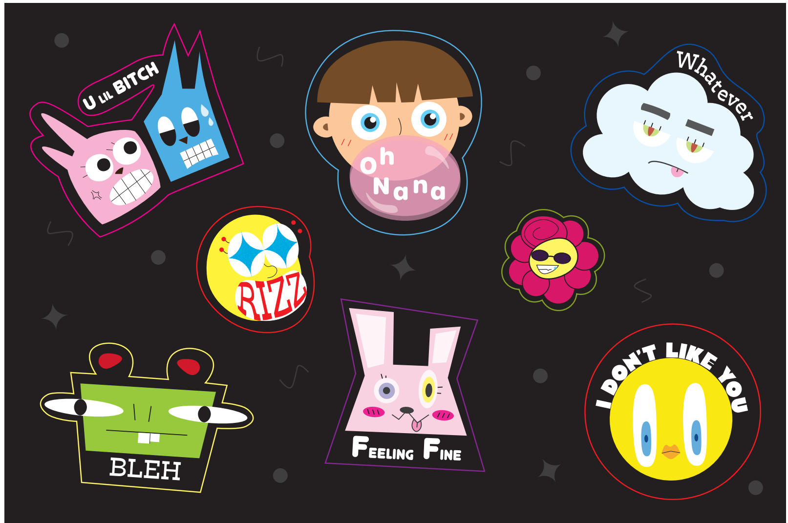
Figure 4: Sticky stickers