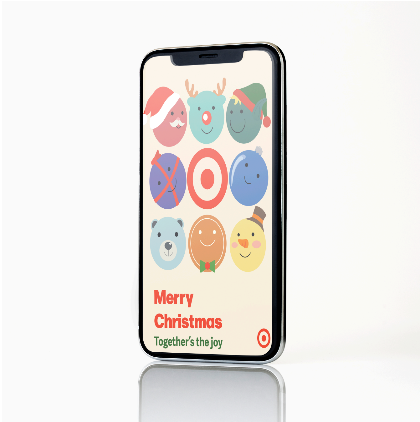
Figure 8: Target campaign instagram