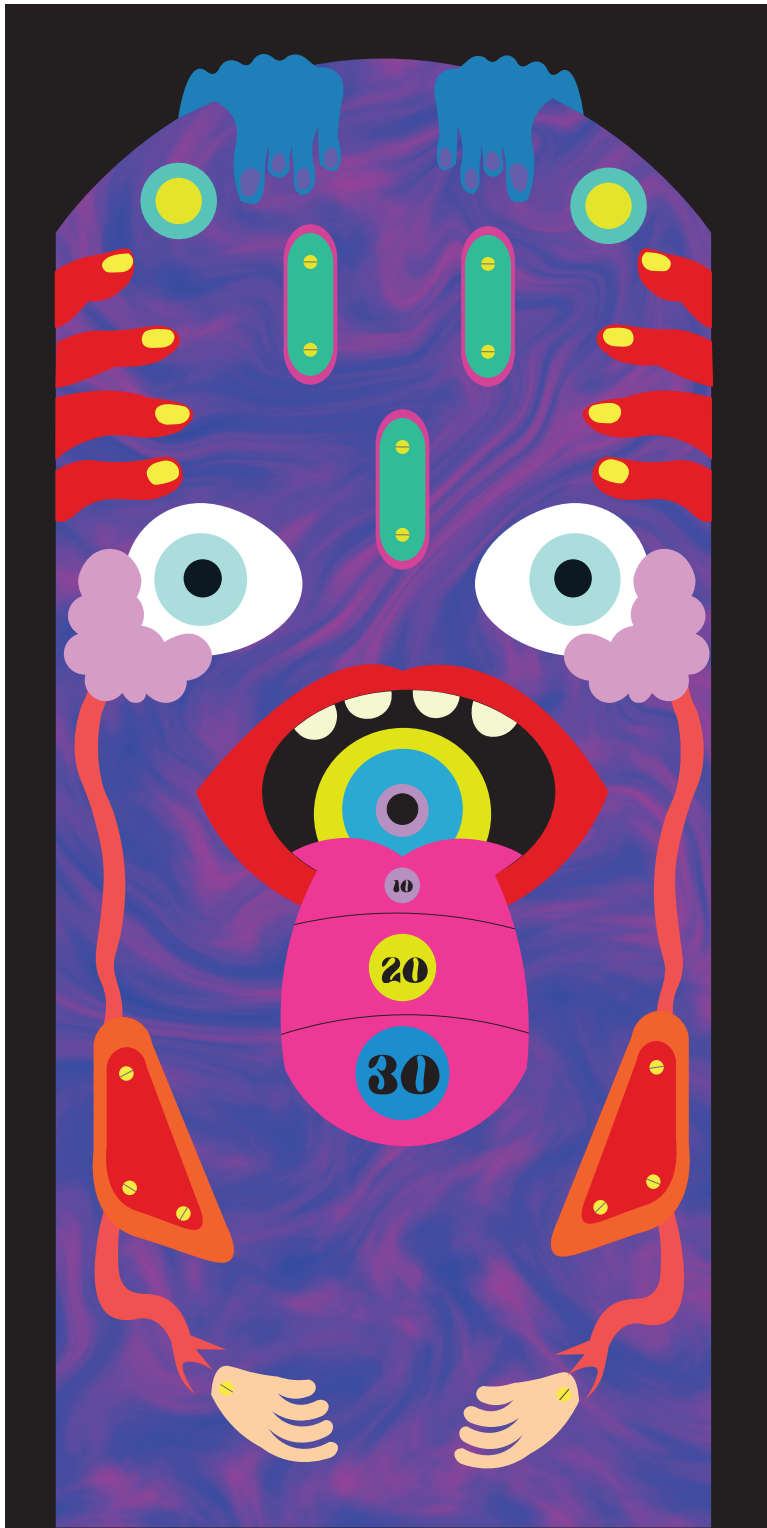
Figure5: Pinball machine design