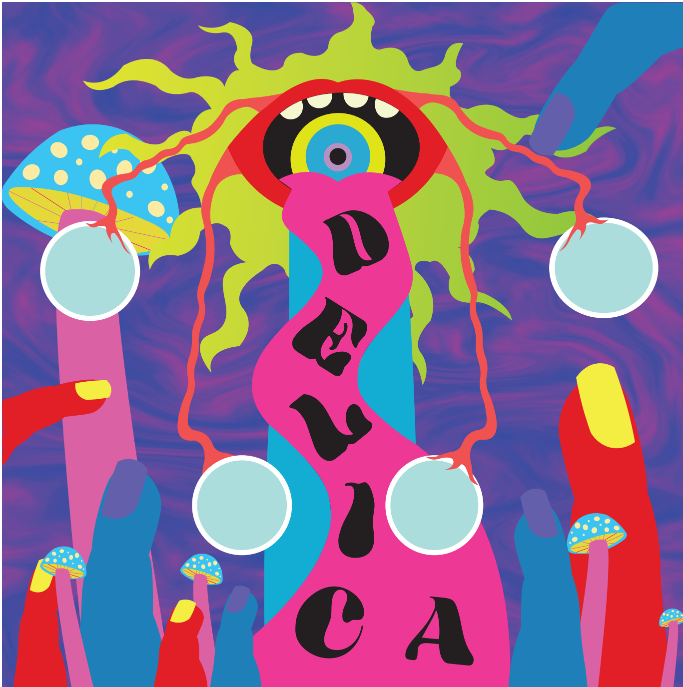
Figure 6: Pinball machine cover (Delica)