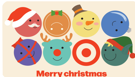
Figure10:Target campaign gift card