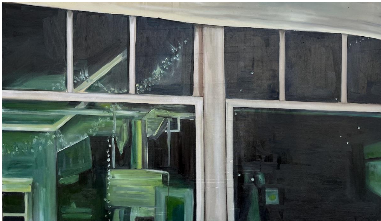
Figure 3: The House My Favorite People Lived In