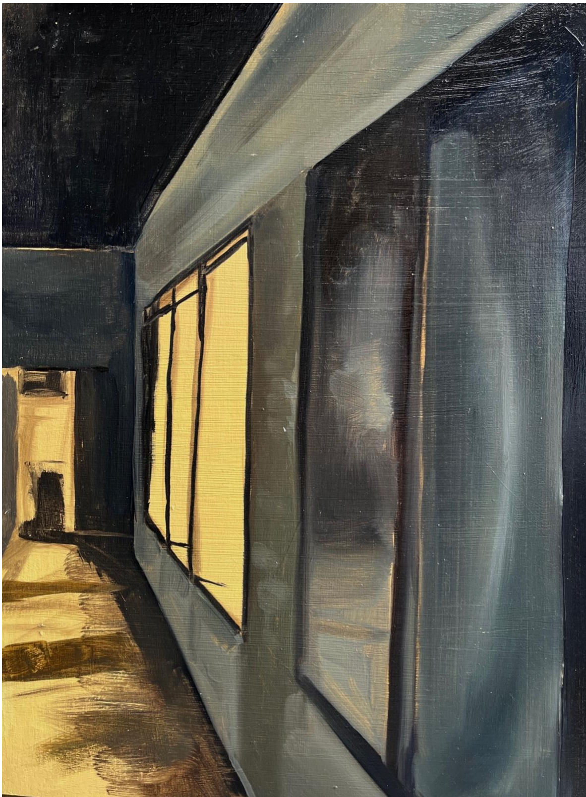
Figure 5: Art Building Study #1