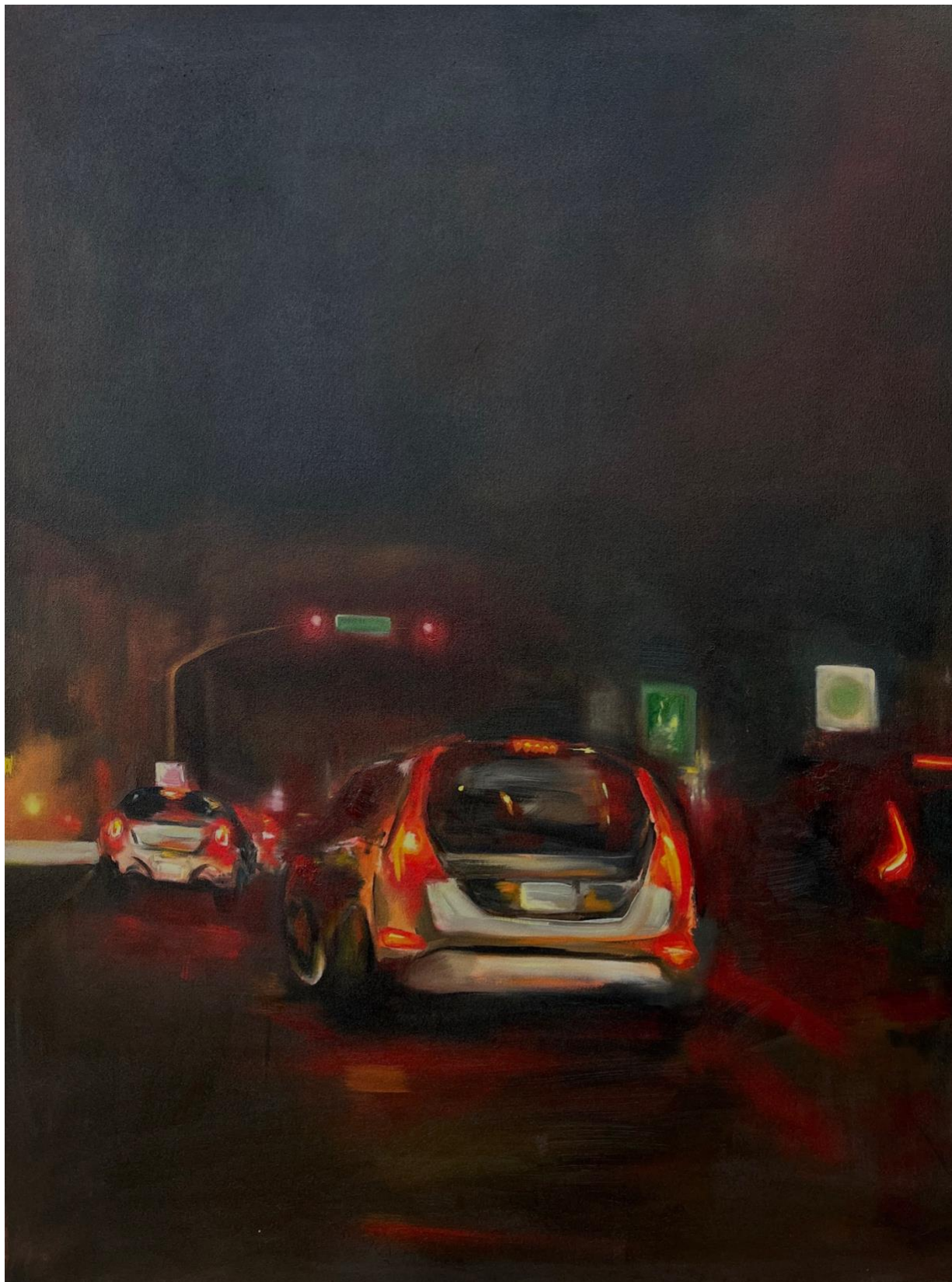
Figure 1: I Could Drive Home With My Eyes Closed