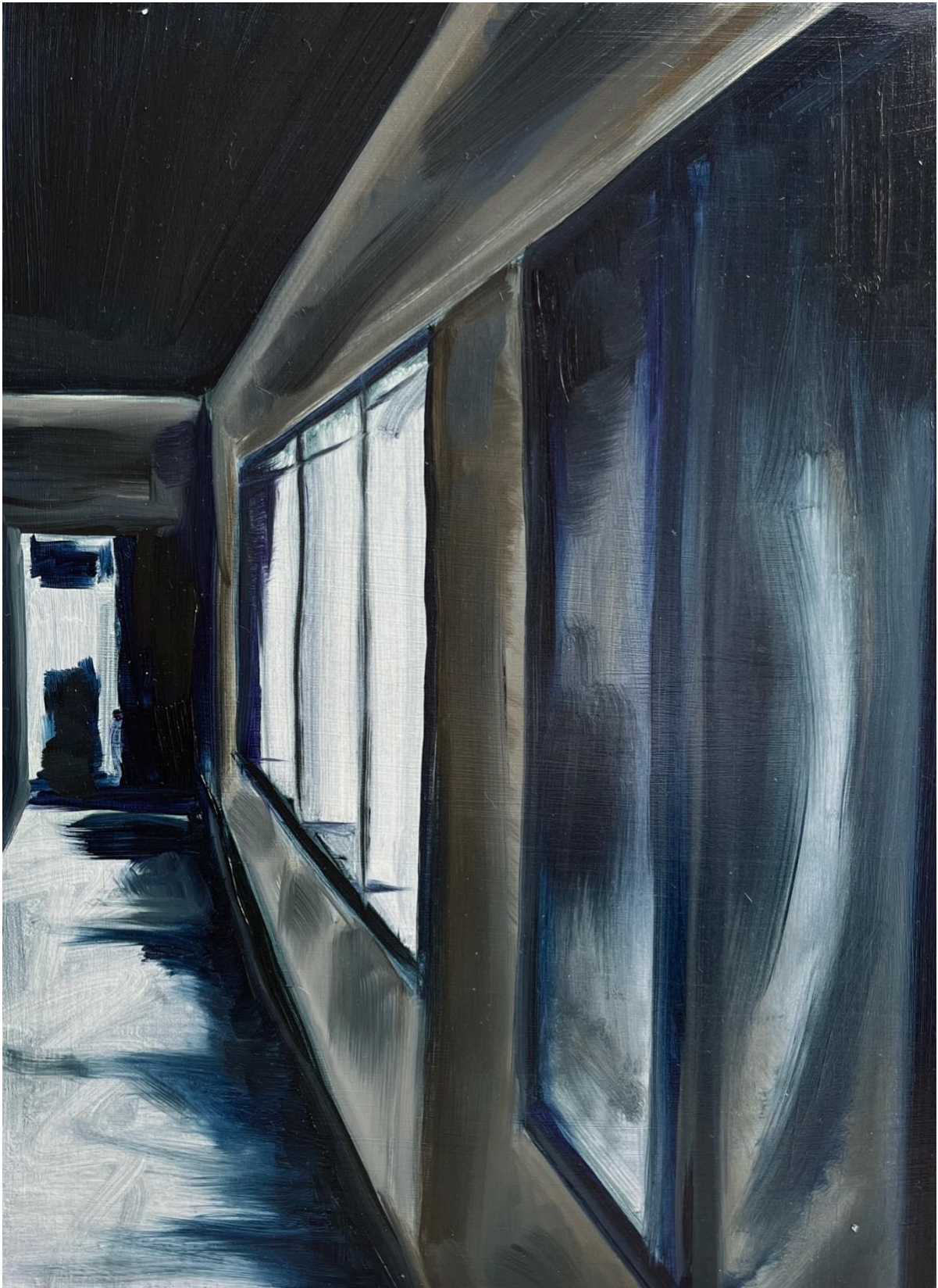
Figure 6: Art Building Study #2