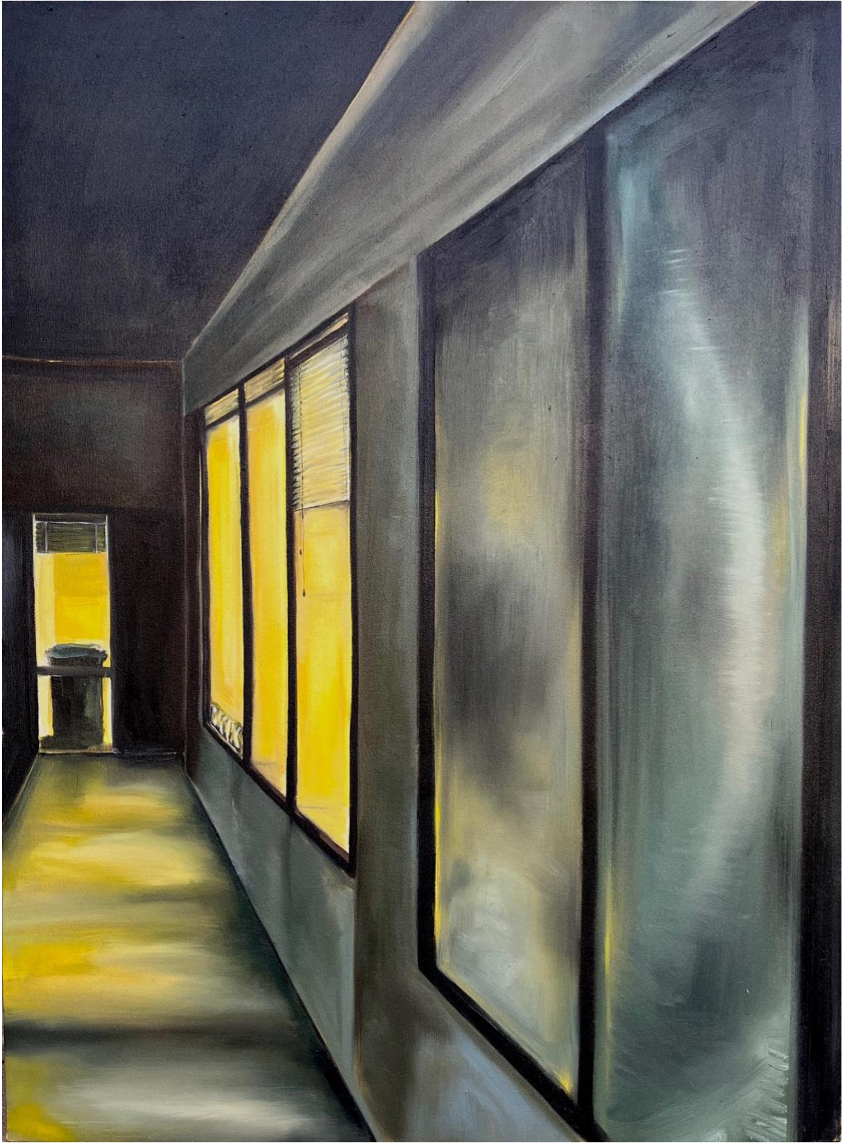
Figure 4: My Favorite Trash Can