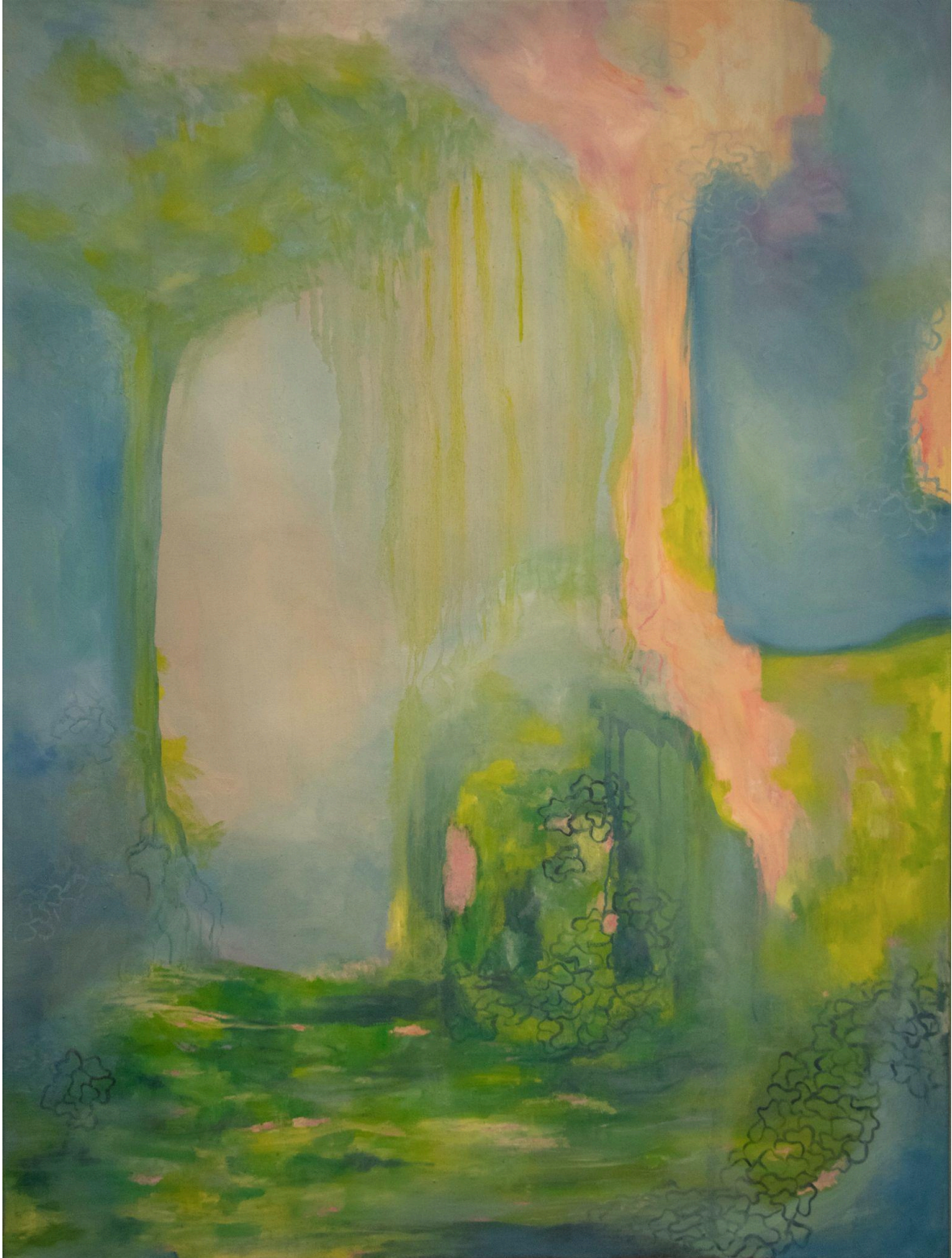
Figure 6: Willows