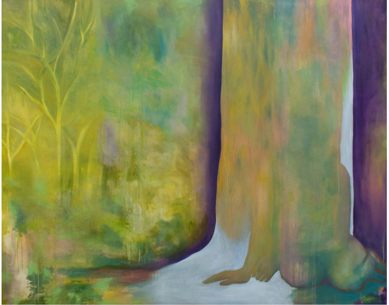
Figure 3: Echos