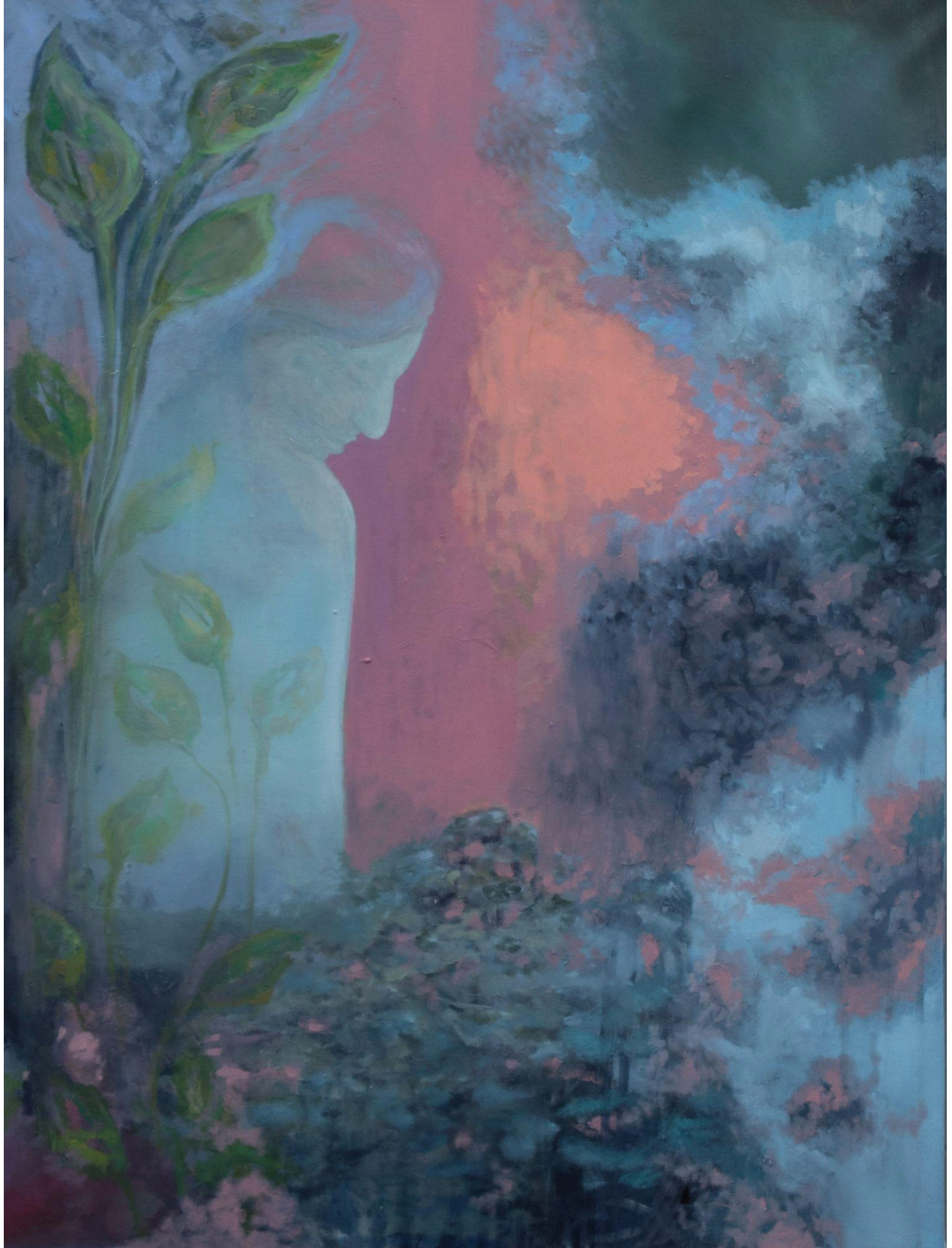
Figure 1: Venture