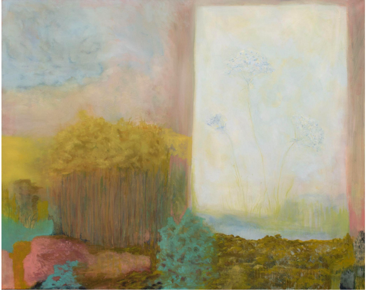
Figure 4: Queen Anne's Lace