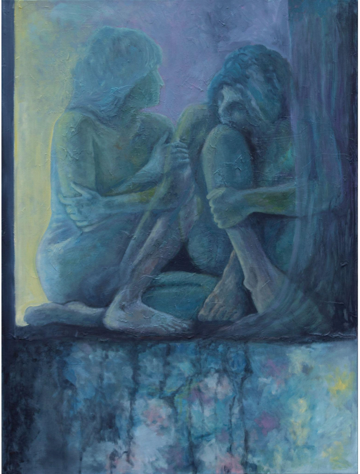
Figure 2: Songbird