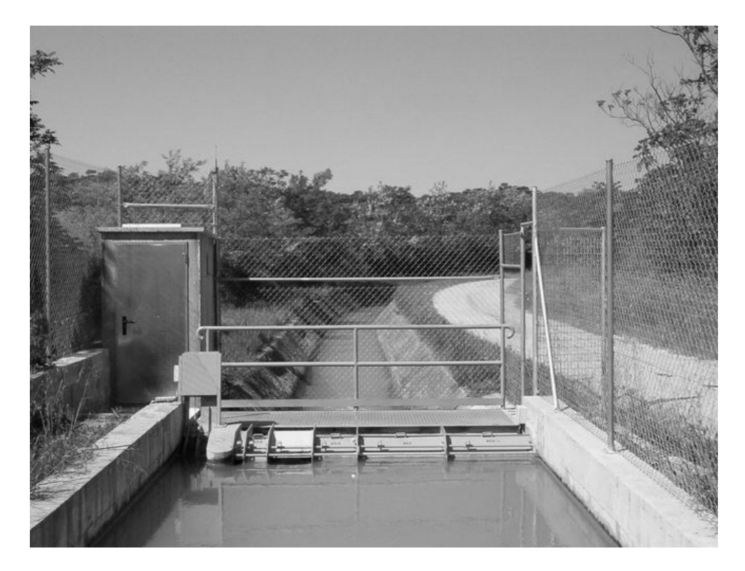
Figure 4. Whole hut and modules.

The detail of the moving cylinders is different according to the size of the module. Photograph number 5 shows small modules of plain board.