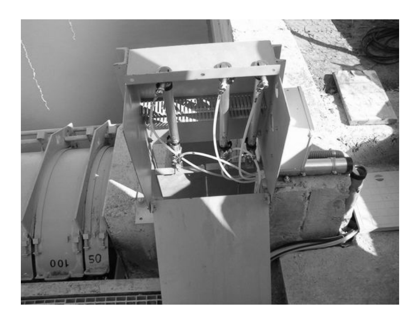
Figure 5. Detail of pneumatic cylinders of the plain modules.

The detail of the moving cylinders is different according to the size of the module. Photograph number 5 shows small modules of plain board.