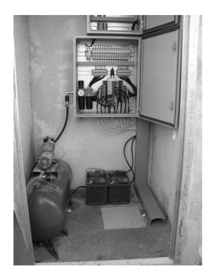
Figure 3- Interior of the hut. Motor, compressor, tank, batteries, etc.

Figure 4 displays the whole hut and the distributors set. There are two types of distributors or modules: