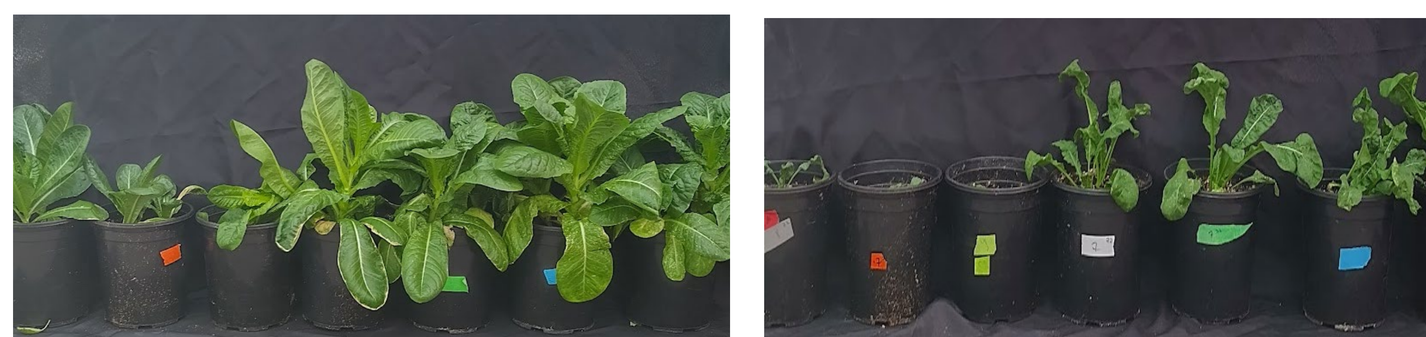
Figure 1. Vegetable crops grown in the greenhouse

I attended the Larimer County Farmers Market (Fort Collins, Colorado) with Alison O'Connor, Extension horticulture professor. There I was introduced to several vegetable farmers. These farms were interested because of their germination practices using peat. Many farmers are interested in more sustainable options than peat moss. I scheduled interviews with three of these farmers and discussed their major questions and concerns with potentially adopting this material. Based on these conversations, I created a short informal fact sheet for farmers to reference in the future.