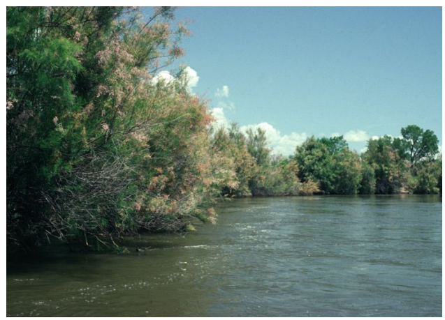
Tamarix ramosissima Shrubland