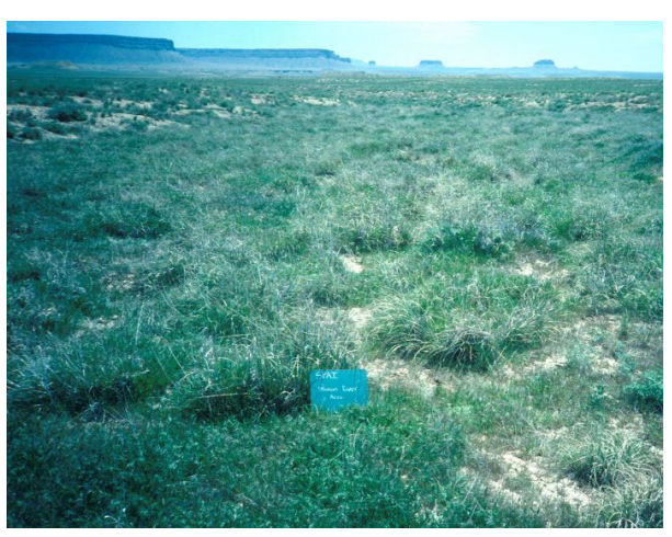
Sporobolus airoides Herbaceous Vegetation