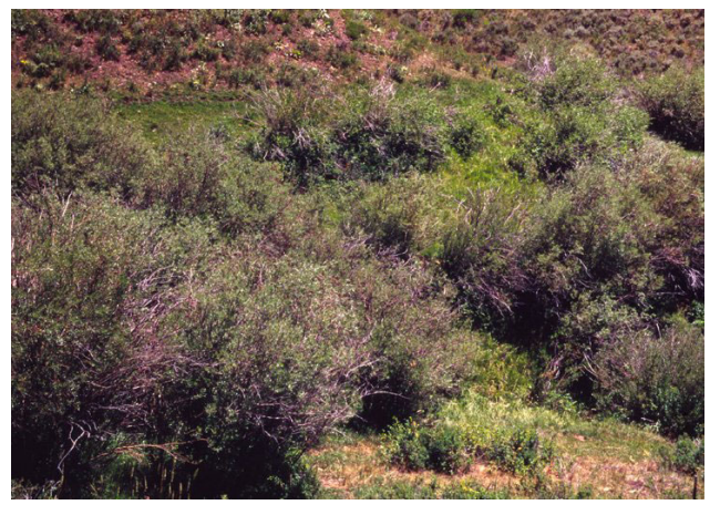
Salix drummondiana / Carex aquatilis Shrubland