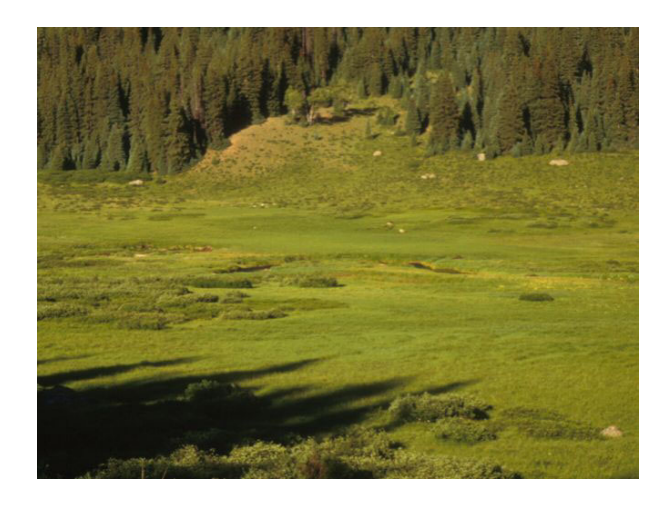
Carex microptera Herbaceous Vegetation