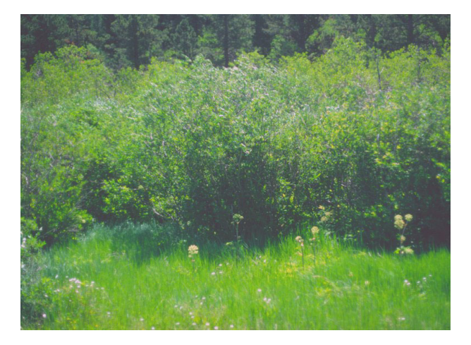
Salix monticola / Calamagrostis canadensis Shrubland