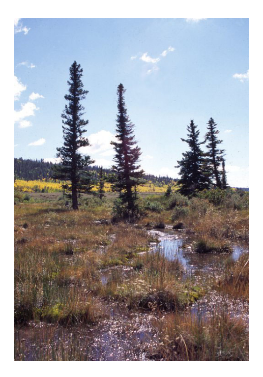
Kobresia myosuroides – Thalictrum alpinum Herbaceous Vegetation