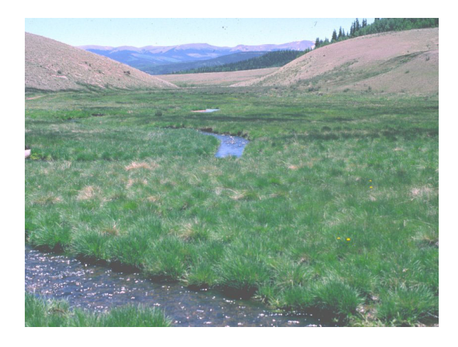
Deschampsia cespitosa Herbaceous Vegetation

Carex microptera Herbaceous Vegetation Deschampsia cespitosa Herbaceous Vegetation Kobresia myosuroides – Thalictrum alpinum Herbaceous Vegetation Triglochin maritima – Triglochin palustre Herbaceous Vegetation