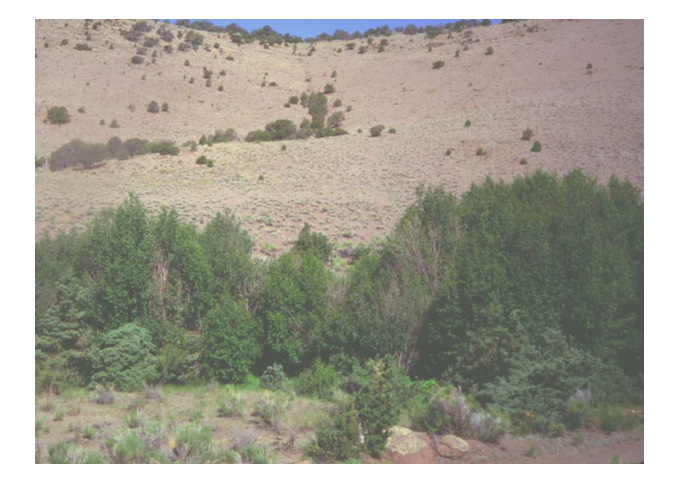
Populus angustifolia / Alnus incana ssp. tenuifolia Woodland

Populus angustifolia / Alnus incana ssp. tenuifolia Woodland Salix drummondiana / Carex aquatilis Shrubland Salix drummondiana / Mesic Forb Shrubland Salix monticola / Calamagrostis canadensis Shrubland Salix monticola / Carex aquatilis Shrubland Spartina pectinata Western Herbaceous Vegetation Tamarix ramosissima Shrubland