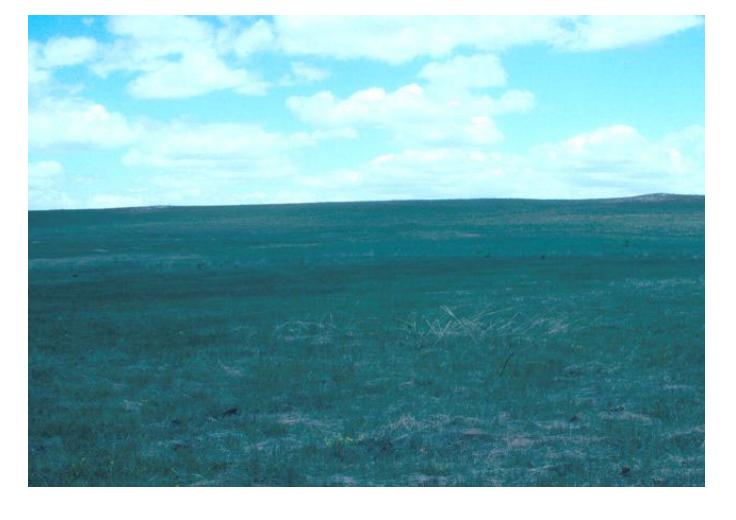
Pascopyrum smithii – (Buchloe dactyloides) – Ambrosia linearis – Ratibida tagetes Herbaceous Vegetation

Carex nebrascensis herbaceous vegetation