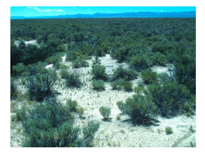
Sarcobatus vermiculatus - Bare ground Shrubland

Amphiscirpus nevadensis Herbaceous Vegetation Sarcobatus vermiculatus – Bare ground Shrubland Sporobolus airoides Herbaceous Vegetation