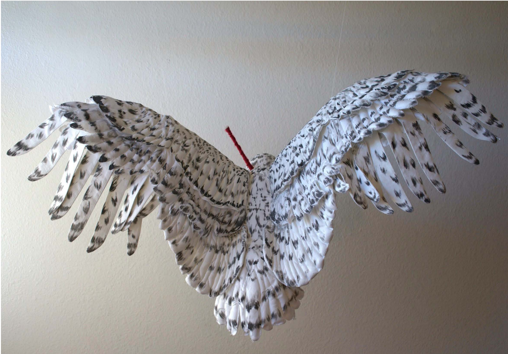
Figure 2: Blood on the Snow, Detail