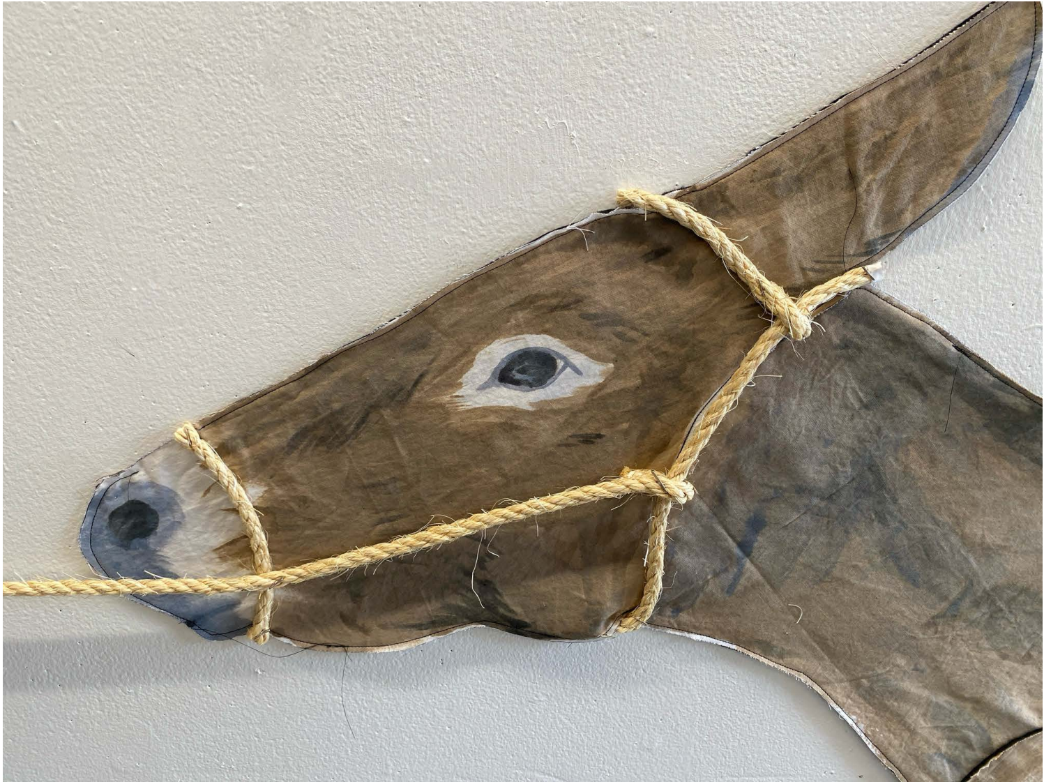
Figure 10: Let it Go, Detail