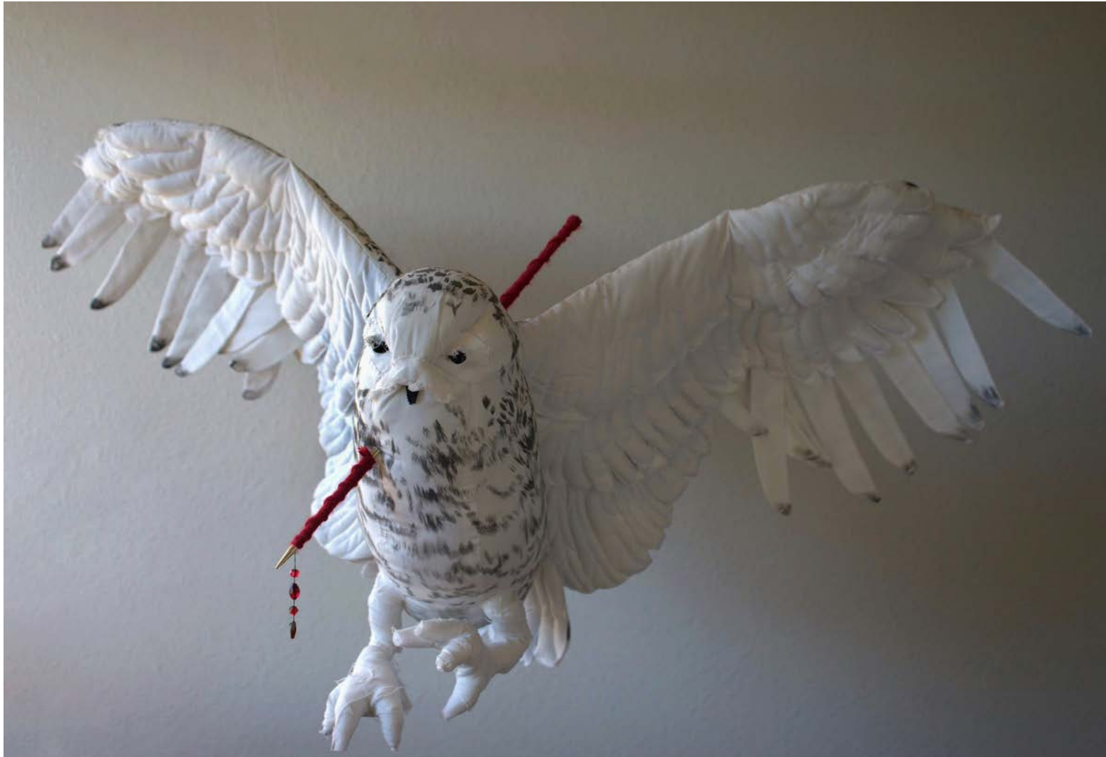
Figure 1: Blood on the Snow