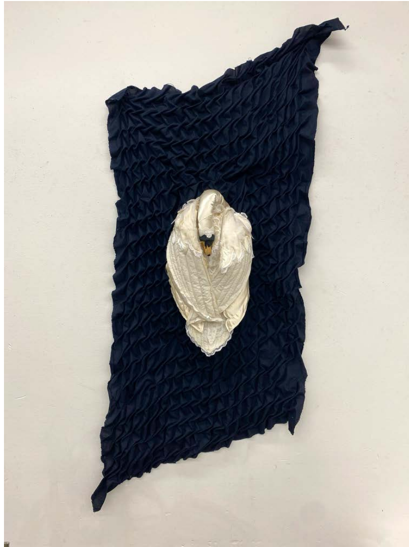
Figure 7: Tranquility