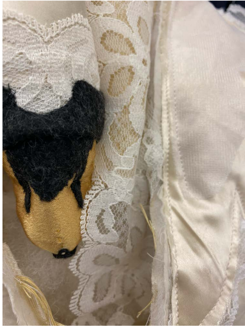
Figure 8: Tranquility, Detail