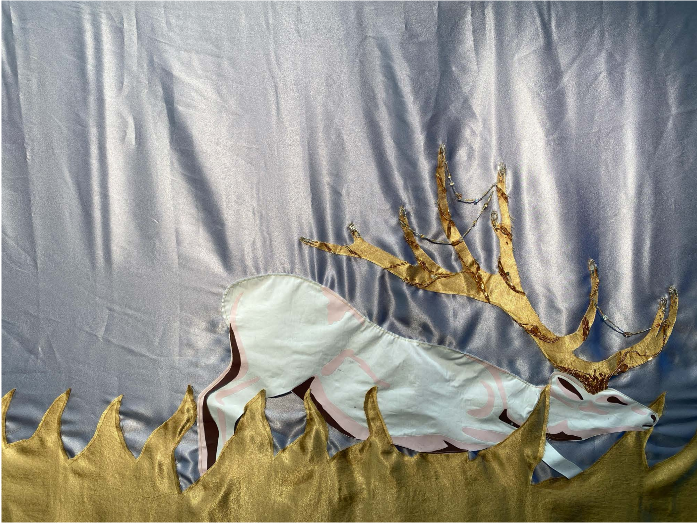
Figure 5: I Will Carry your Legacy