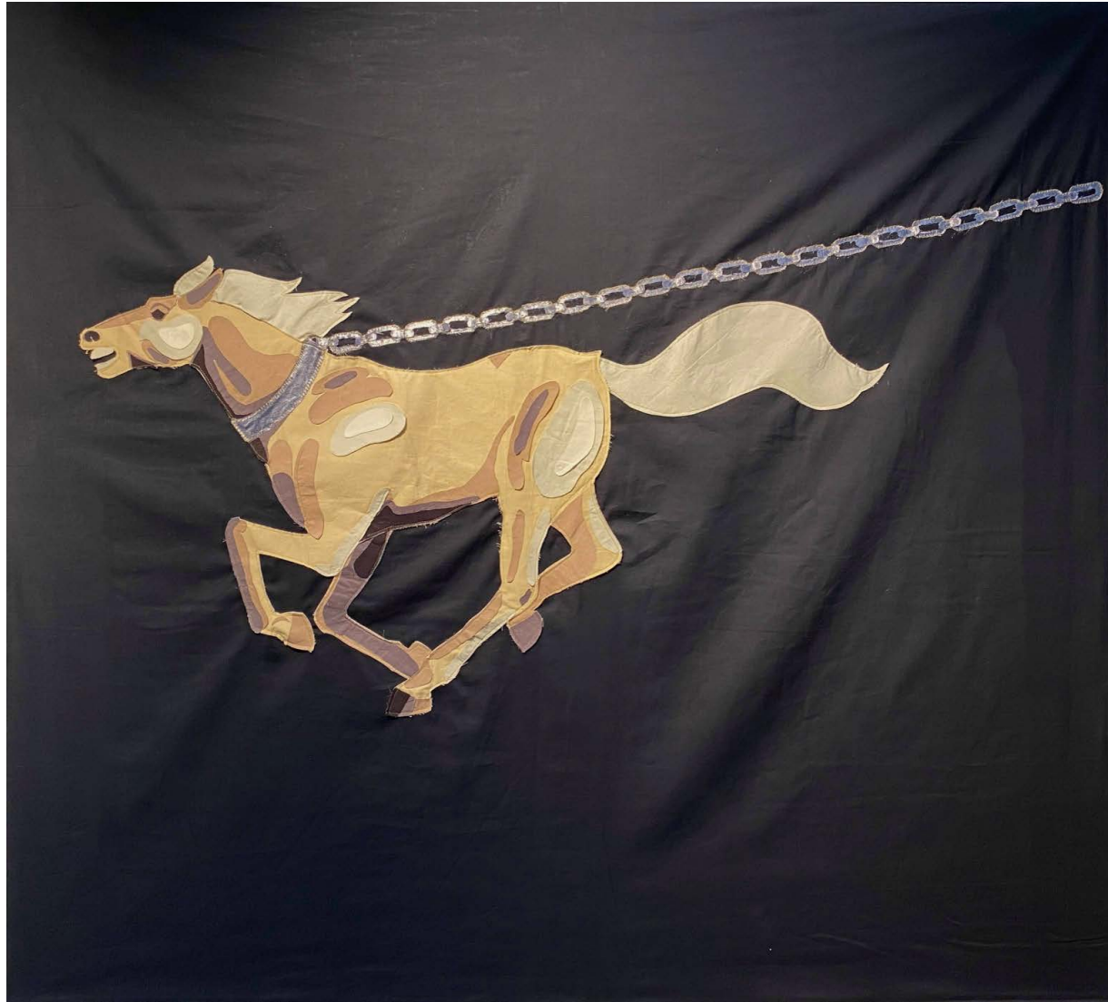
Figure 4: Untitled #1