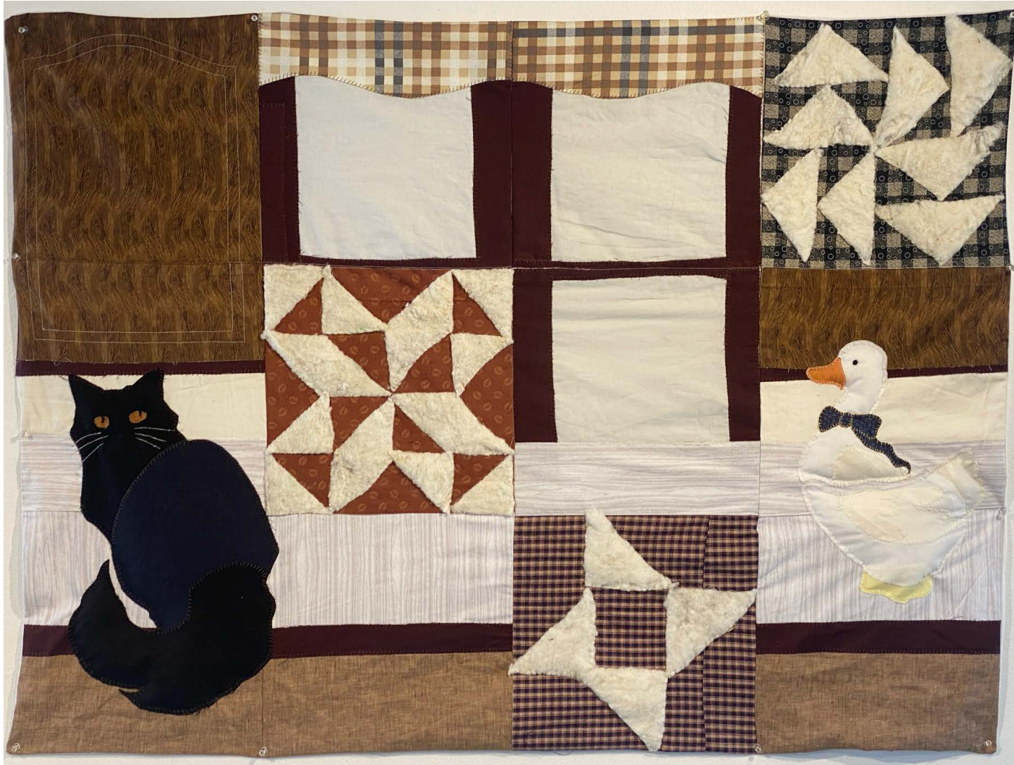
Figure 3: Aunt Donna and Uncle Ray's Kitchen