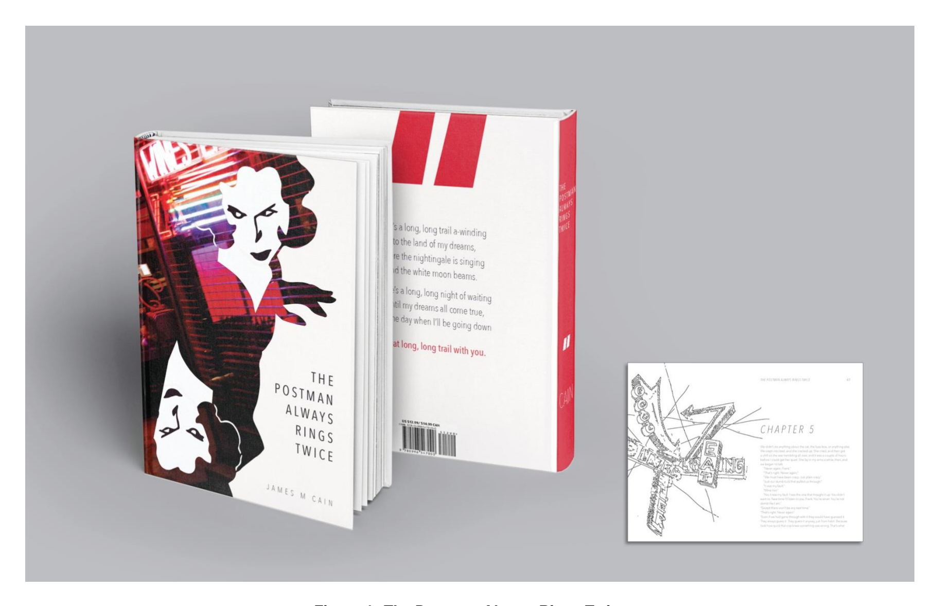
Figure 4: The Postman Always Rings Twice Book Jacket Re-Design and Interior Illustration