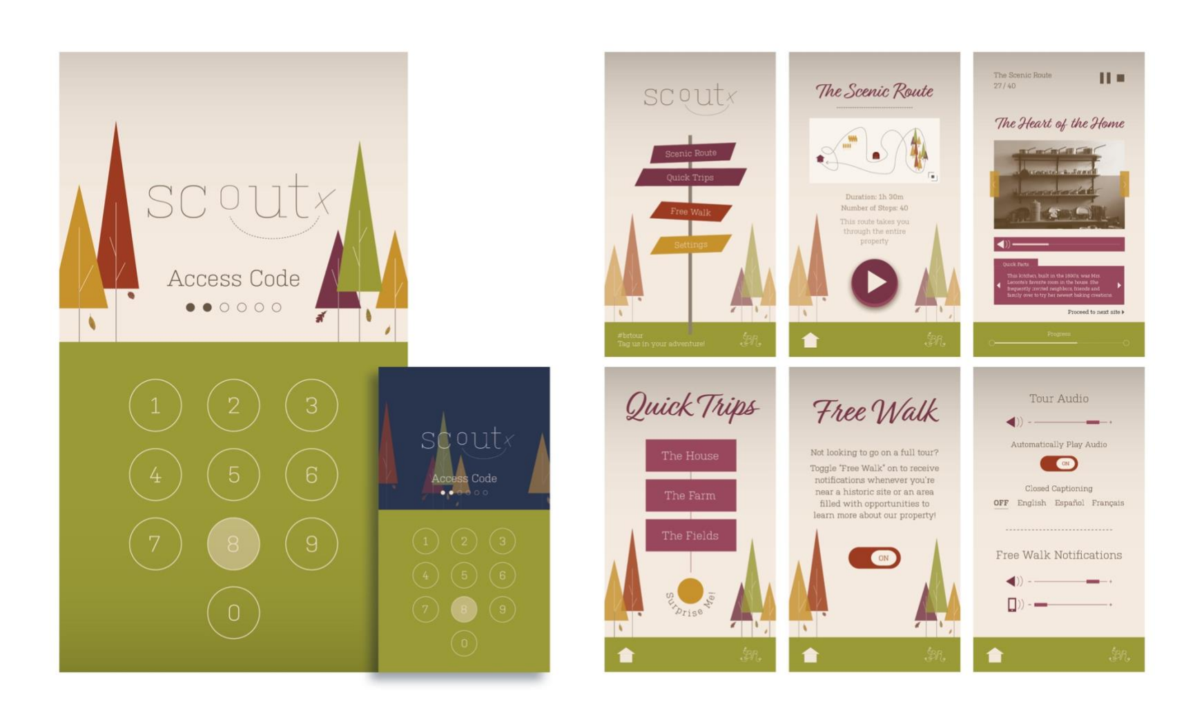
Figure 5: Scoutx Mobile App Design