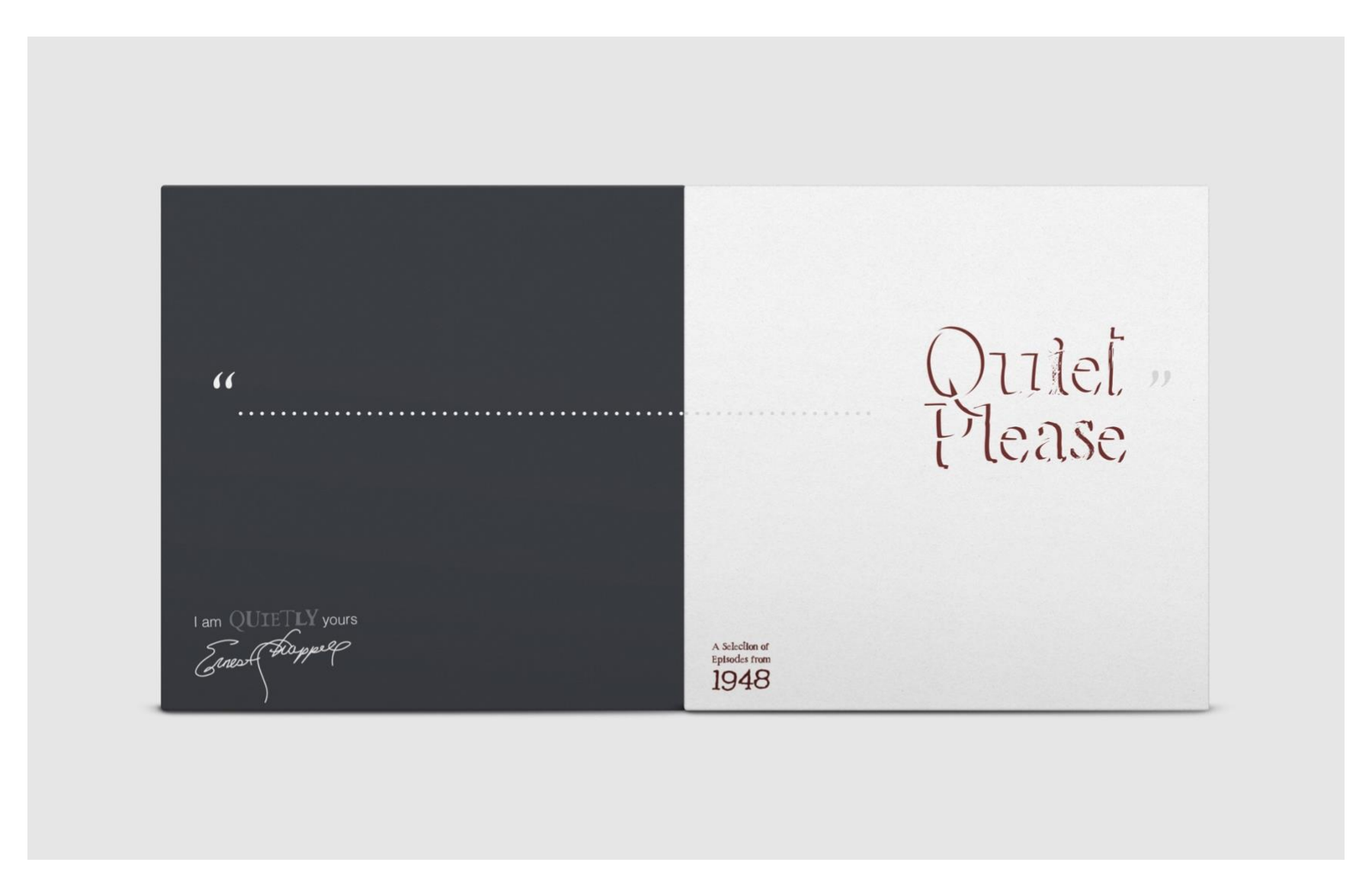
Figure 1: Quiet Please! Radio Show Collection Vinyl Album Cover