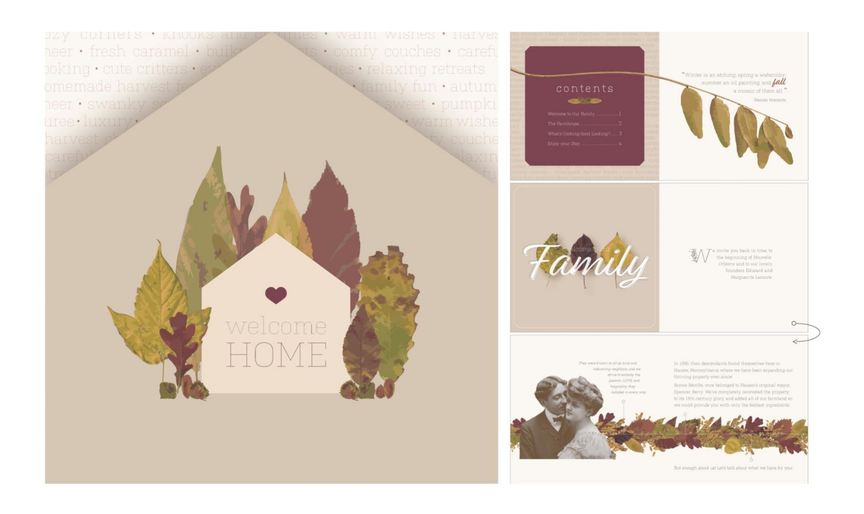
Figure 9: Bonne Récolte Brochure Part 1