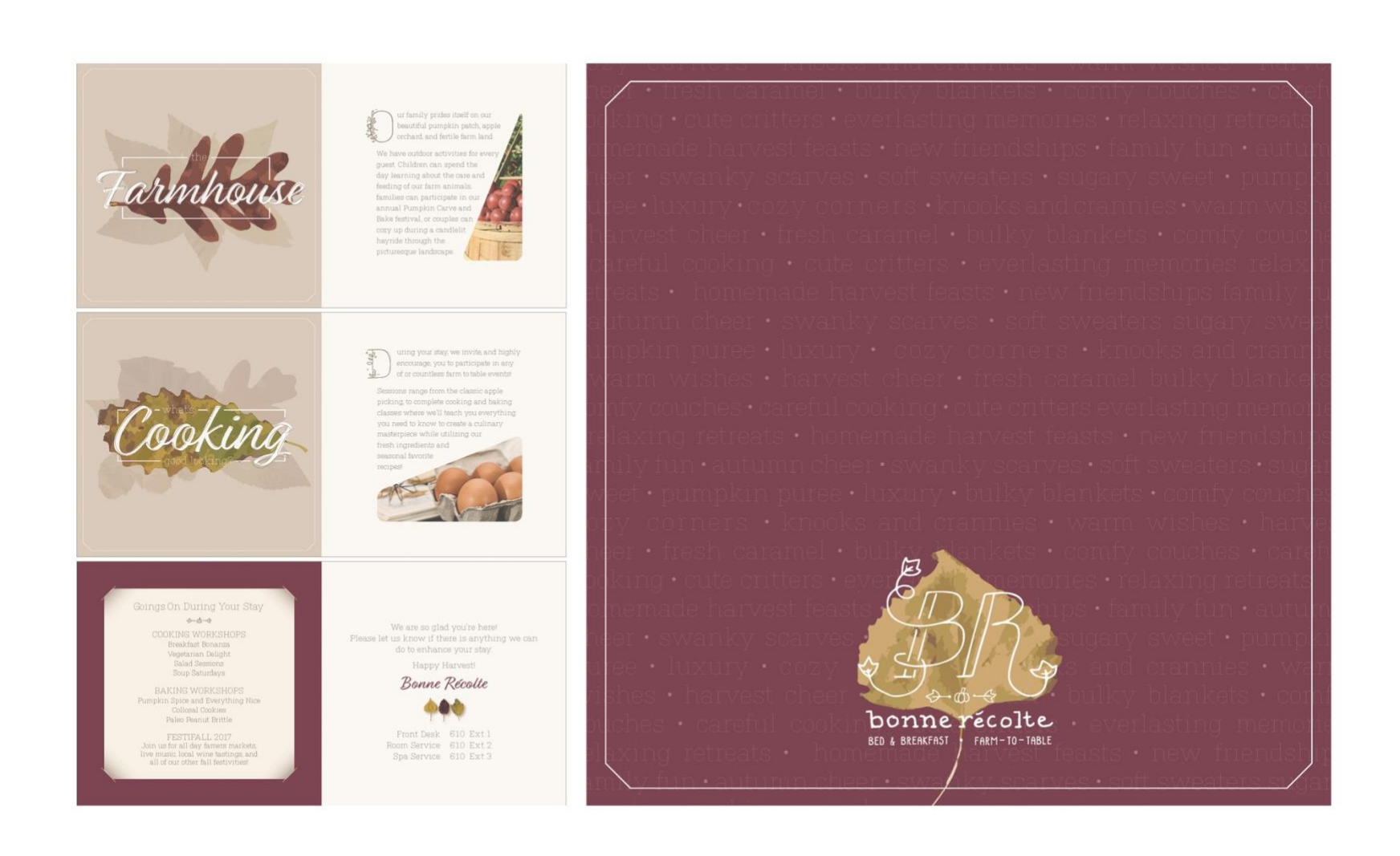
Figure 10: Bonne Récolte Brochure Part 2