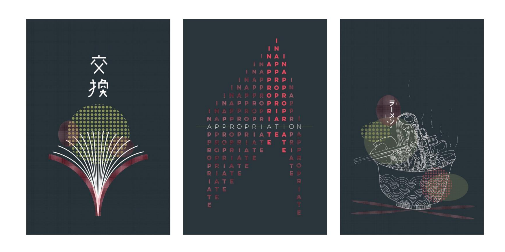
Figure 3: Manga and Anime: Infatuation and Adaptation of Japanese Pop Culture in the United States Senior Honors Thesis Poster Series