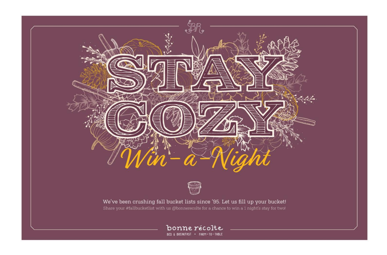
Figure 8: Bonne Récolte Event Poster