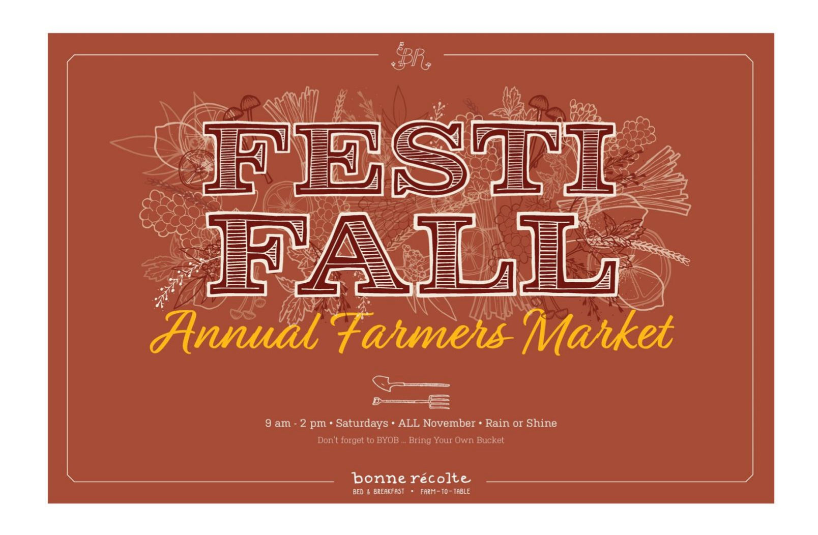
Figure 7: Bonne Récolte Event Poster