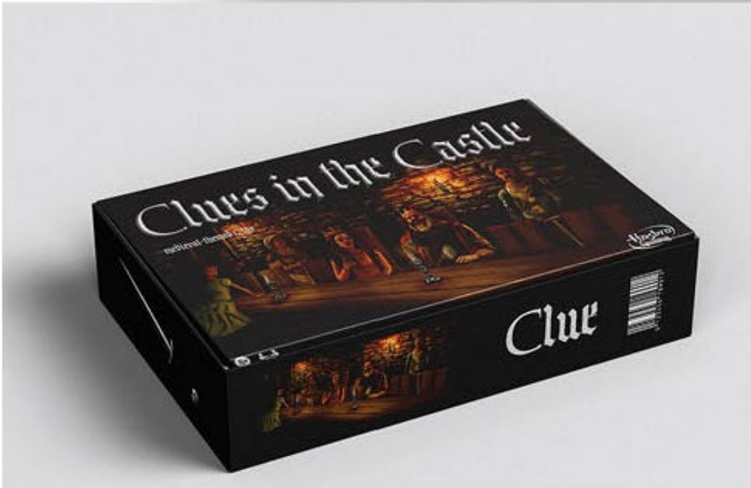
Figure 1: Board game design