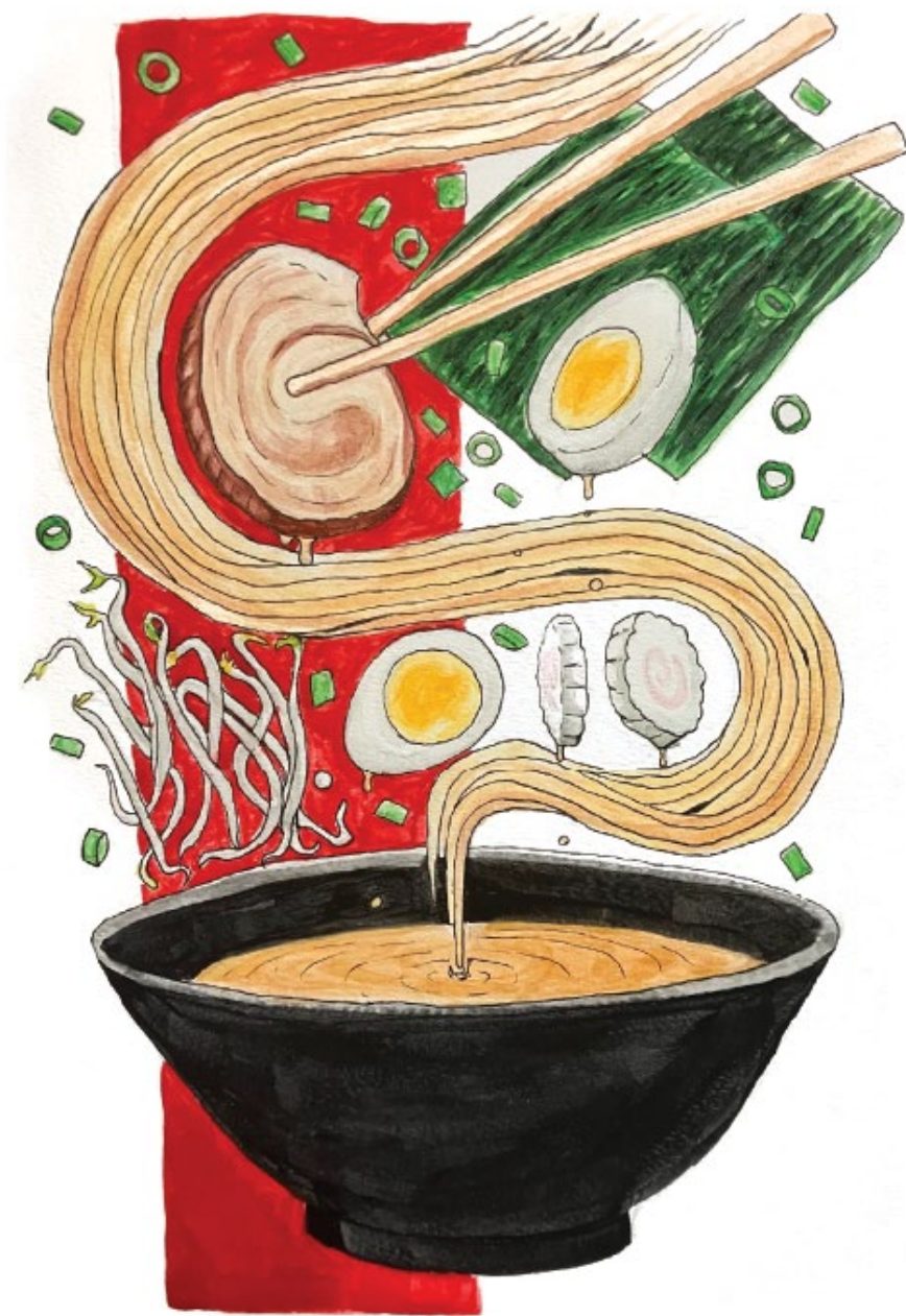
Figure 4: cookbook page