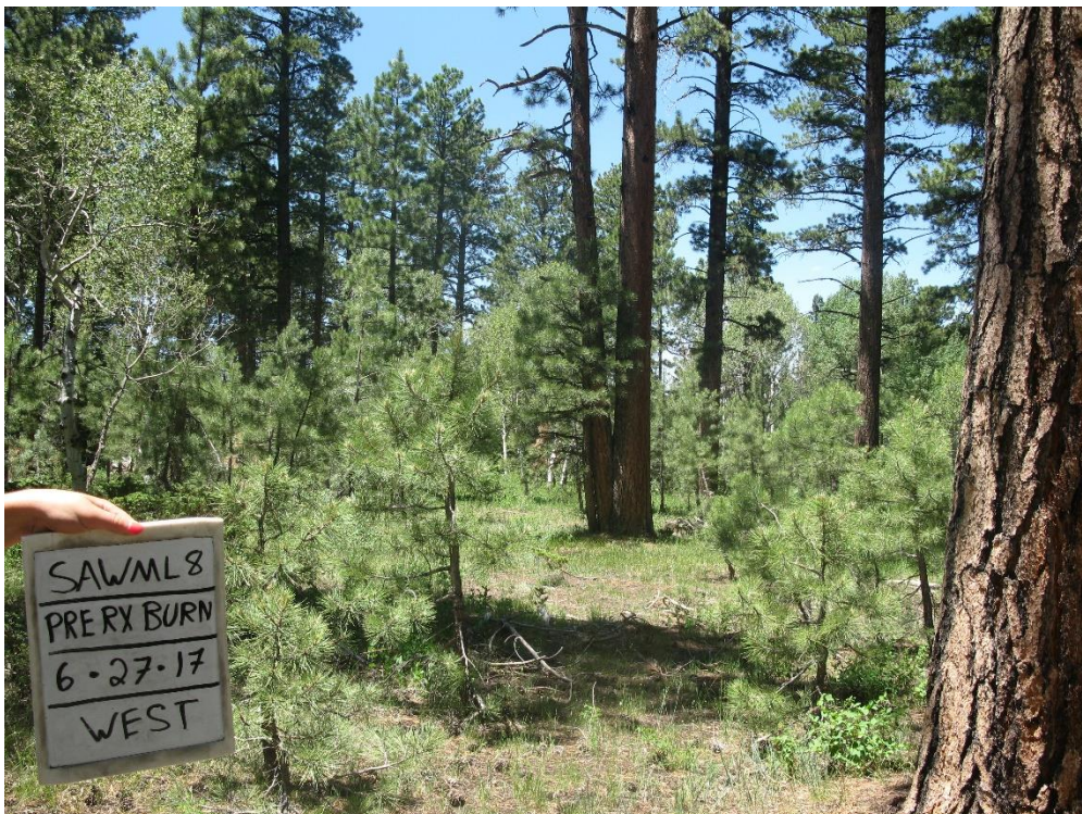
"Photo-point" taken in the Sawmill Mesa pre-prescribed burn treatment area. Photo is taken ~50 m from road within treatment area. Conjoined trees (center of photo) will be the landmark in the photo; future post-burn photo will attempt to recreate this same photo, illustrating post-burn conditions.