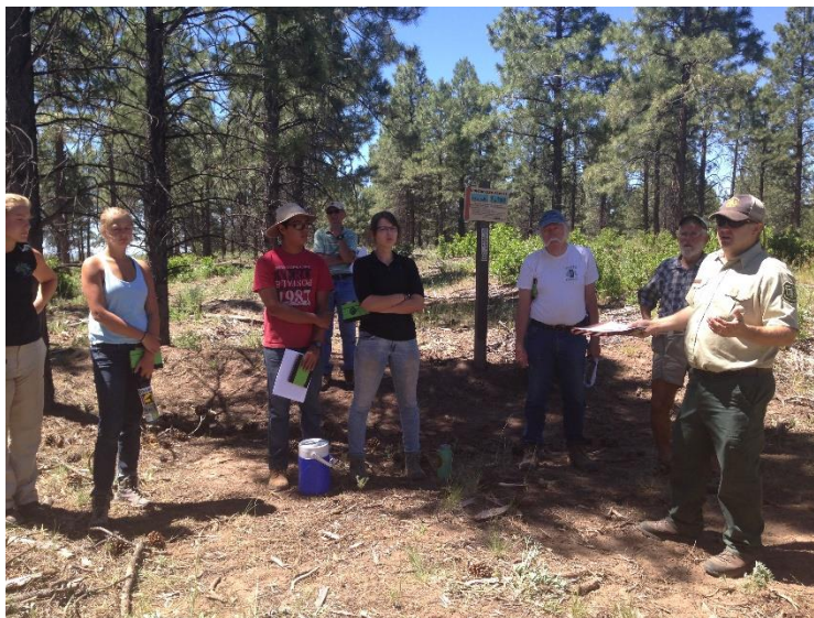
Forest Internship Program (FIP) interns participating in the Uncompaghre Plateau Collaborative Forest Landscape Restoration Program annual field trip in June 2017.

plots. Alternatively, photo-points could be added in untreated areas representative of larger monitoring area.