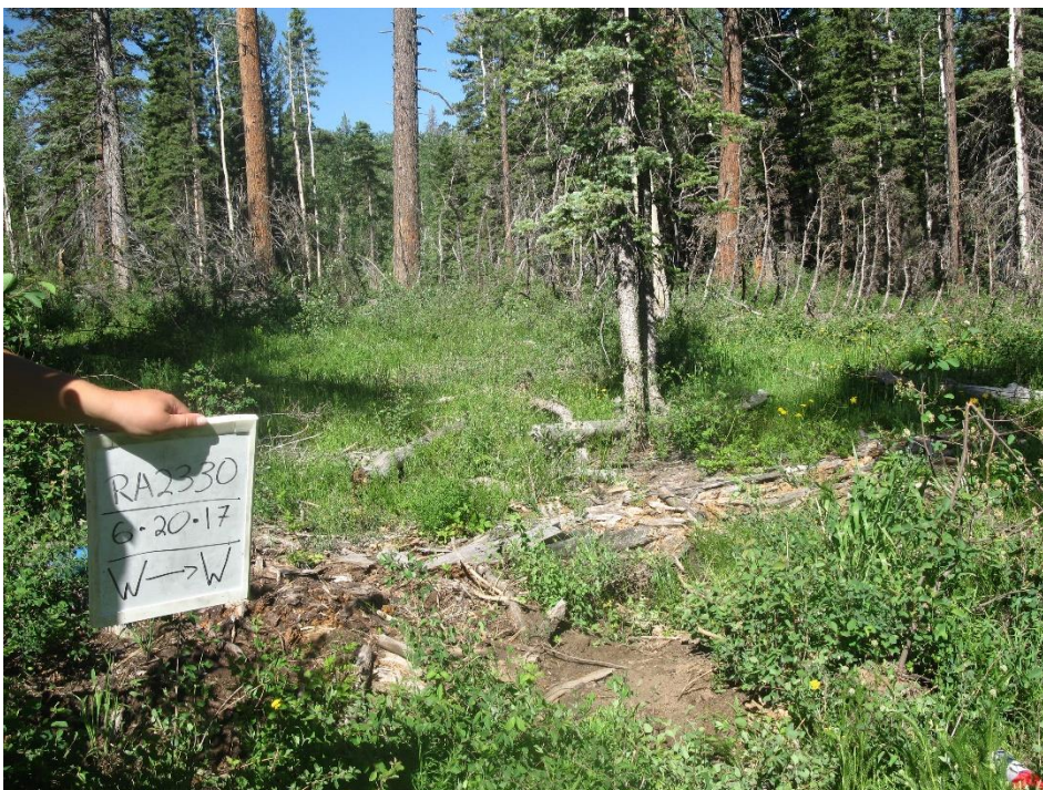
Photo of a post-mechanical, pre-prescribed burn in the Sawmill Mesa treatment area. Surface and ladder fuels may be burned by prescribed fire.