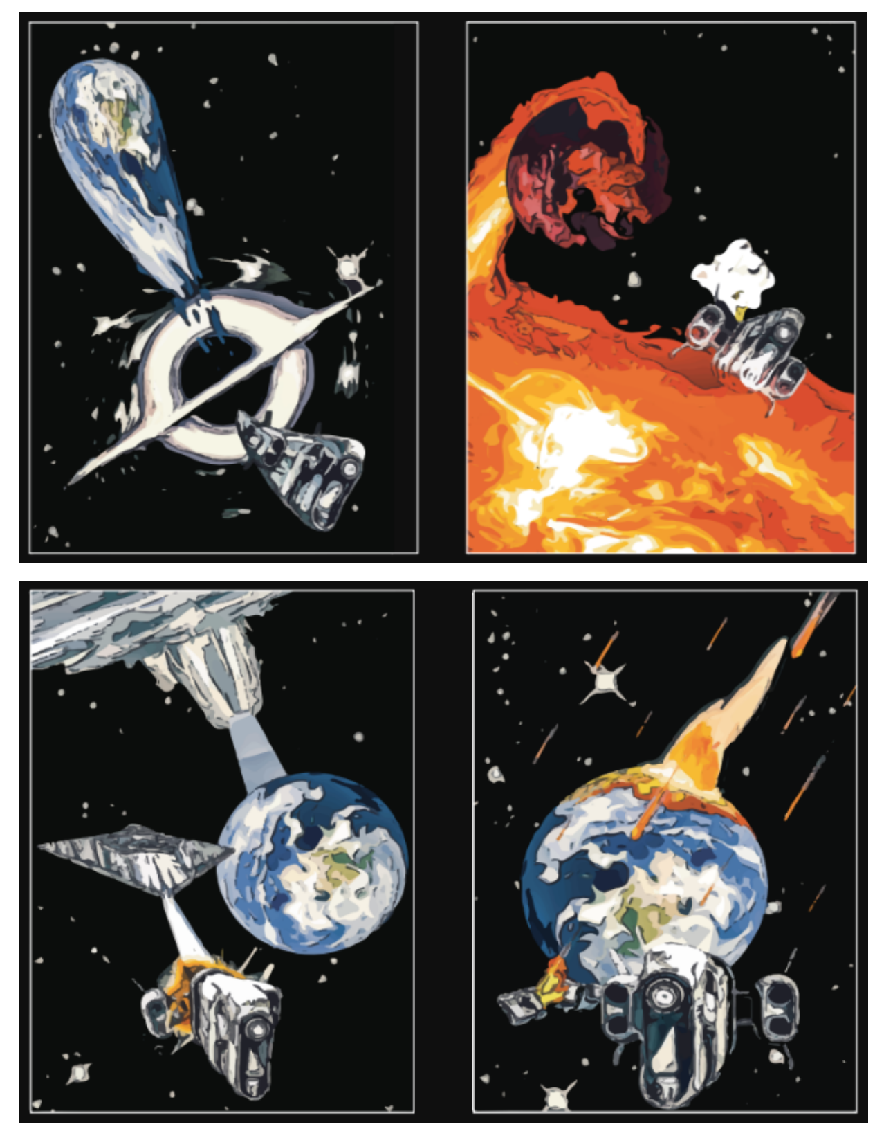
Figure 10: It might be time to leave