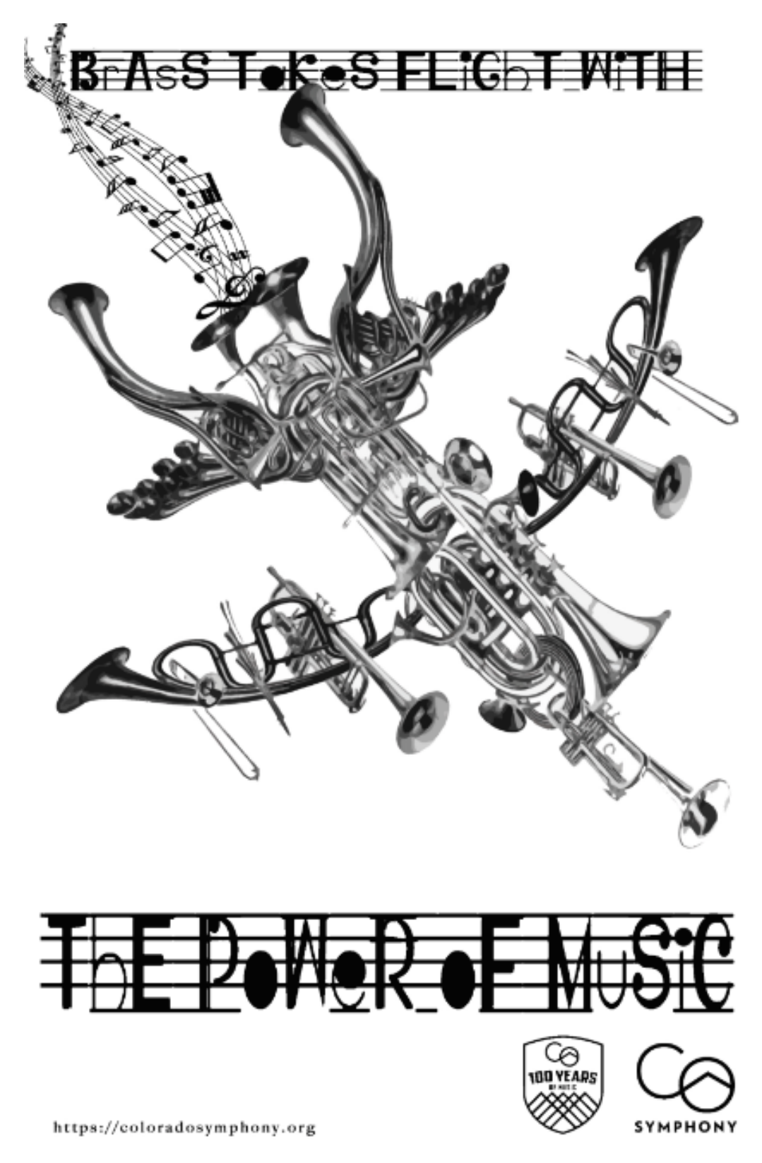
Figure 11: Power of Music