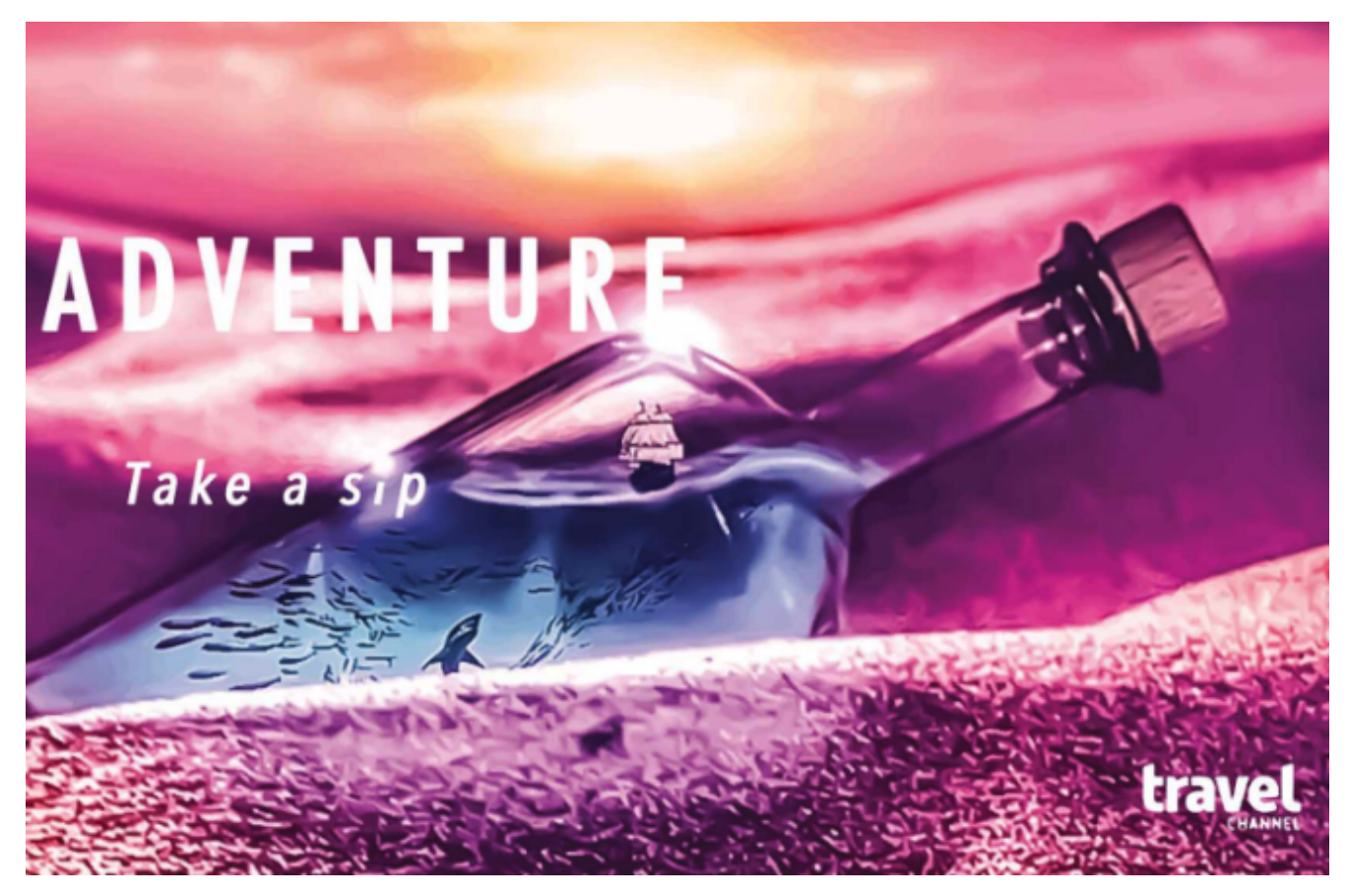
Figure 9: Take a sip