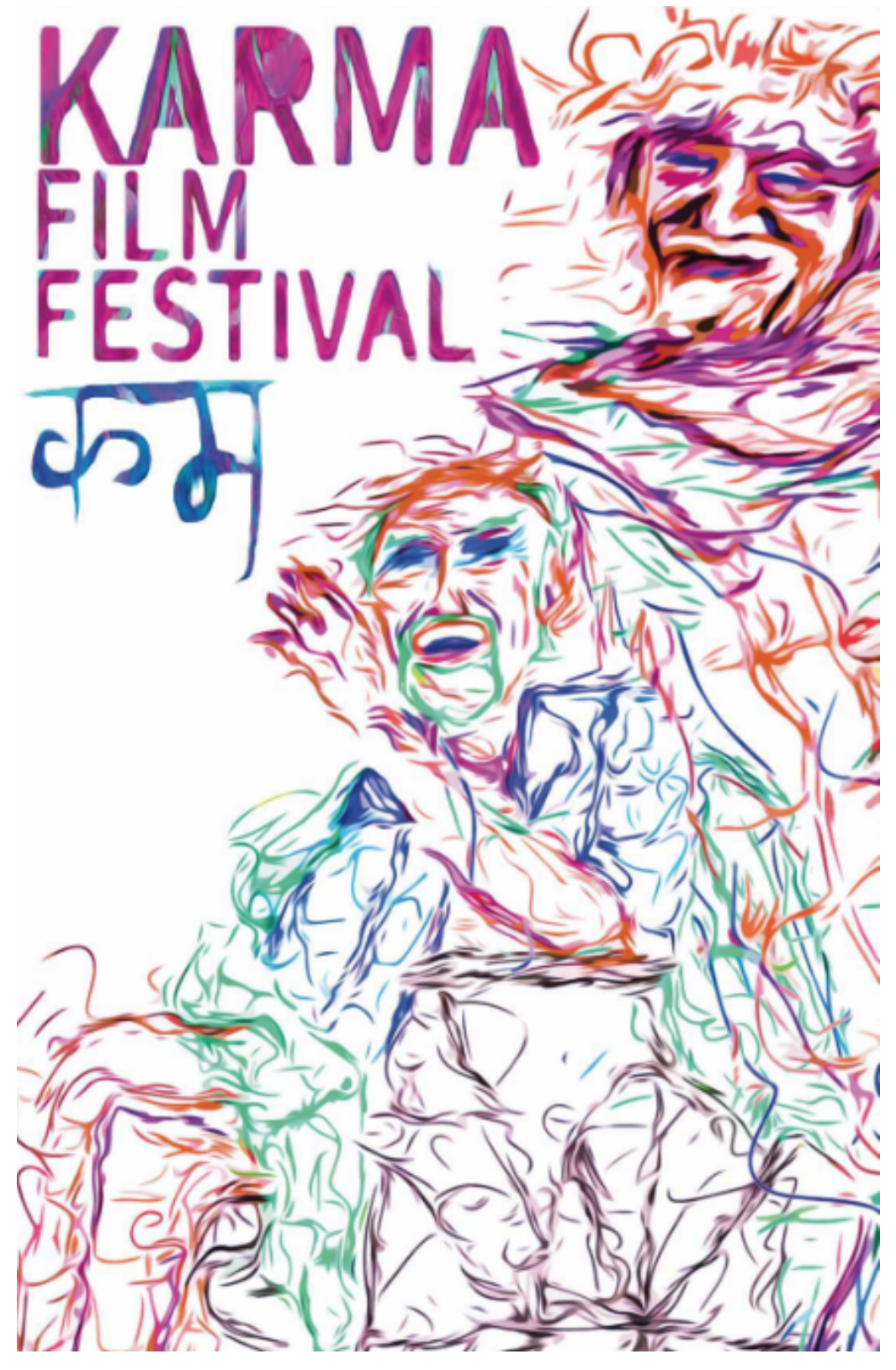
Figure 5: Karma Film Festival