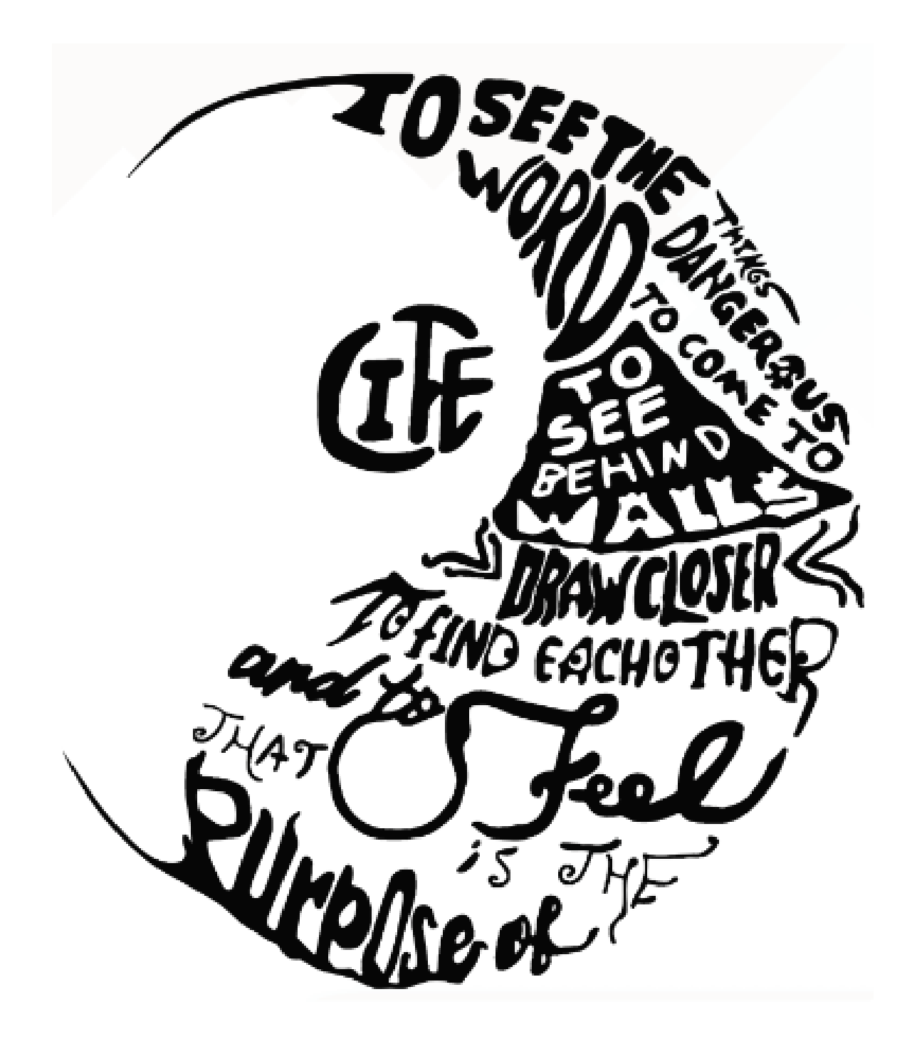
Figure 12: Life