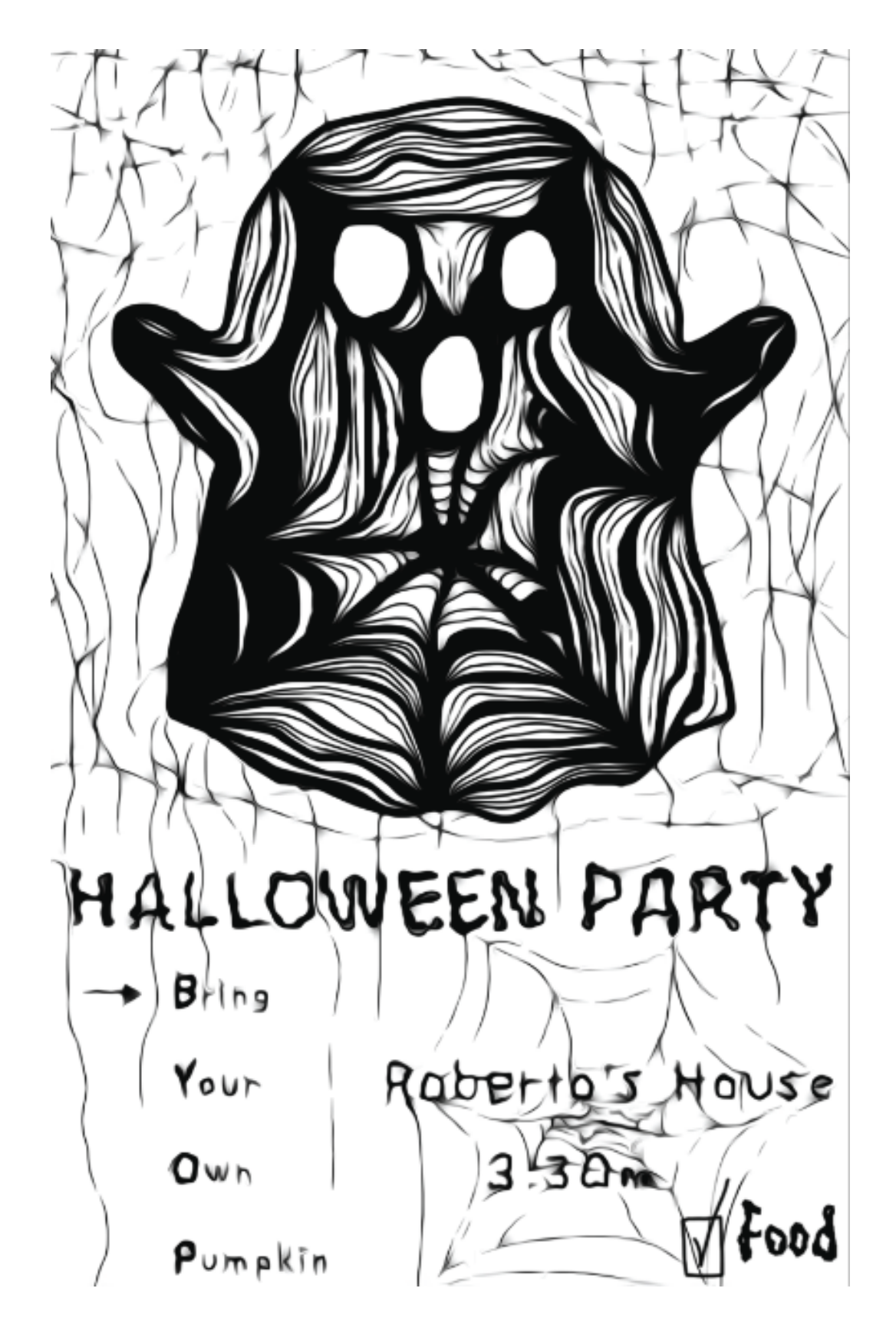
Figure 8: Halloween Party