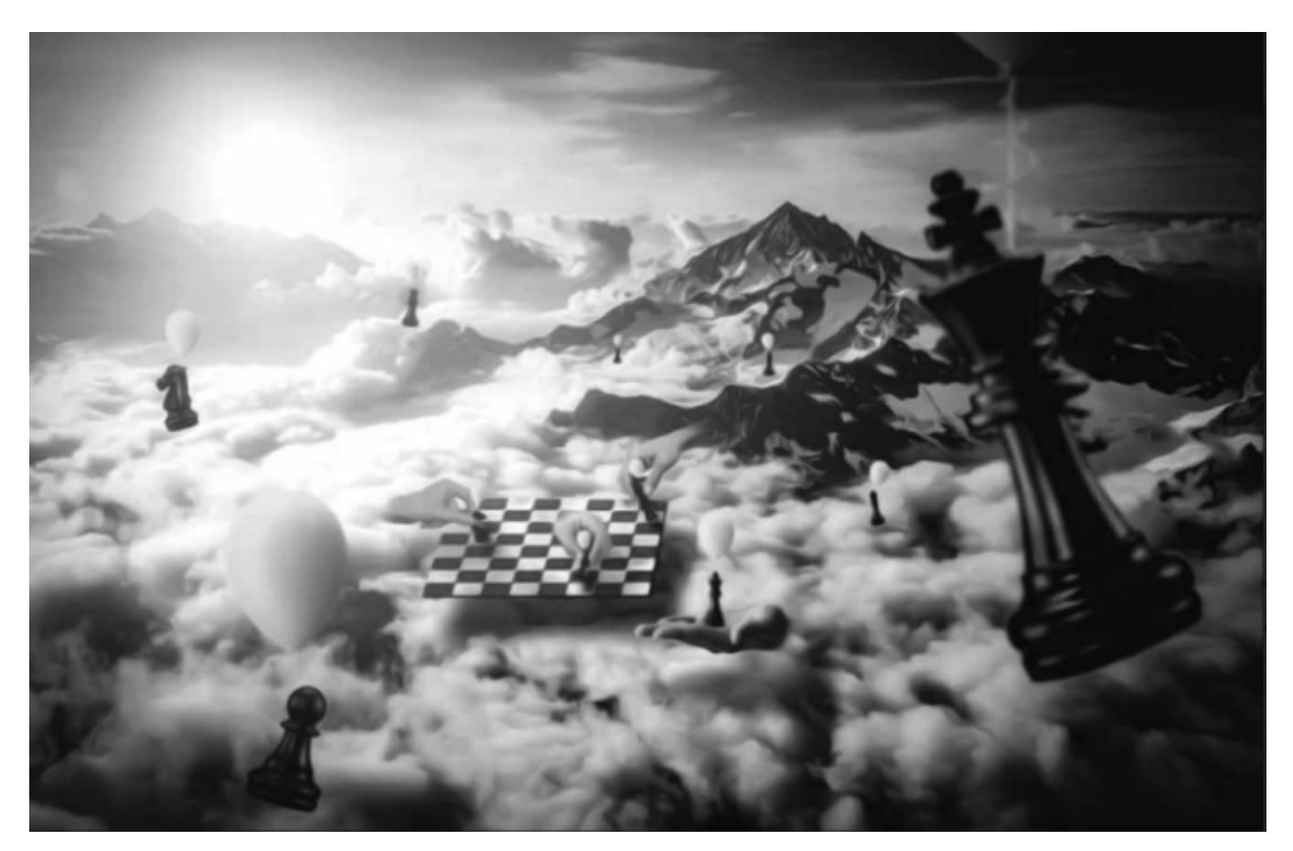
Figure 7: Dream Of Me