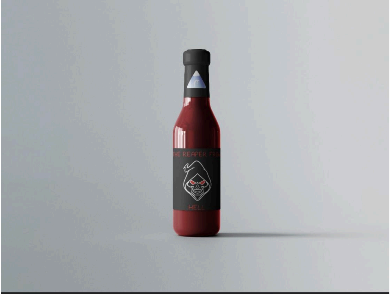
Figure 7: Hot Sauce Bottle