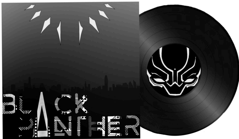
Figure 6: Black Panther Album Cover