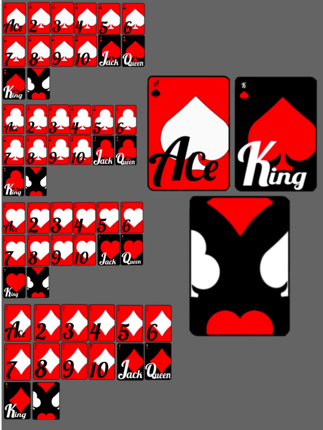
Figure 5: Playing Card Deck