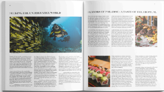
Figure 3: Explor New Horizons Magazine