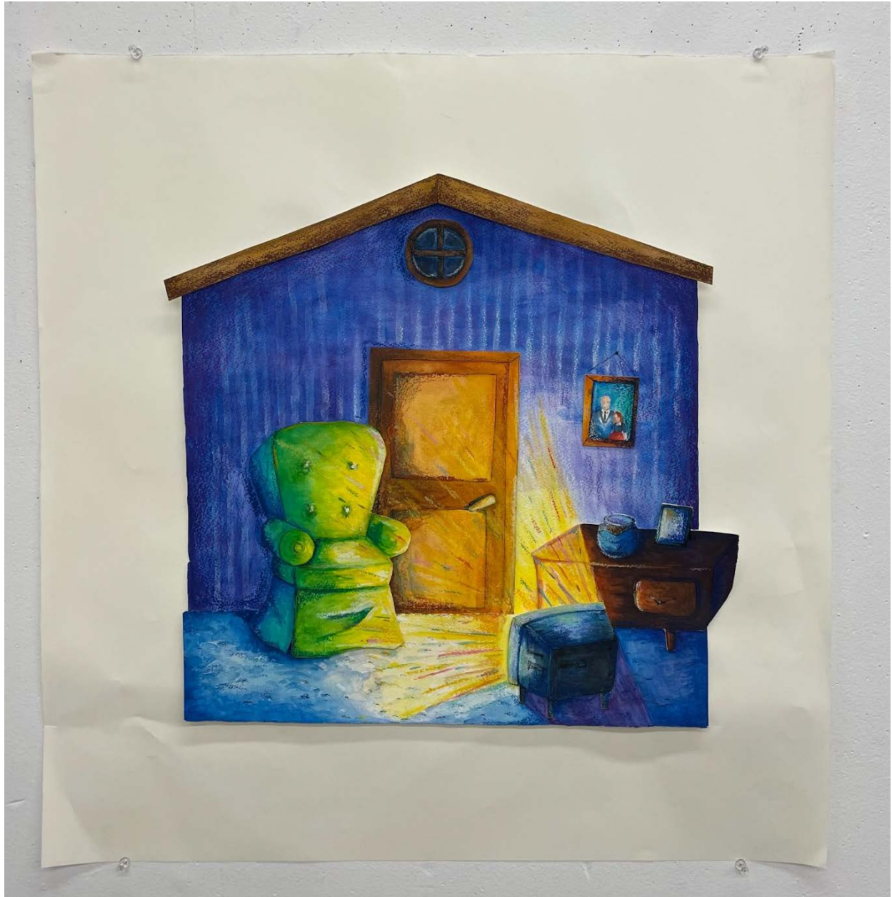
Figure 1: Tuesday 8:53