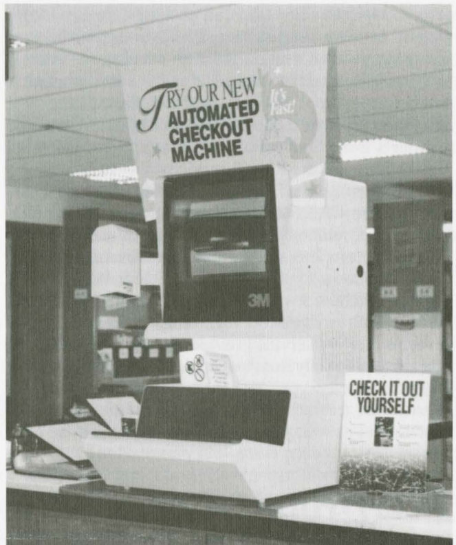
New 3M Self-check station at Morgan Library.

Some IDs do not come with a barcode. If your ID does not have a barcode, plan on taking five minutes to have one attached before your first trip to the Self-check station.