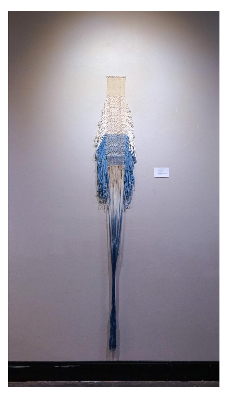
Figure 2: A Dip in Indigo – Unravel