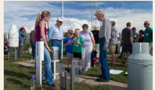
Weather Station observers discuss rain gauges with budding young scientists.

To learn more about the Colorado Climate Center, the weather station, and historical weather perspectives, visit http://climate.atmos.colostate.edu .