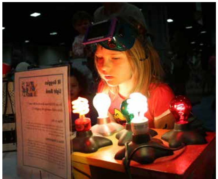
A young scientist is intrigued by one of many Little Shop of Physics displays.