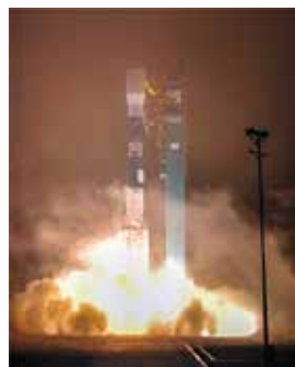
Delta-2 LV carrying the OCO-2 satellite

On Wednesday, July 2, NASA successfully launched the Orbiting Carbon Observatory-2. OCO-2 is a mission dedicated to measuring carbon dioxide from space with unprecedented accuracy, in order to help answer fundamental questions about sources and sinks of carbon dioxide, a