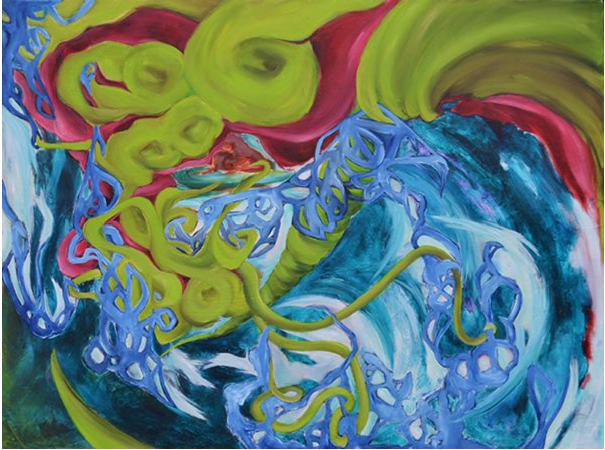
Figure 9: Maelstrom