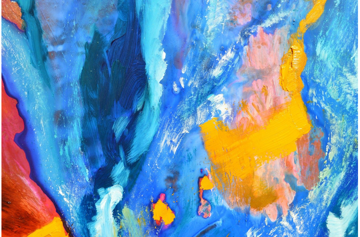
Figure 5: Refraction , Detail