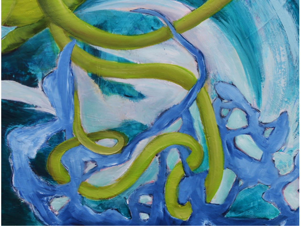
Figure 10: Maelstrom , Detail