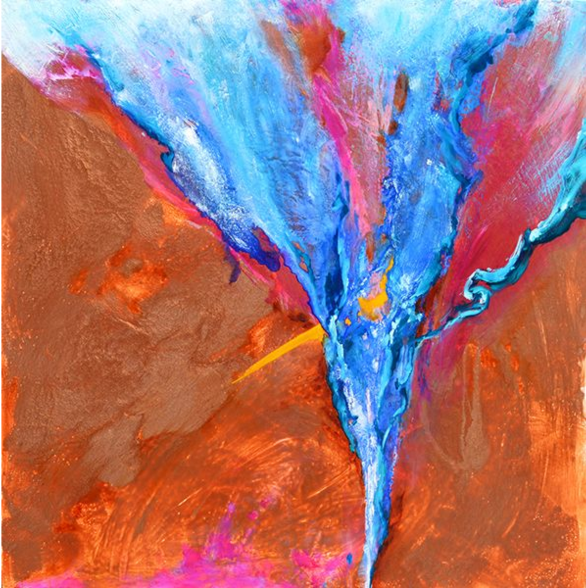
Figure 4: Refraction