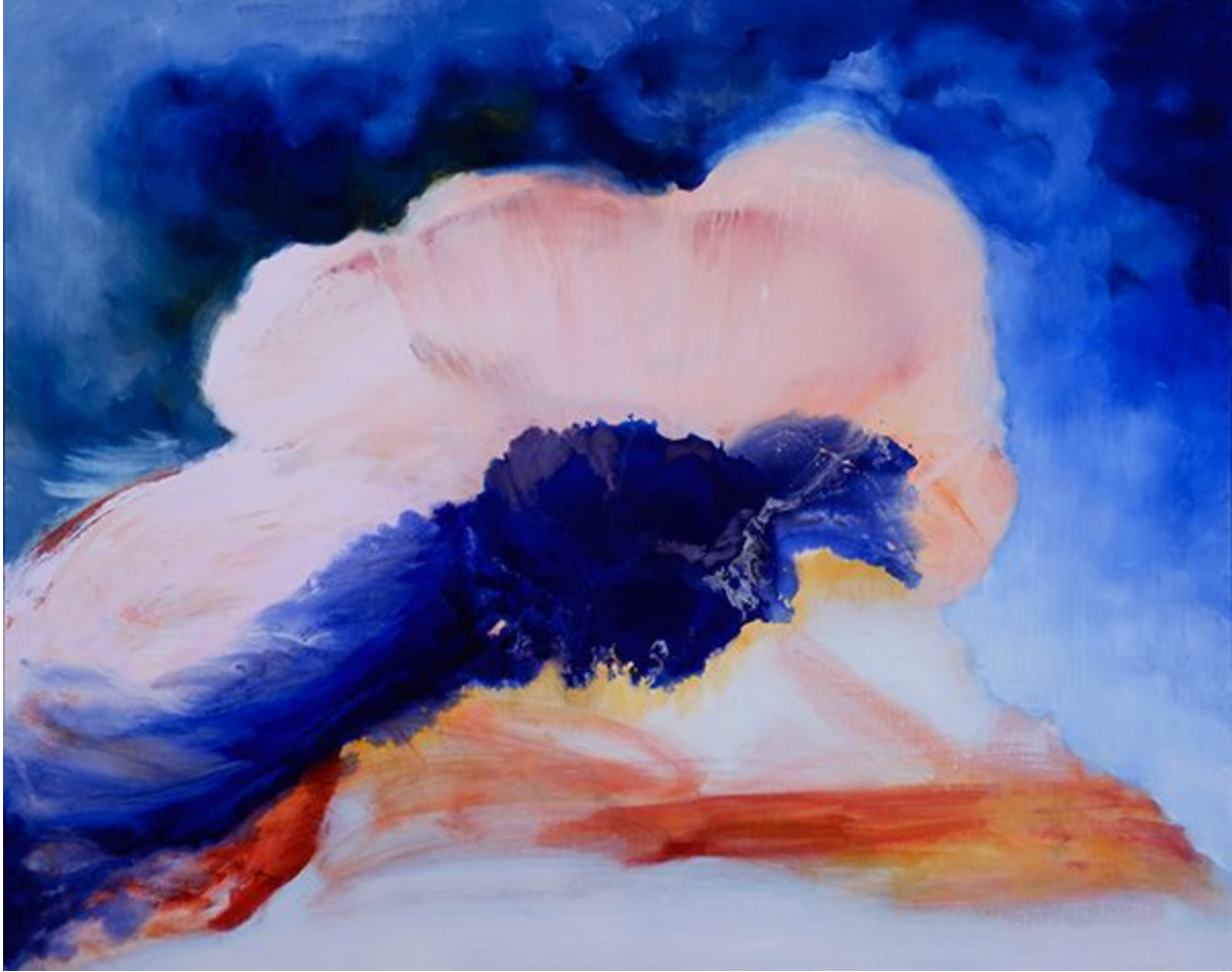
Figure 1: Divergence