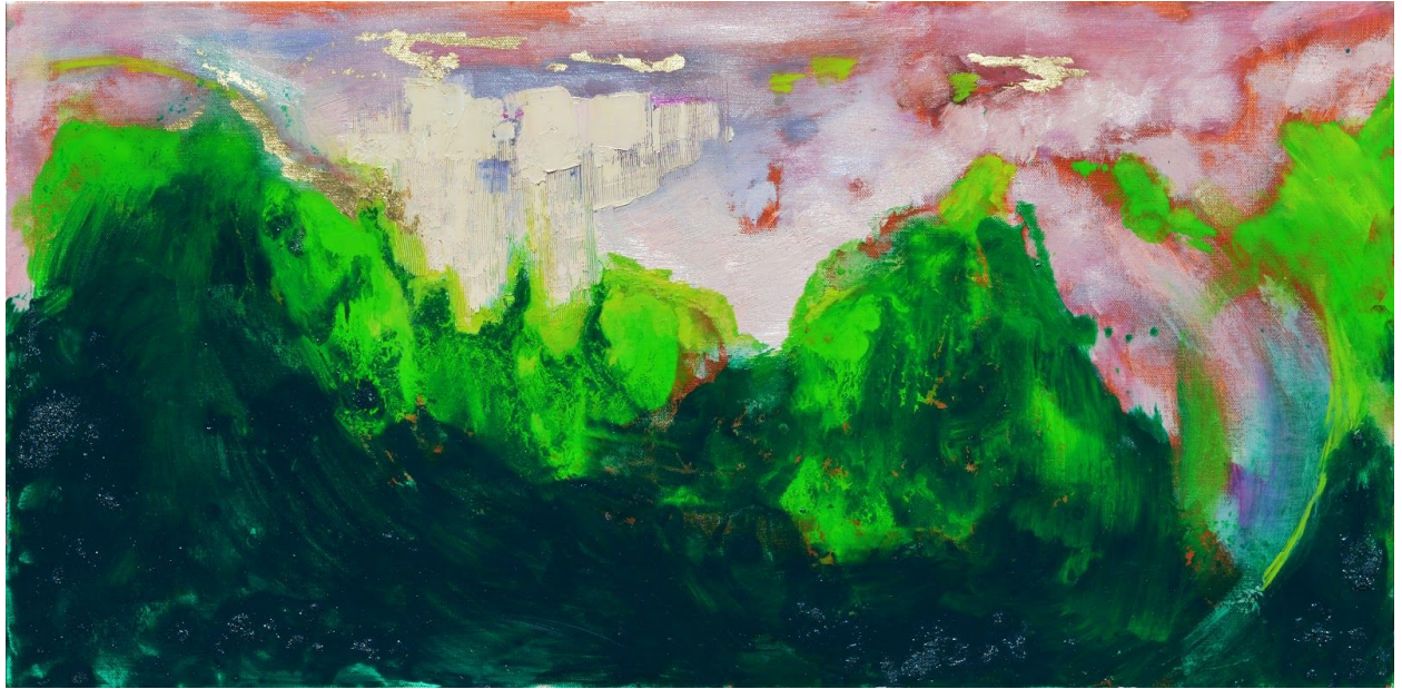
Figure 2: Dust