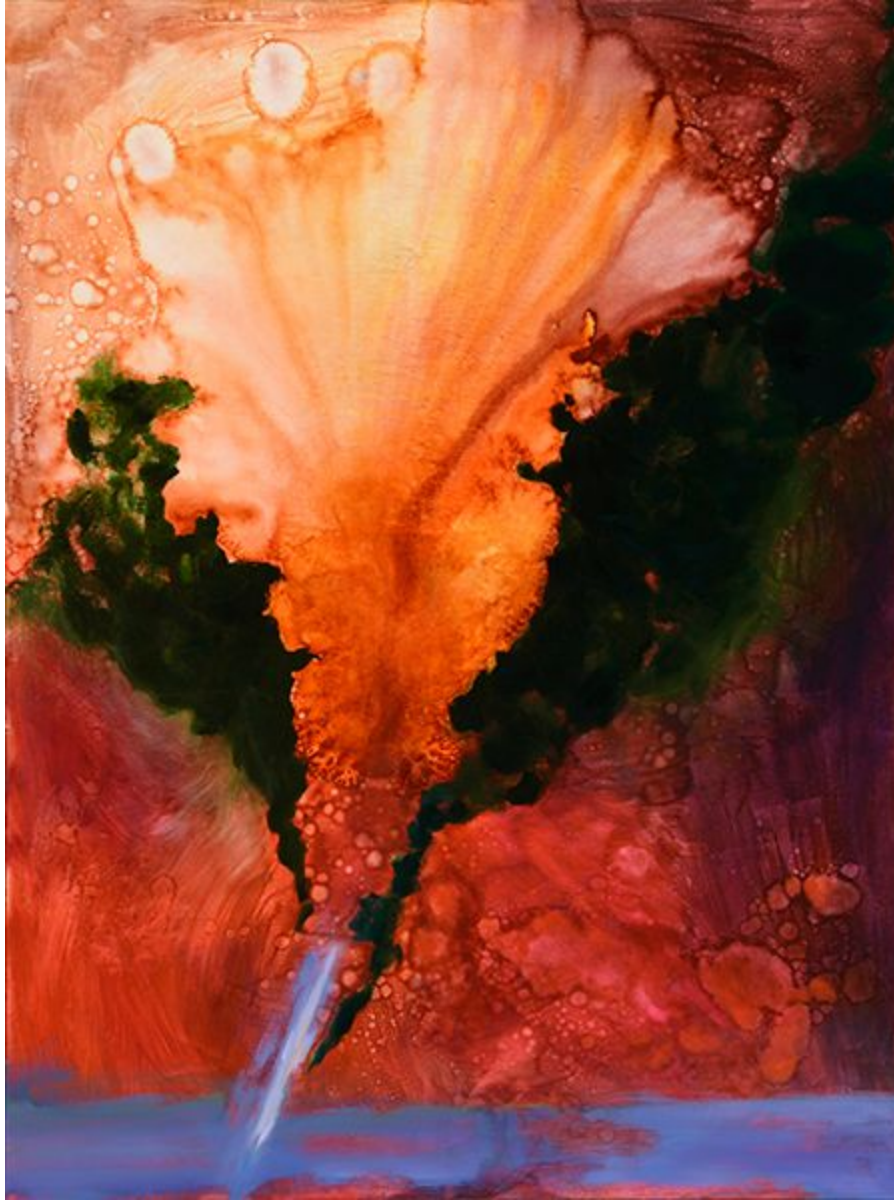
Figure 8: Mirage