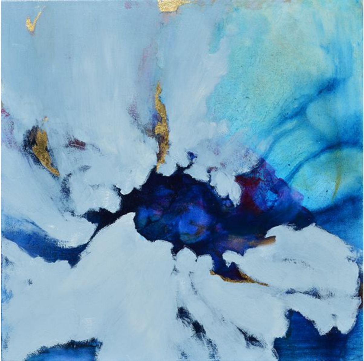
Figure 6: Coral Bleach , Surface 1