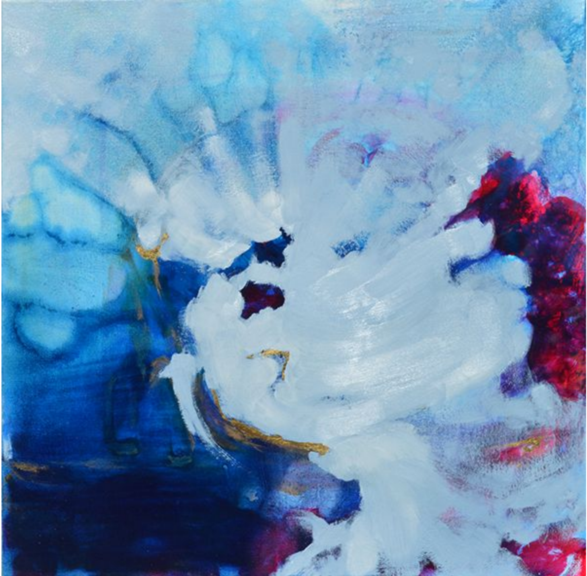
Figure 7: Coral Bleach, Surface 2