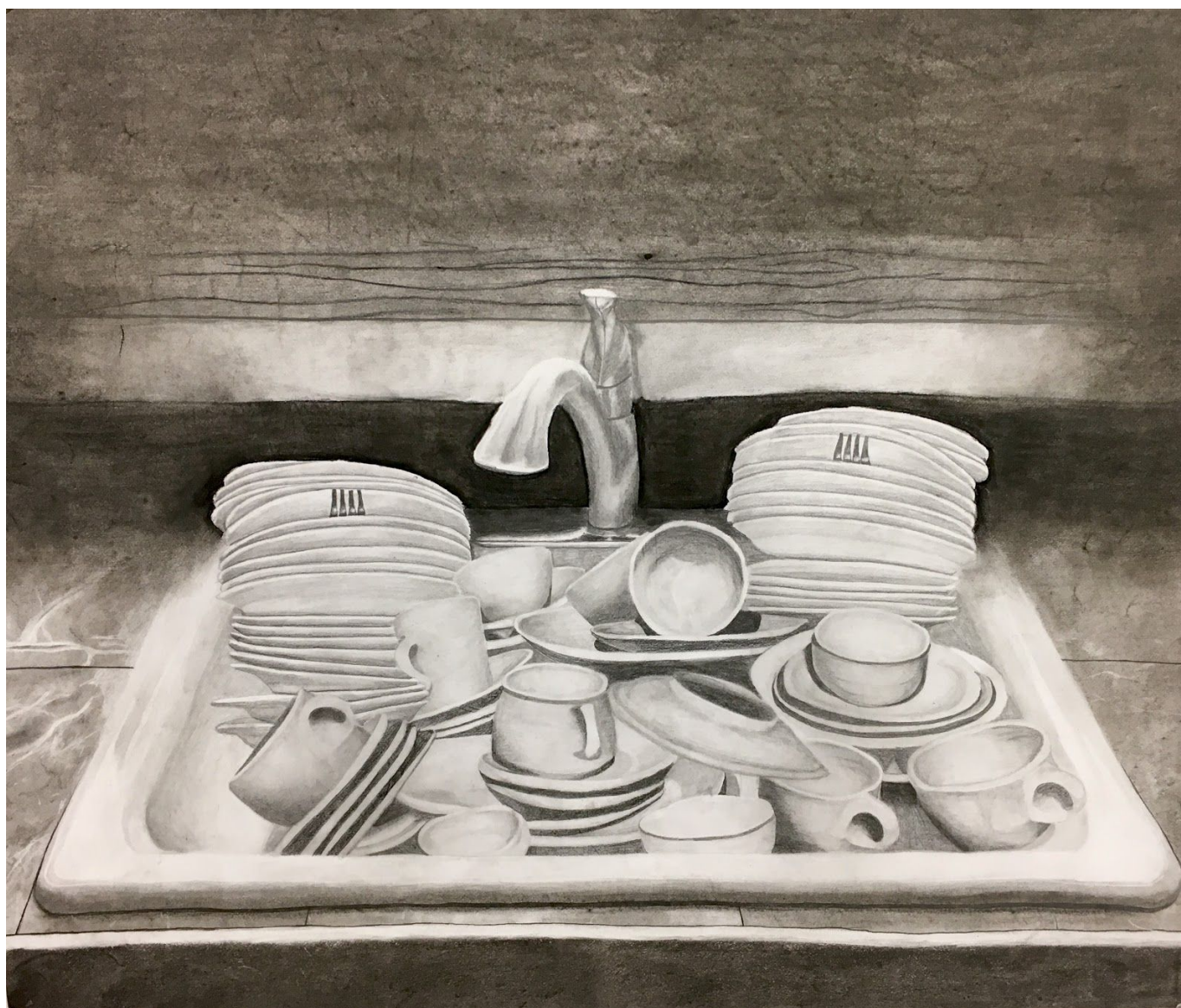
Figure 2: Family Dinner 6:00