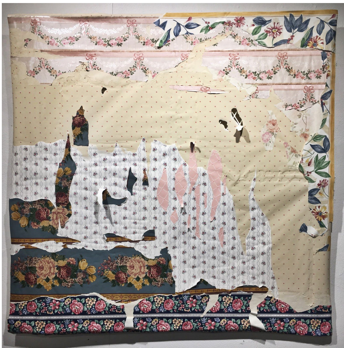
Figure 6: Girlhood