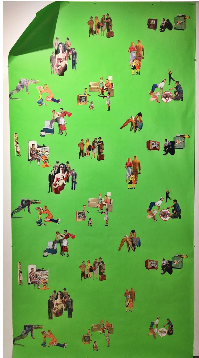
Figure 4: New Kind of Neighborhood