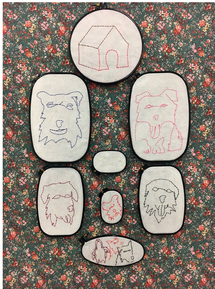
Figure 3: The Good Boys