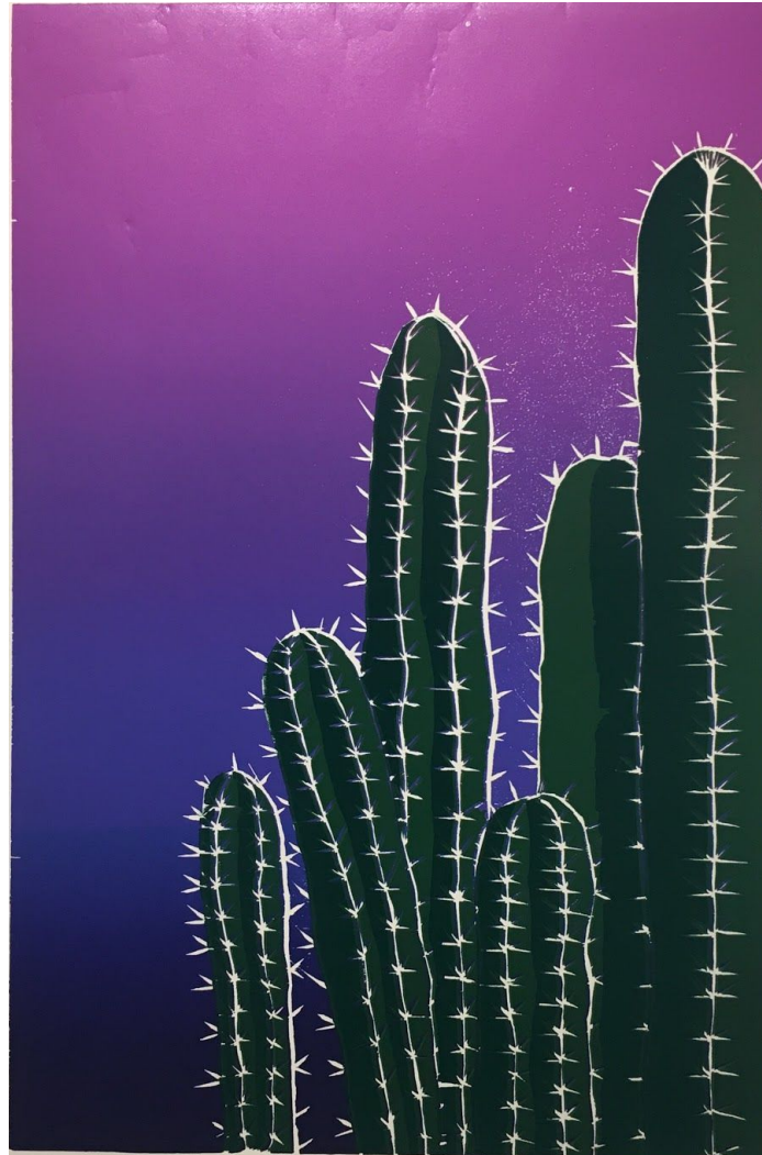
Figure 10: Evening Cactus