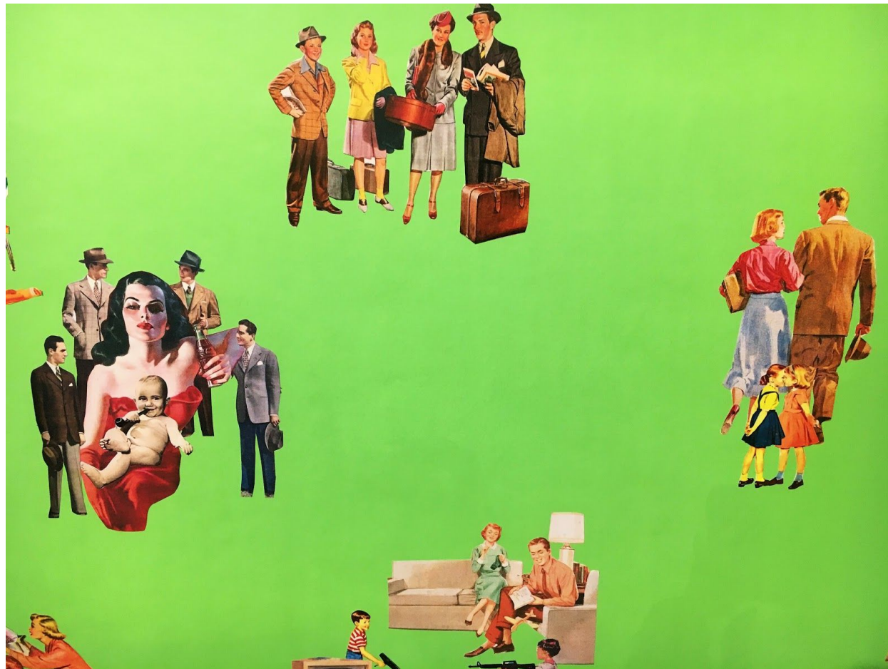
Figure 5: Detail of New Kind of Neighborhood