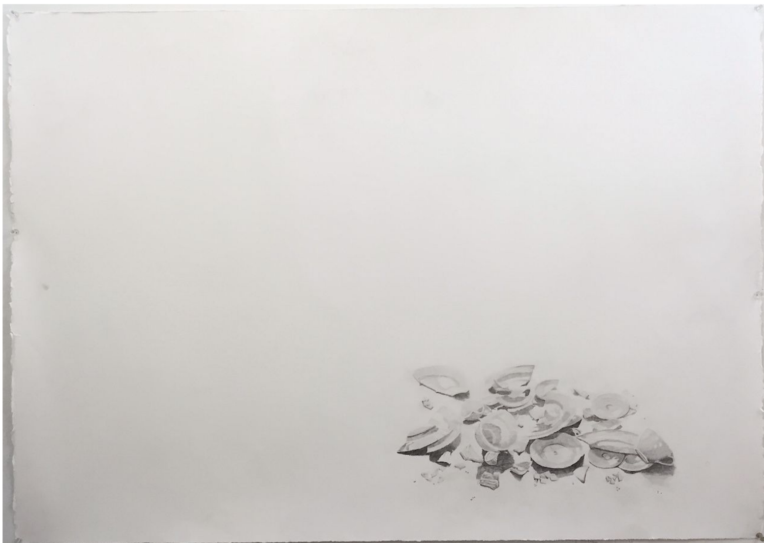
Figure 1: Family Dinner 0