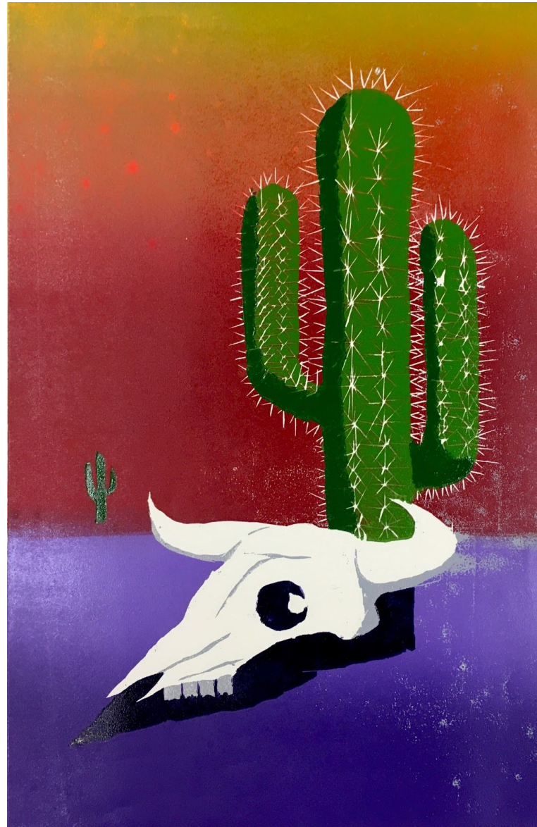
Figure 9: Desert Cactus