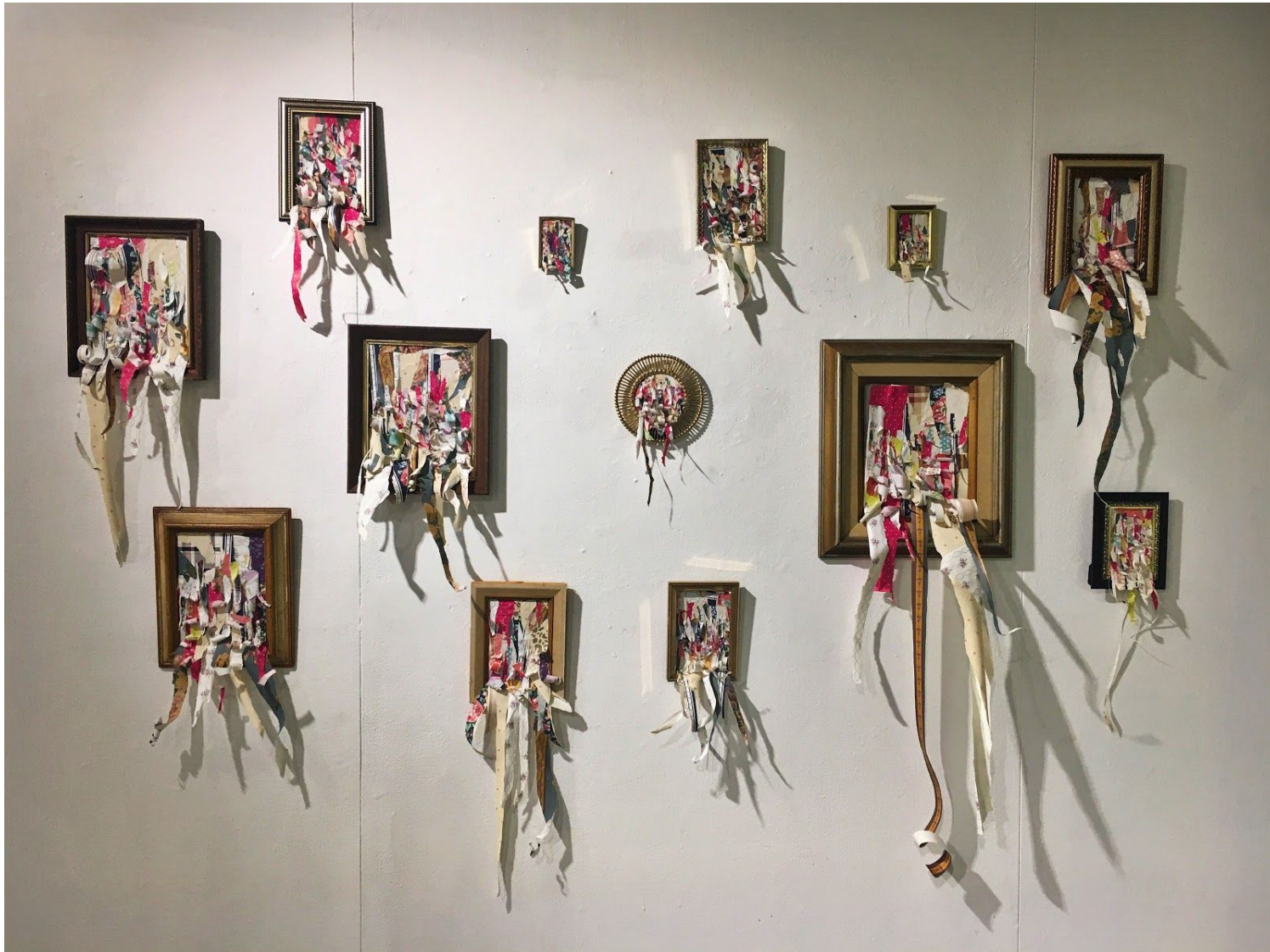
Figure 7: Fragments