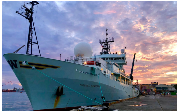
The R/V Thompson docked in Kaohsiung, Taiwan.